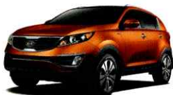
Techno Orange (M) BC/BL/O