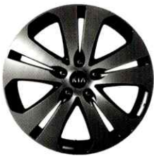
18" machined alloy wheels