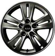
16" alloy wheels