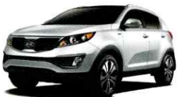
Clear White BC/BL/O