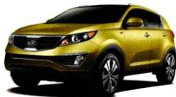
Electronic Yellow (M) BC/BL