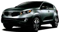
Mineral Silver (M) BC/BL