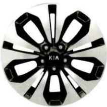
18" machined alloy sport wheels