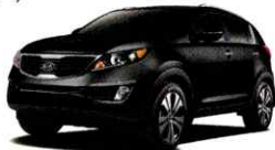
Black Cherry (P) BC/BL/O

BC = Steel Black cloth, BL = Steel Black Leather, O = Orange interior M = Metallic paint, P = Pearl paint.