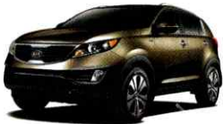
Sand Track (M) BC/BL