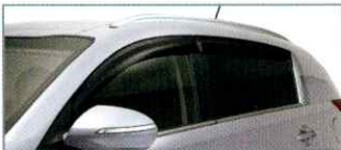
Side sport visor