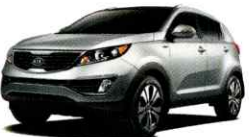
Bright Silver (M) BC/BL