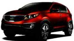
Signal Red (M) BC/BL/O