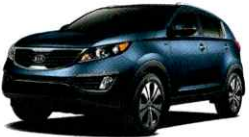
Vintage Blue (M) BC/BL/O