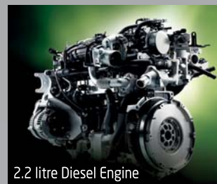
2.2 litre Diesel Engine

With a choice of either manual or automatic transmission on the diesel models and automatic transmission only on the petrol model, the Sorento caters for all lifestyles and driving needs. The Sorento is available in either a 2.2 litre diesel engine featuring an E-VGT (Electrical Variable Geometry Turbocharger), or a 3.5 litre V6 petrol engine featuring CVVT (Continuous Variable Valve Timing), both for better acceleration and fuel efficiency. The 2.2 litre diesel engine is a third generation common rail direct injection system that provides optimised control of the amount and timing of fuel injection through the ECU into the combustion engine chambers based on engine and driving conditions, thereby minimising gas emissions and resulting in high power and less noise.