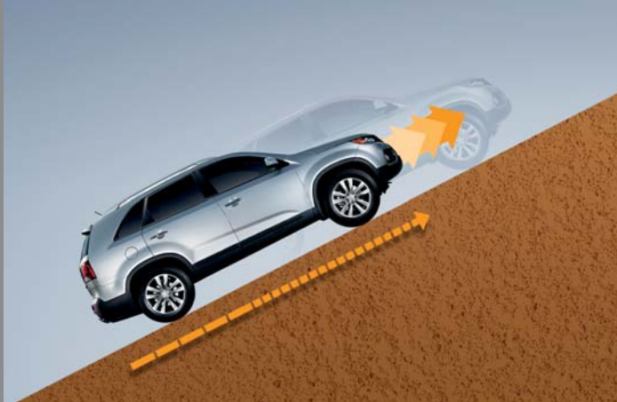
Hill-start Assist Control

Hill-start Assist Control prevents rollback when the brakes are initiated while driving uphill.