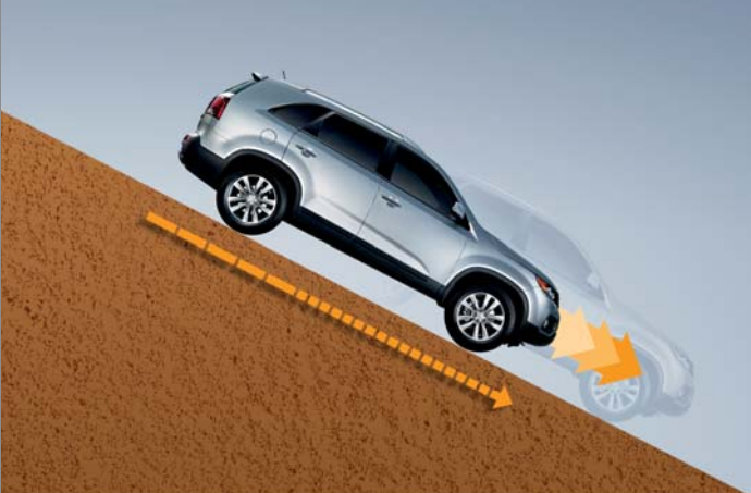
Downhill Brake Control

Downhill Brake Control keeps the vehicle at a constant speed when braking downhill.