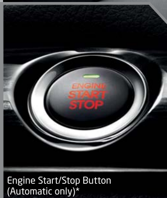
Engine Start/Stop Button (Automatic only)*