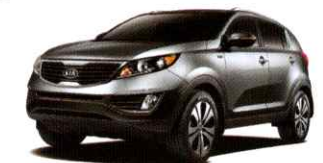
Shimmering Silver (M)