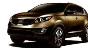
Sand Castle (M)