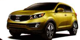
Citrus Yellow (M)