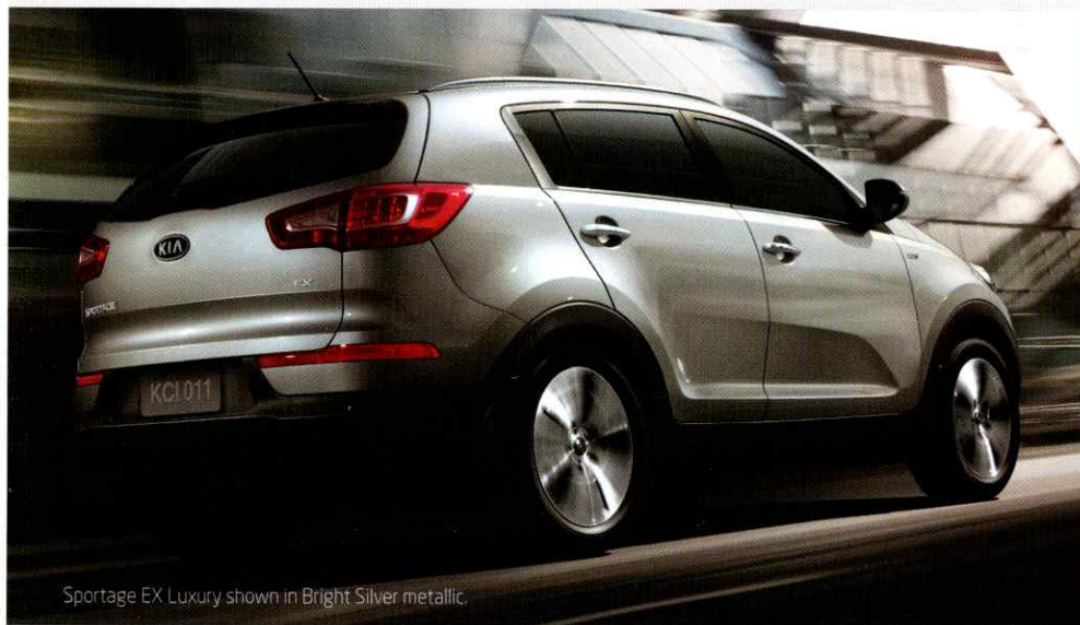
Sportage EX Luxury shown in Bright Silver metallic.

Can you picture yourself in anything less?