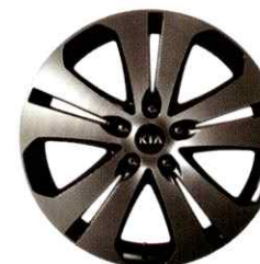
18" alloy wheels