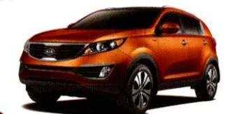
Orange Squeeze (M)