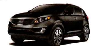
Black Cherry (P)