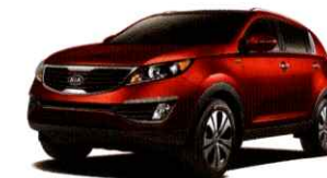
Berry Red (M)