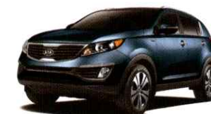
Vintage Blue (M)