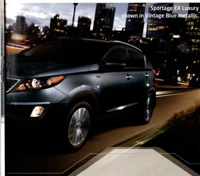
Sportage EX Luxury shown in Vintage Blue metallic.

The exterior and interior colours in this brochure are as close to the actual vehicle production colours as the printing process allows.