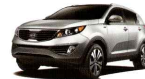
Bright Silver (M)