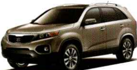
Titanium Silver (M) (BLK)