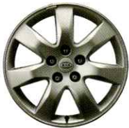
17" alloy wheel