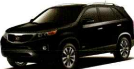
Ebony Black (B / BLK)