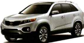
Bright Silver (M) (BLK)