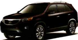
Dark Cherry (M) (BLK)