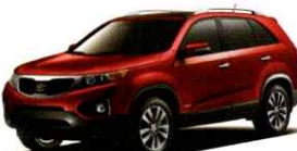
Spicy Red (M) (B / BLK)