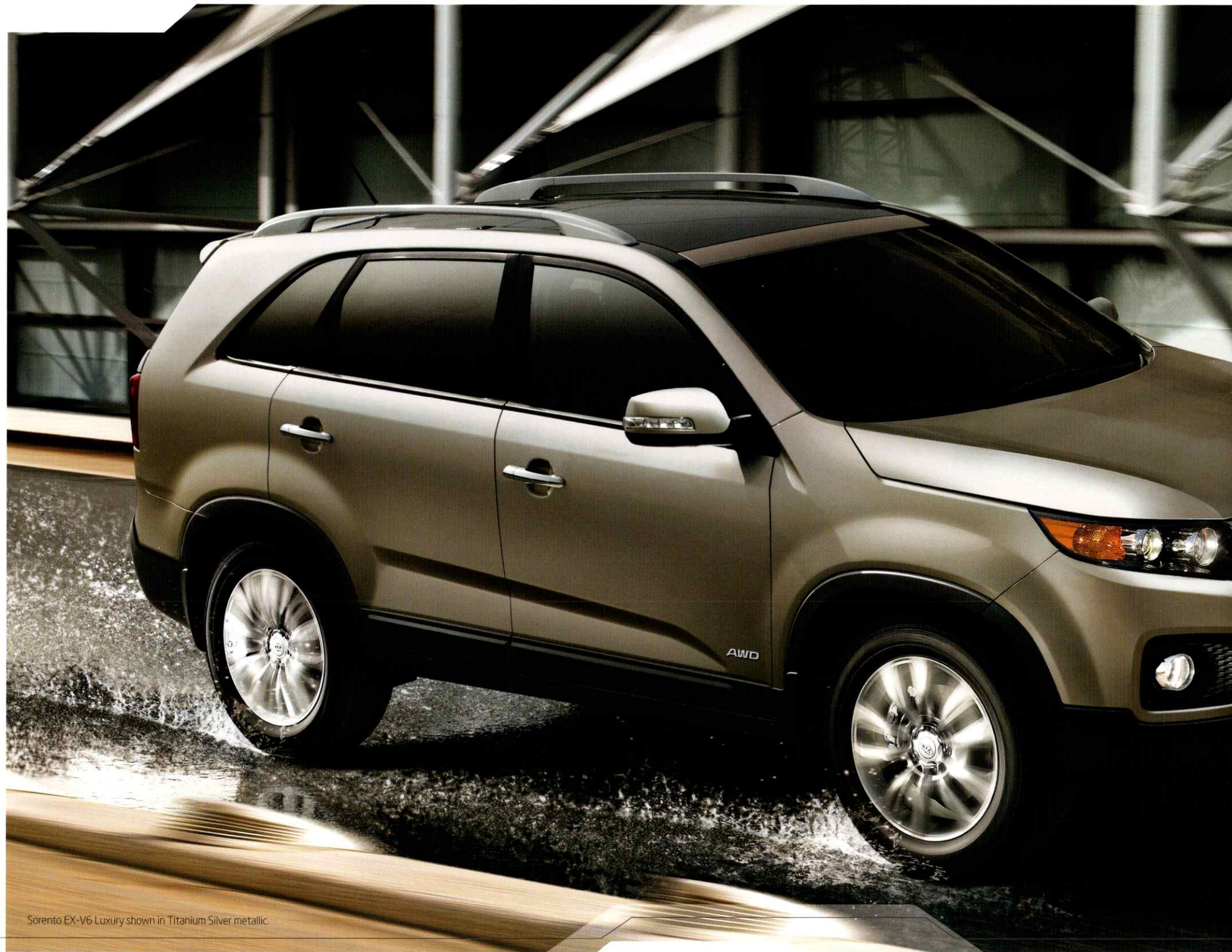
Sorento EX-V6 Luxury shown in Titanium Silver metallic.