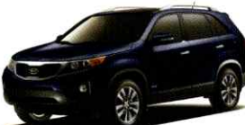
Blue Jeans (P) (B / BLK)