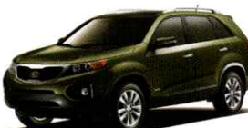
Khaki (P) (BLK)