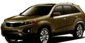
Java Brown (P) (BLK)