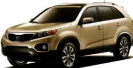
Sand Beige (M) (B / BLK)