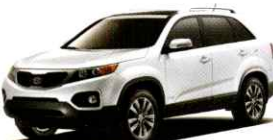
Snow White Pearl (P) (B / BLK)