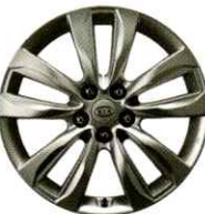
18" alloy wheel