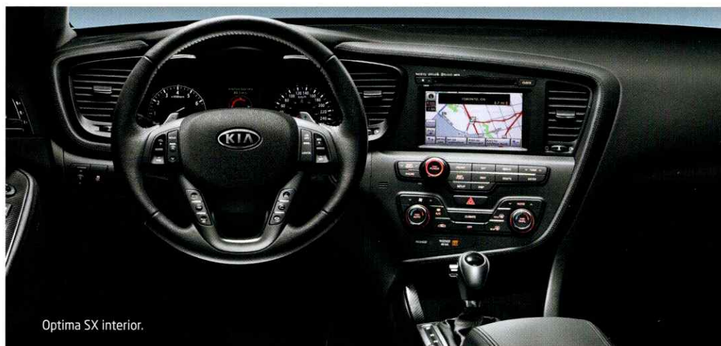
Optima SX interior.

Entertaining and Informing. Kia's exclusive UVO Powered by Microsoft ®7 is an available, cutting-edge entertainment, communication and information system that gives you voice-activated control over Optima's audio system, your MP3 player and your Bluetooth ® -enabled cell phone.