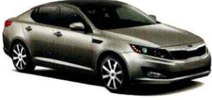
Satin Metal (M)