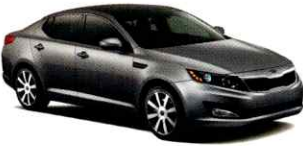
Platinum Graphite (M)