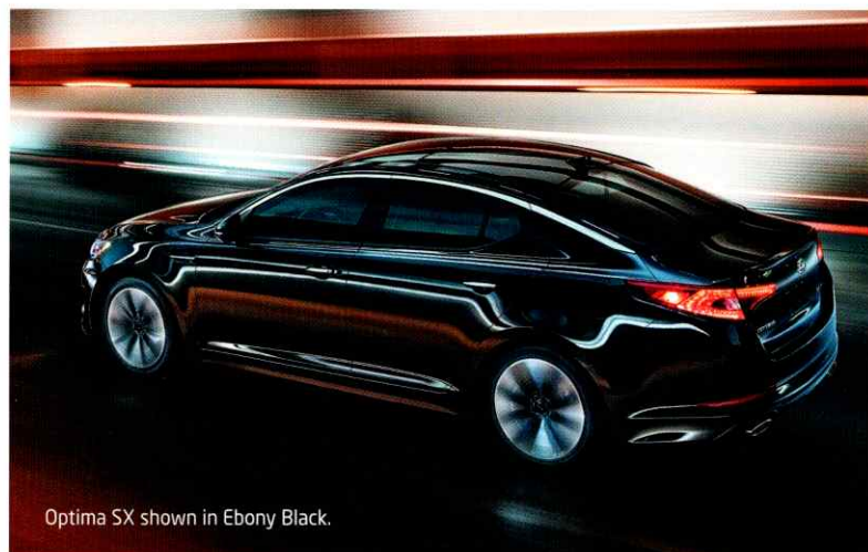
Optima SX shown in Ebony Black.

It's a new game now. Play it in the 2011 Kia Optima.