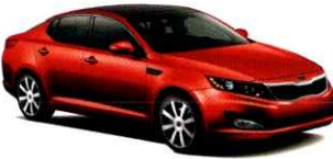
Spicy Red (M)