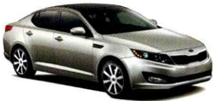
Bright Silver (M)