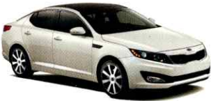
Pearl White (P)