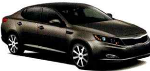
Metal Bronze (M)