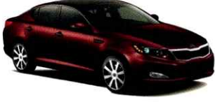
Dark Cherry (M)