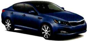
Santorini Blue (M)