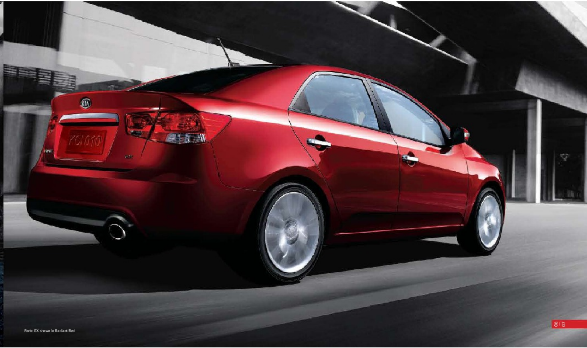
Forte EX shown in Radiant Red

A meticulously engineered chassis and four-wheel independent suspension work in harmony, blending dynamic handling and ride comfort. Under the hood, Forte LX and EX models provide a responsive 156-horsepower from a 2.0-litre engine with continuously variable valve timing (CVVT) for outstanding fuel economy, while the 2.4-litre dual CVVT engine in the Forte SX puts an exuberant 173 horsepower at your command.