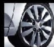
17" 10-spoke alloy wheels