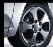
16" 5-spoke alloy wheels