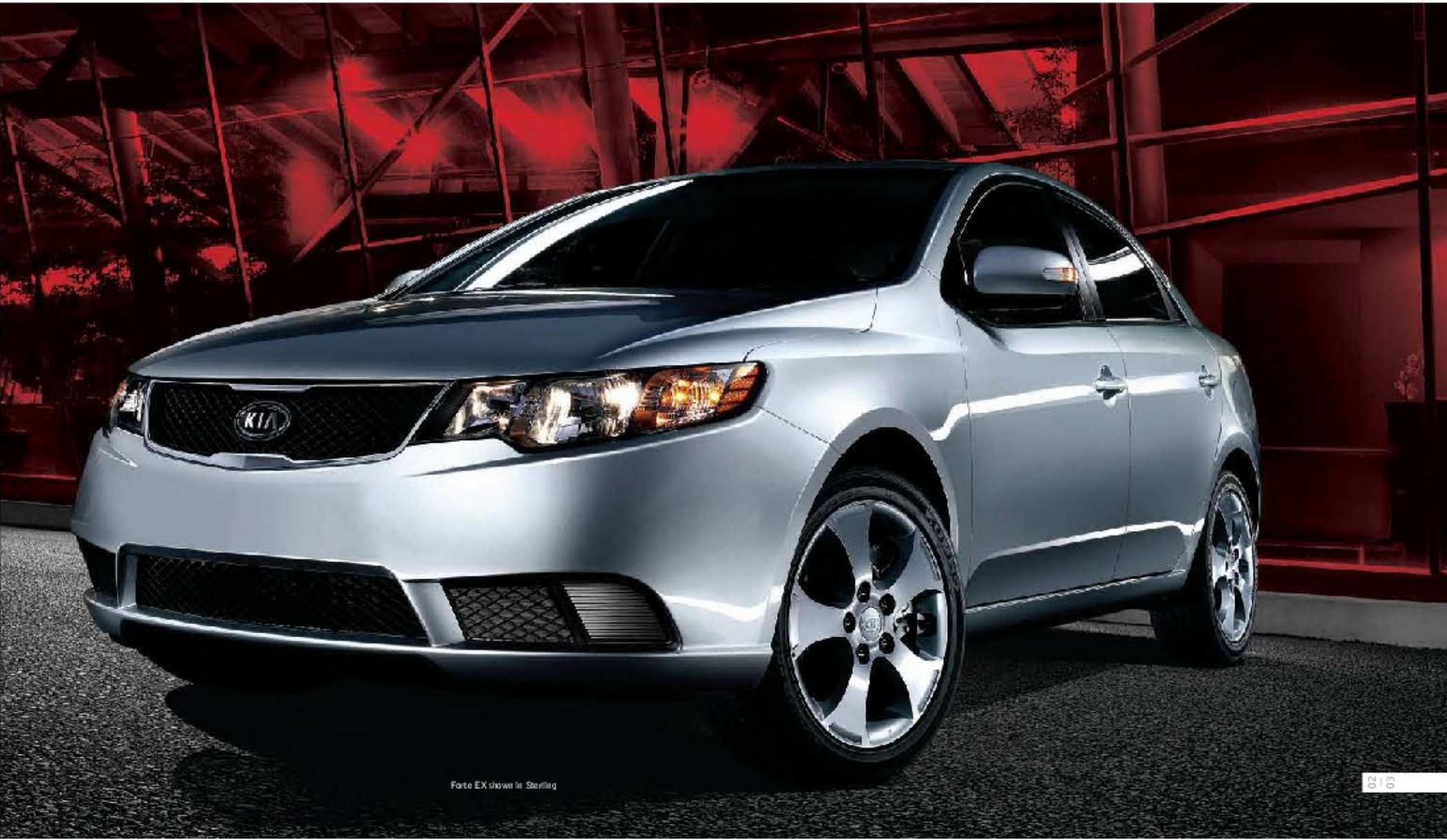
Forte EX shown in Sterling

THE ALL-NEW 2010 FORTE DRIVE BOLD. FORTE