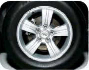
16" x 6.5" 5-spoke alloy wheels

* Some restrictions apply. Visit www.nhtsa.dot.gov/ncap for full details. For more information on our 5-5-5 Total Care Ownership Coverage, call us at 1-877-542-2886. ††NHTSA (National Highway Traffic Safety Administration) test results. All information contained herein was accurate and correct at the time of printing. Kia Canada Inc. reserves the right to make changes at any time without notice, and without any obligations as to colours, materials, specifications, features, accessories, packages, models and any applicable programs. Some vehicles shown may include optional equipment or may not be exactly as shown. Kia Canada Inc., by the publication and dissemination of this material, does not create any warranties, either expressed or implied, to any Kia products. See your Kia dealer or website for further details. SIRIUS logo and related marks are trademarks of SIRIUS Satellite Radio Inc. Torque-on-Demand® is a registered trademark of Borg-Warner Automotive, Inc. Reproduction of the contents of this material without the expressed written approval of Kia Canada Inc. is prohibited. © Copyright 2008 Kia Canada Inc. Printed in Canada, August 2008.