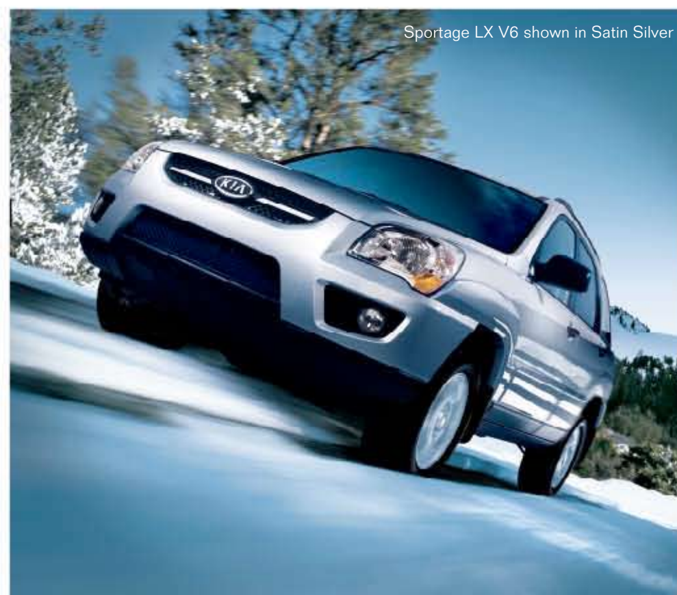
Sportage LX V6 shown in Satin Silver

Sportage forges ahead steadily in any driving conditions. And you can rest easy because it's extensive array of safety features are second to none. Standard features include four-wheel disc brakes with anti-lock braking system (ABS), electronic stability control (ESC), traction control system (TCS) and electronic brake-force distribution (EBD), which all monitor your vehicle's movement, instantly distributing engine or braking power as needed to allow you to keep control.