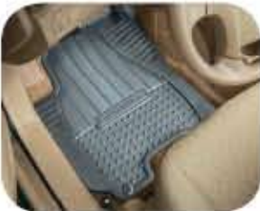
All-weather floor mats