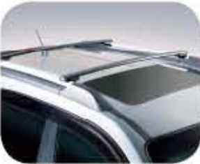
Roof rack crossbars