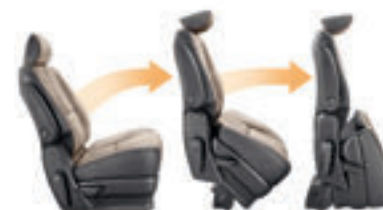
2ND-ROW SLIDE-N-STOW® SEAT DESIGN