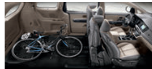
SLIDE-N-STOW® 2ND ROW & 3RD ROW STOWED 13