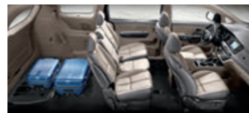
FOLD-IN-THE-FLOOR 3RD-ROW SEATS 13