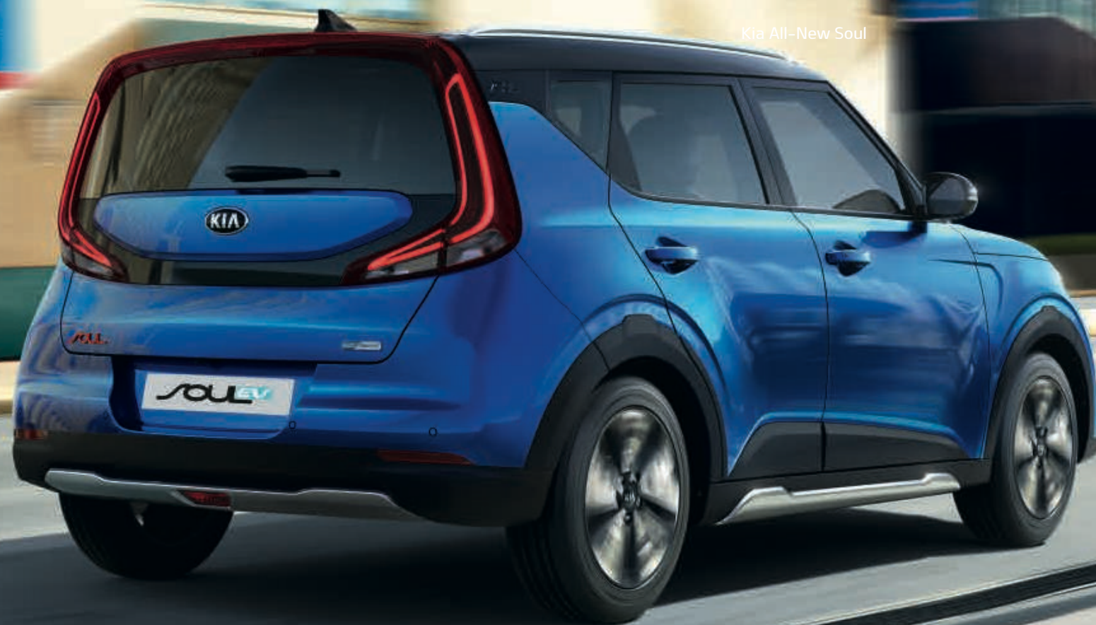
Kia All-New Soul

The All-New Soul EV celebrates its personality from every angle! From behind, the iconic 3D muscular rear design showcases futuristic-looking wrap-around LED rear lamps, surrounding the vertical tailgate for easy loading and extra boot capacity. Finished off with an iconic rear bumper shape and dynamic extra moulding for extra stability, the All-New Soul EV leaves a fun and lasting impression that others can only dream of.