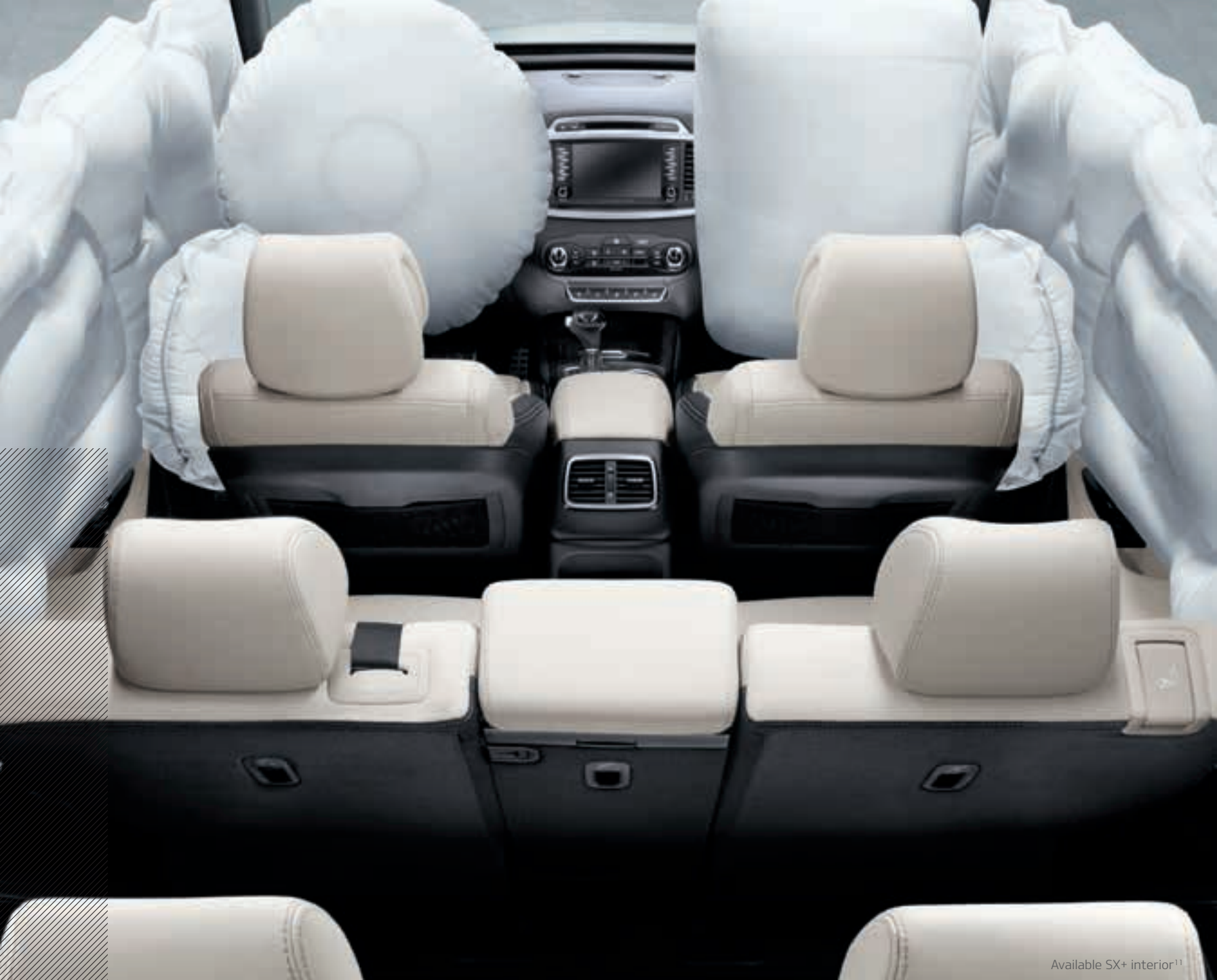
Available SX+ interior 11

Sorento offers advanced technologies that help the driver become more aware of potential hazards around the vehicle – such as available Blind Spot Detection. 1 Should an accident prove unavoidable, you can take comfort in the fact Kia has given the unthinkable a tremendous amount of thought. A series of passive safety systems are designed to help protect the passenger compartment – from a safety cage design that’s fortified with ultra-high-tension steel to a six-airbag SRS system. Clearly, the more thought Kia puts into Sorento’s safety, the greater your peace of mind.