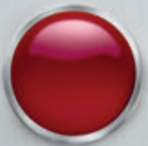
CURRANT RED (LX, S, EX)

YOU ARE OPEN TO EXPLORING ENDLESS POSSIBILITIES. YOUR GLASS IS ALWAYS HALF-FULL.