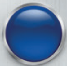
DEEP SEA BLUE (LX, S)

YOU NOTICE THE SUBTLE IRONIES IN LIFE. NOTHING IS EVER BLACK AND WHITE TO YOU.