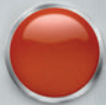
FIRE ORANGE (EX LAUNCH EDITION)

YOU SEEK ADVENTURE AND ARE THE LIFE OF THE PARTY. NO CHILI PEPPER IS OFF LIMITS TO YOU.