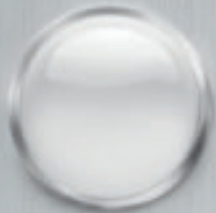
CLEAR WHITE (FE, LX, S)

YOU UNDERSTAND THE UPS AND DOWNS OF LIFE AND NEVER LET A CLOUDY DAY GET YOU DOWN.