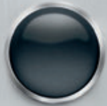
GRAVITY GRAY (FE, LX, S, EX)

YOU'RE A NIGHT PERSON WHO ENJOYS EATING LICORICE WHILE WATCHING FILM NOIR.