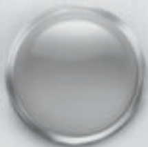
SILKY SILVER (LX, S)

YOU HAVE A PURE HEART AND GENTLE NATURE. YOU LOVE LONG NAPS. YOUR SUNSCREEN IS SPF 100+.