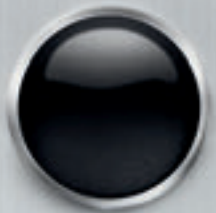
AURORA BLACK (FE, LX, S, EX)

YOU ARE DRAWN TO THE WATER AND YOUR SOUL RUNS DEEP. DOLPHINS GRAVITATE TOWARD YOU.