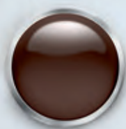
GRANITE BROWN PEARL YOU HAVE A DOWN-TO- EARTH PERSONALITY AND ARE AN EXPERT IN ALL THINGS CHOCOLATE.