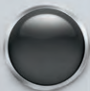
PLATINUM GRAPHITE YOU APPRECIATE AN OVERCAST DAY AS THE PERFECT OPPORTUNITY TO WEAR YOUR FAVORITE SWEATSHIRT.