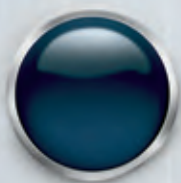
GRAVITY BLUE YOU'RE A REALIST WHO ACCEPTS THE UPS AND DOWNS OF LIFE. ALSO, YOU LOOK REALLY GOOD IN DENIM.