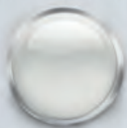
SNOW WHITE PEARL YOU HAVE A PURE HEART AND GENTLE NATURE. YOU LOVE LONG NAPS. YOUR SUNSCREEN IS SPF 100+.