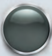
MOSS GRAY YOU ALWAYS FIND THE BEST SHADY SPOT ON A WARM DAY AND ARE A BIG FAN OF ELEPHANTS.