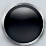
AURORA BLACK PEARL YOU'RE A NIGHT PERSON WHO ENJOYS EATING LICORICE WHILE WATCHING FILM NOIR.