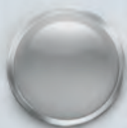
SILKY SILVER YOU NOTICE THE SUBTLE IRONIES IN LIFE. NOTHING IS EVER BLACK AND WHITE TO YOU.