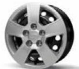
15" Steel Wheels

1.4 ISG 89bhp 5-speed manual eco dynamics