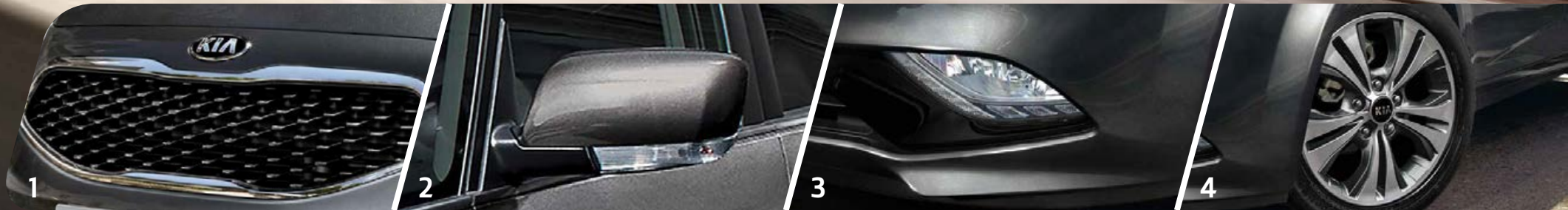
1. Signature 'tiger-nose' grille. 2. Electrically folding, adjustable and heated door mirrors with integrated indicator lights ('2' upwards). 3. Front Fog Lights ('3' upwards). 4. Stylish alloy wheels ('2' upwards)

Take a look around the Venga and you'll find plenty of eye-catching design features including the imposing 'Tiger-Nose' black high gloss grille with chrome surround, stylish alloy wheels ('2' upwards), the convenience of electrically folding, adjustable and heated door mirrors with integrated indicator lights ('2' upwards) and stylish privacy glass ('3' and '4') which further enhances the exterior appeal of these models.