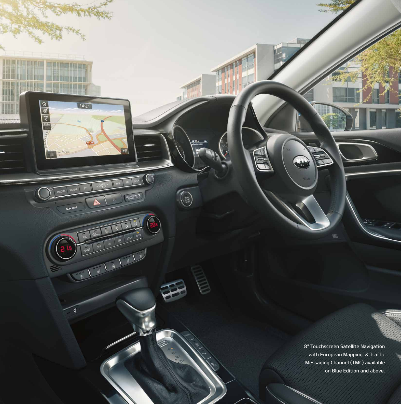
8" Touchscreen Satellite Navigation with European Mapping & Traffic Messaging Channel (TMC) available on Blue Edition and above.