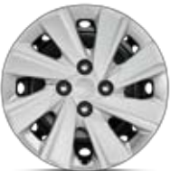
15-inch Steel Wheel