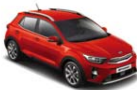
Signal red _ BEG