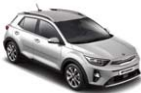
Silky silver _ 4SS