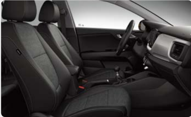
Black One-tone Interior

A pleasing combination of soft tricot and lightly patterned woven cloth seat material provides comfort and support. The doors and dash feature trim and painted metal in colors that complement the shades of the cloth trim.