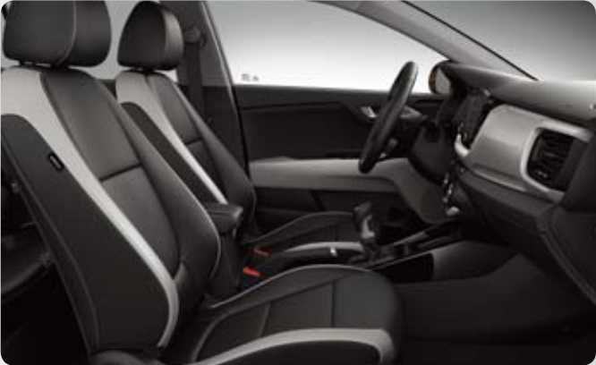
Gray Two-tone Interior

The interior is upholstered in a combination of soft tricot and woven cloth with a muted dark gray pattern. The coordinated door and dash trim provide a consistently fresh and relaxing environment.