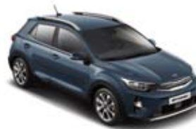
Smoke blue _ EU3