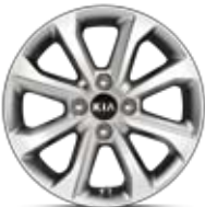
15-inch Alloy Wheel