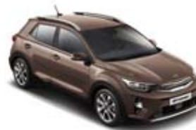
Deep sienna brown _ SEN