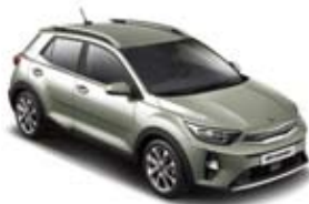
Urban green _ URG