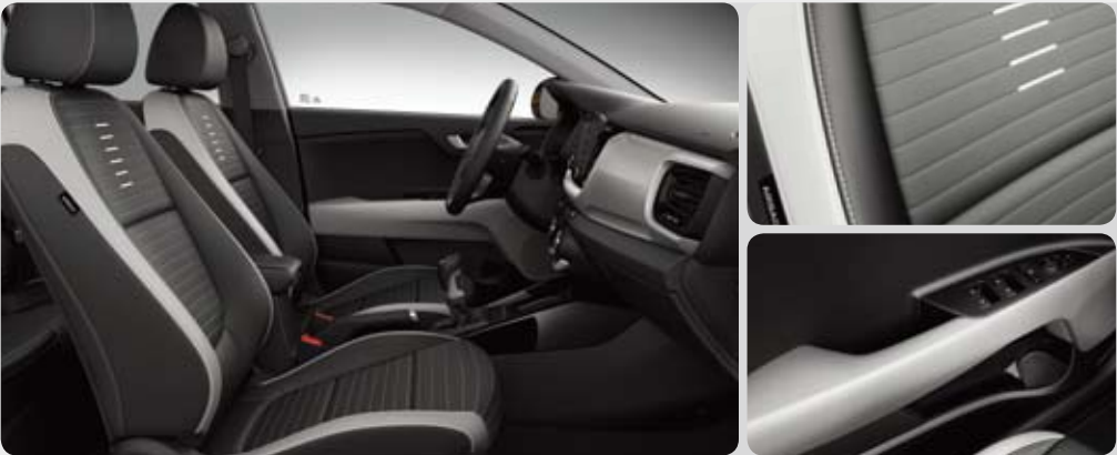
Gray Two-tone Interior (Gray PKG)

Gray Two-tone interior (Gray Package) Two-tone light and medium gray artificial leather seats have tasteful gray stitching. Soft, breathable cloth inserts include a nailhead pattern, horizontal embroidered stripes, and gray embossed accents that match the lighter gray tone of the dash and center console trim and door armrests.