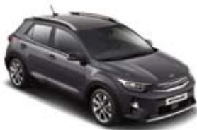
Platinum graphite _ ABT