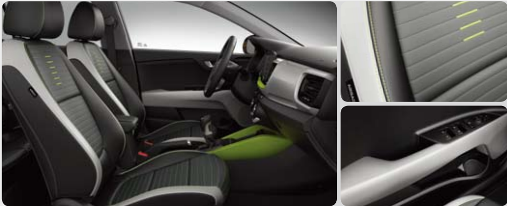
Gray Two-tone Interior (Green PKG)

Gray Two-tone interior (Green Package) Two-tone light and medium gray artificial leather seats feature bright green stitching. Breathable gray cloth inserts include a nailhead pattern, horizontal embroidered stripes, and green embossed accents that match the tone of the bright green trim on the dash and center console. Door armrests are a lighter gray.