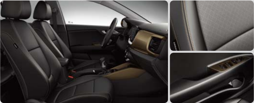
Black One-tone Interior (Bronze PKG)

Black One-tone interior (Bronze Package) Saturn Black artificial leather seats are stitched with bronze-colored thread, matching the tone of the bronze-colored door, dash and center console trim.