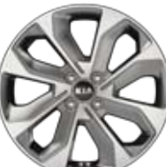
17-inch Alloy Wheel