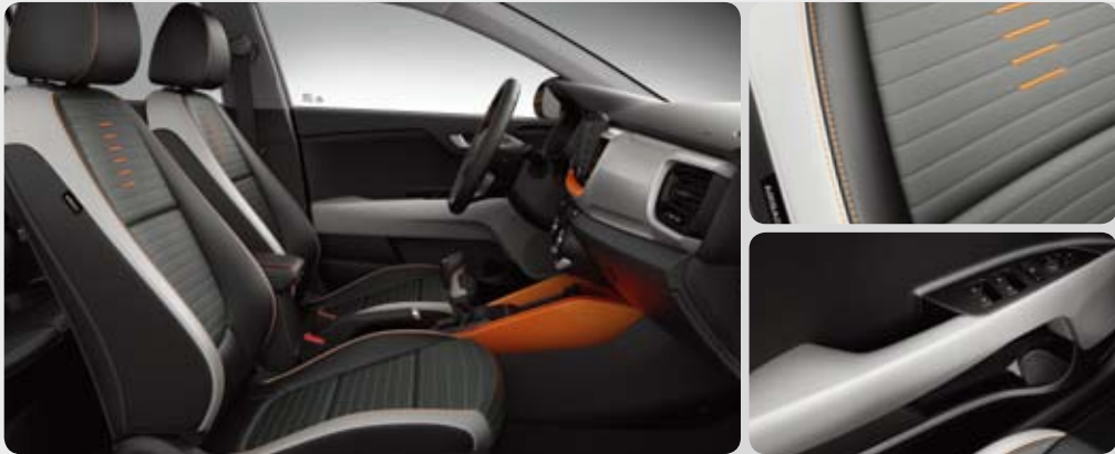
Gray Two-tone Interior (Orange PKG)

Gray Two-tone interior (Orange Package) Two-tone light and medium gray artificial leather seats have bright orange stitching. Breathable gray cloth inserts include a nailhead pattern, horizontal embroidered stripes, and orange embossed accents that match the tone of the bright orange trim on the dash and center console. Door armrests are a lighter gray.