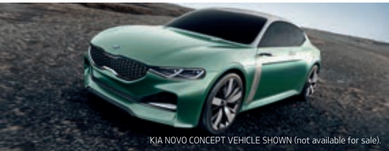
KIA NOVO CONCEPT VEHICLE SHOWN (not available for sale).

5-year/60,000-mile 24-hour roadside assistance