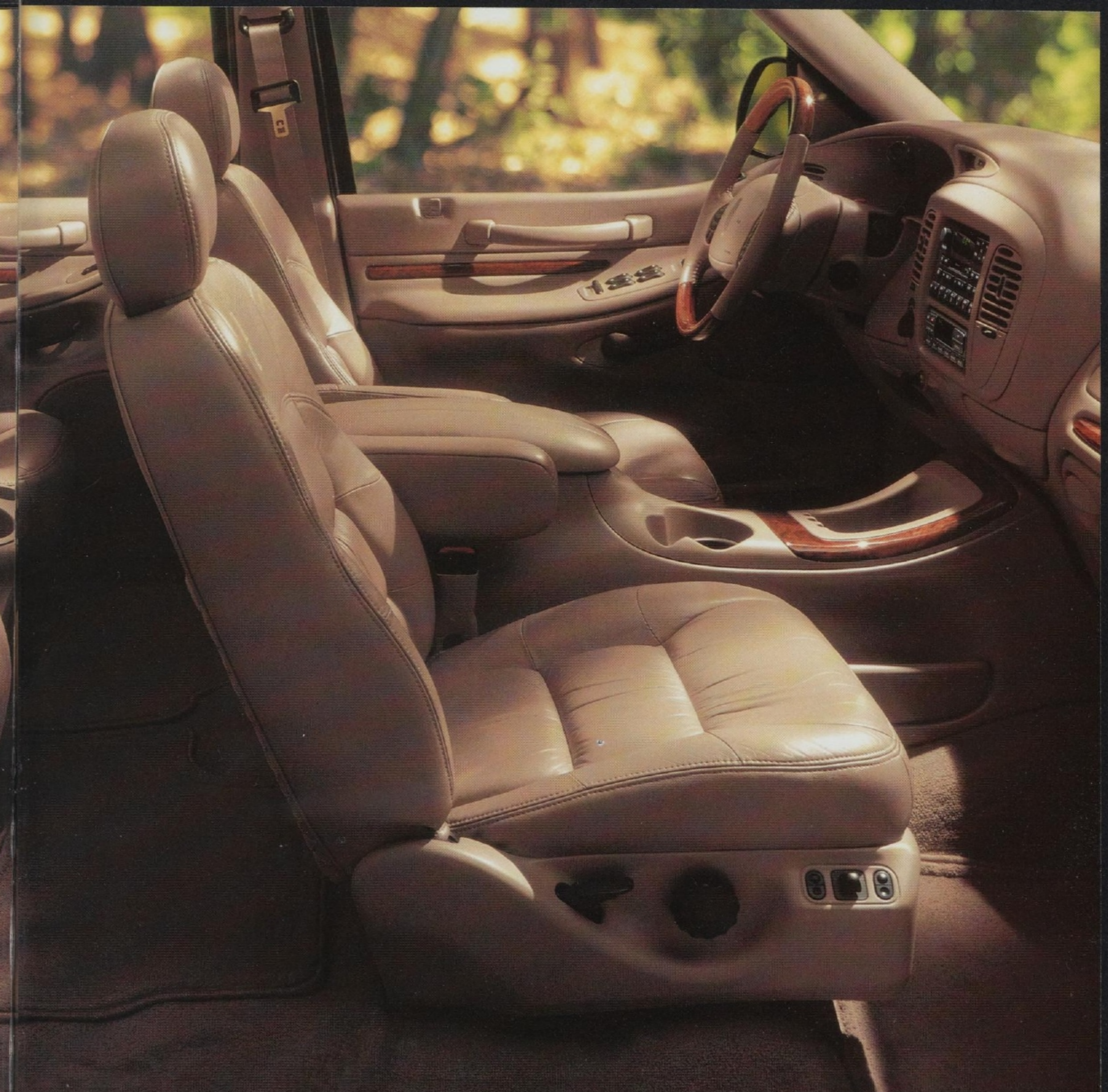
Navigator's standard interior includes quad-bucket seating and a third-row bench seat. First-row and second-row consoles with storage and cup holders are also provided. A second-row 60/40 split-fold bench seat is available as a no-cost option. Naturally, they come with leather seating surfaces.