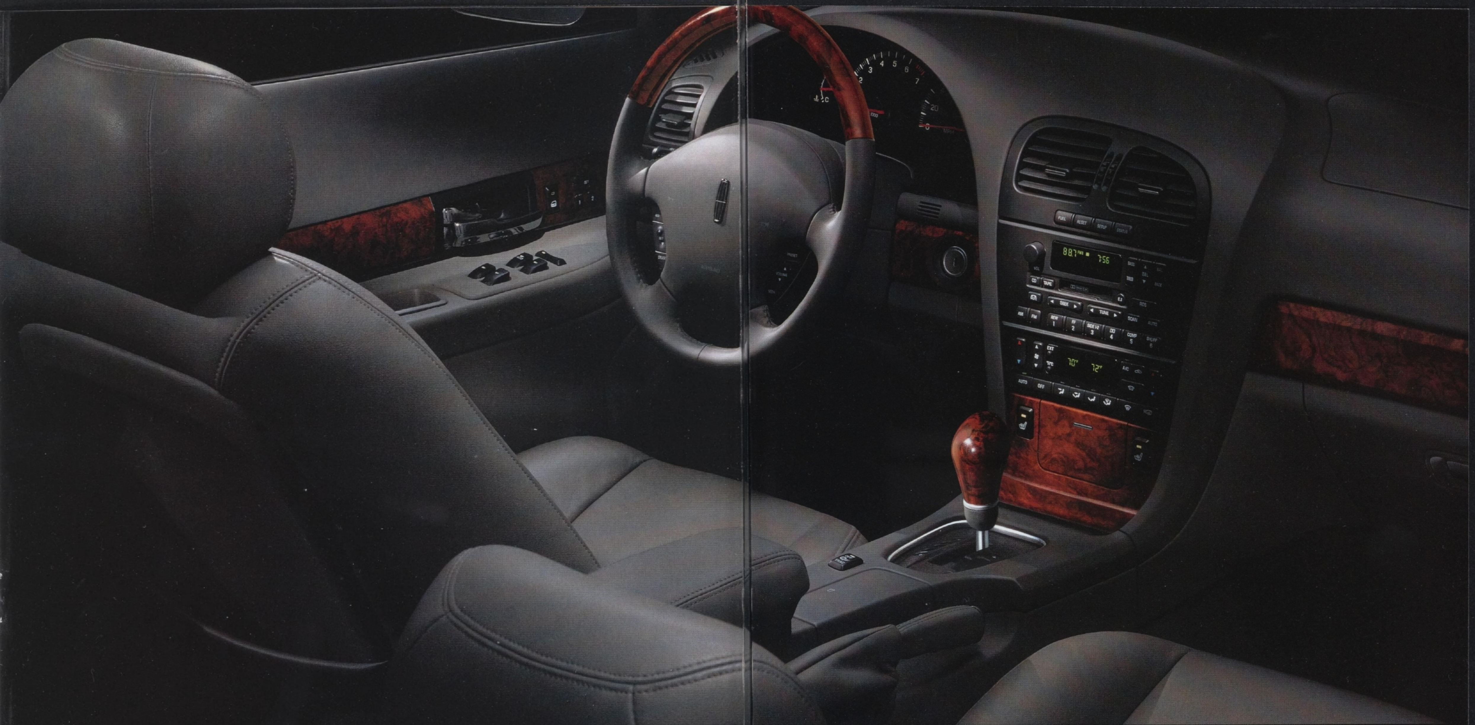
Sit back in the sculpted leather-trimmed seat and prepare yourself for a unique driving experience. V-6 models are equipped with either a 5-speed manual or automatic transmission. The optional SelectShift™ 5-speed automatic is available on V-6 and V-8 models and allows for manual shifting. (Late availability.)