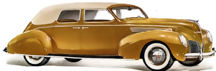
THE CONVERTIBLE SEDAN