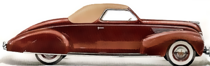
THE CONVERTIBLE COUPE