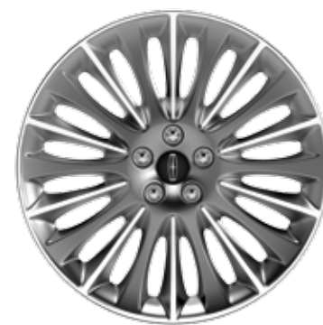
19" Polished Aluminum with Dark Tarnish-Painted Pockets Available on Reserve 1