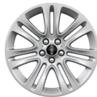
18" Premium Painted Aluminum Standard