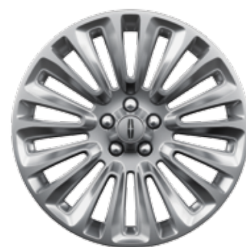
19" 18-Spoke Polished Aluminum Optional 2