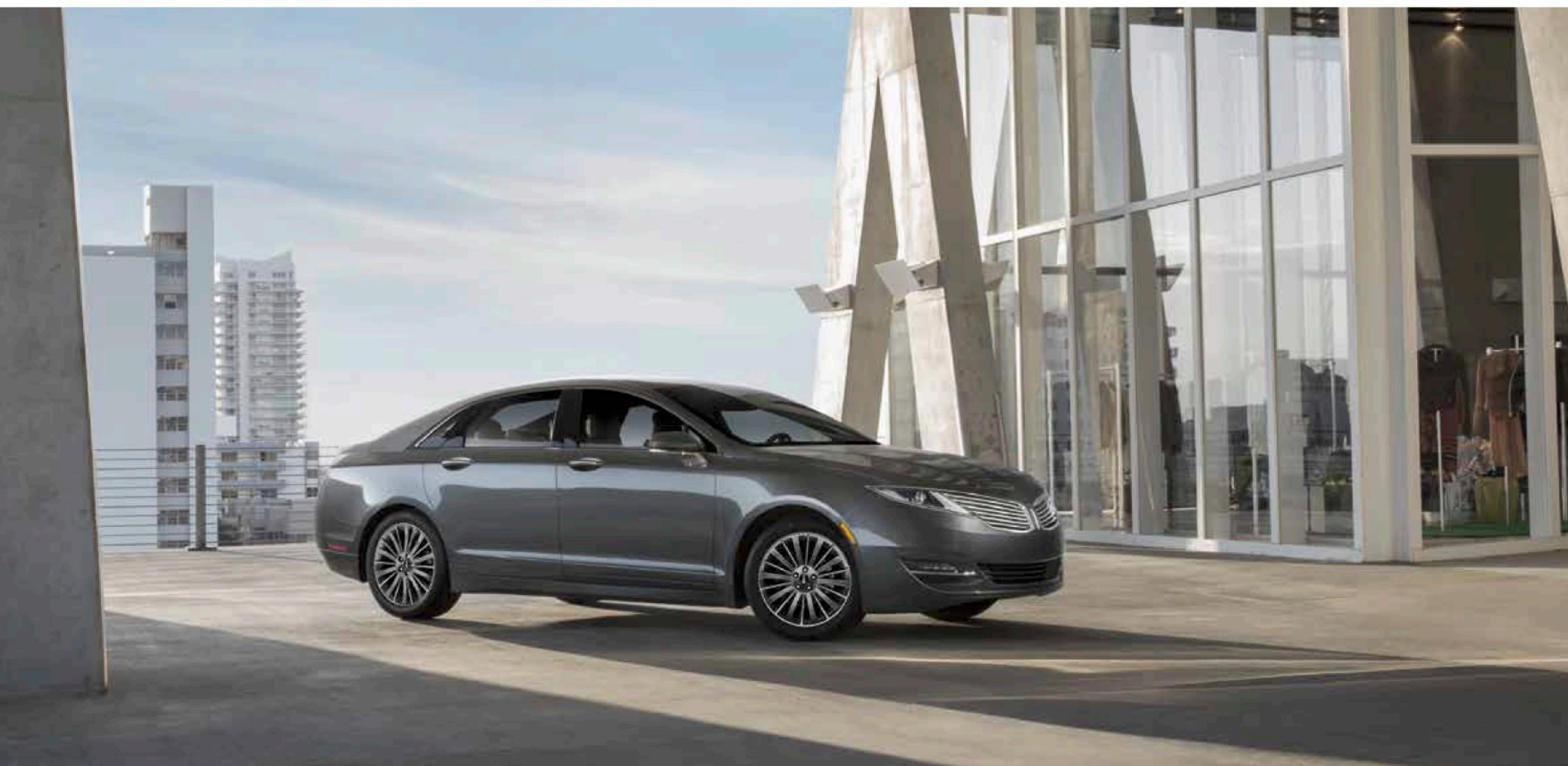
2016 LINCOLN MKZ + HYBRID