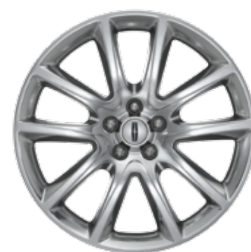
19" 10-Spoke Polished Aluminum Optional 1