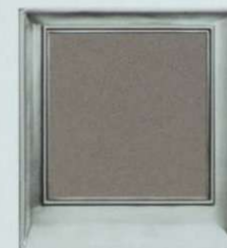
LIGHT FRENCH SILK