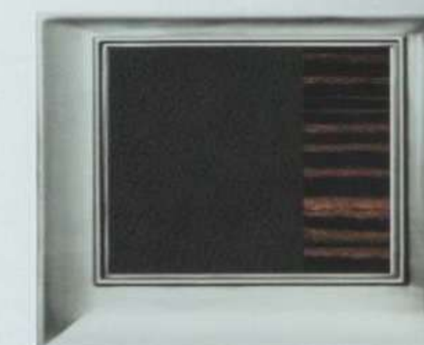
CHARCOAL BLACK LEATHER WITH EBONY WOOD Available Premium Appearance Package features premium leather trim with Caramel piping