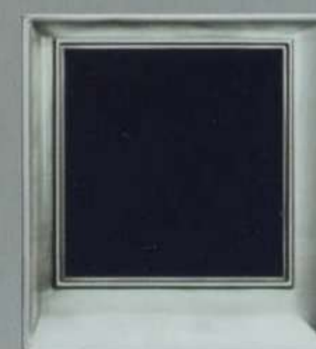
DARK BLUE PEARL*

For there are always new dreams to pursue. Walls to scale. Goals to achieve. Finish lines to cross. And when there isn't a way, you'll simply make your own. Life's calling. Where to next?