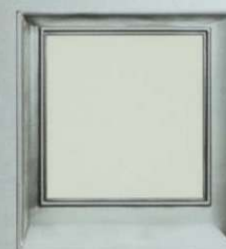
WHITE CHOCOLATE TRI-COAT*