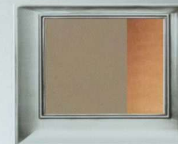
CAMEL LEATHER WITH LIGHT FIGURED MAPLE WOOD Available Premium Appearance Package features premium leather trim with Sand piping