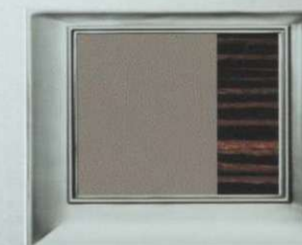
STONE LEATHER WITH EBONY WOOD Available Premium Appearance Package features premium leather trim with Black piping

*New for 2007. **Dark Blue Pearl exterior with Charcoal Black interior and Dark Amethyst exterior with Camel interior not available with Premium Appearance Package. Lincoln Mercury reserves the right to change product specifications at any time without incurring obligations. Please see your Lincoln Mercury Dealer for actual paint/trim options. Lincoln uses clearcoat paint for beauty and protection. All exterior paints are Metallic except for Black. Colors are representative only.