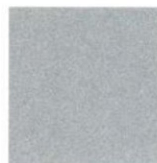
LIGHT ICE BLUE