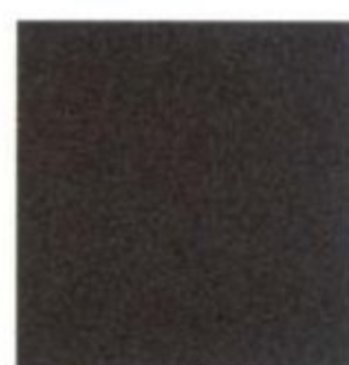
DARK SHADOW GREY