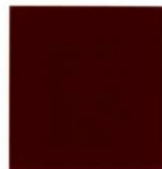
DARK TOREADOR RED