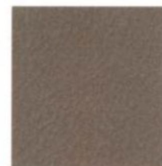
MEDIUM LIGHT STONE