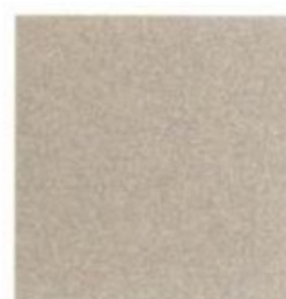
LIGHT FRENCH SILK