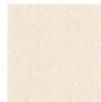
CERAMIC WHITE PEARLESCENT TRI-COAT