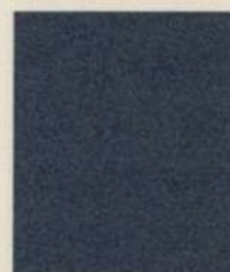
Norsea Blue Metallic