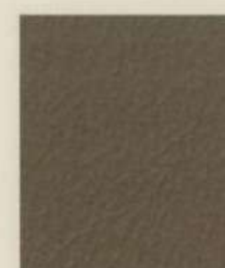
Medium Light Stone