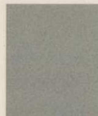
Silver Birch Metallic