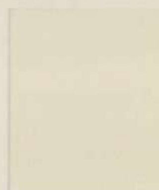
Ceramic White Pearlescent Tri-Coat