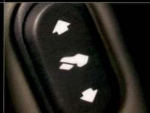
ADVANCED TOWN CAR CONTROLS