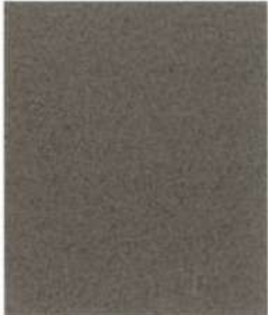
MINERAL GREY METALLIC