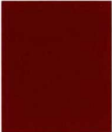
VIVID RED METALLIC