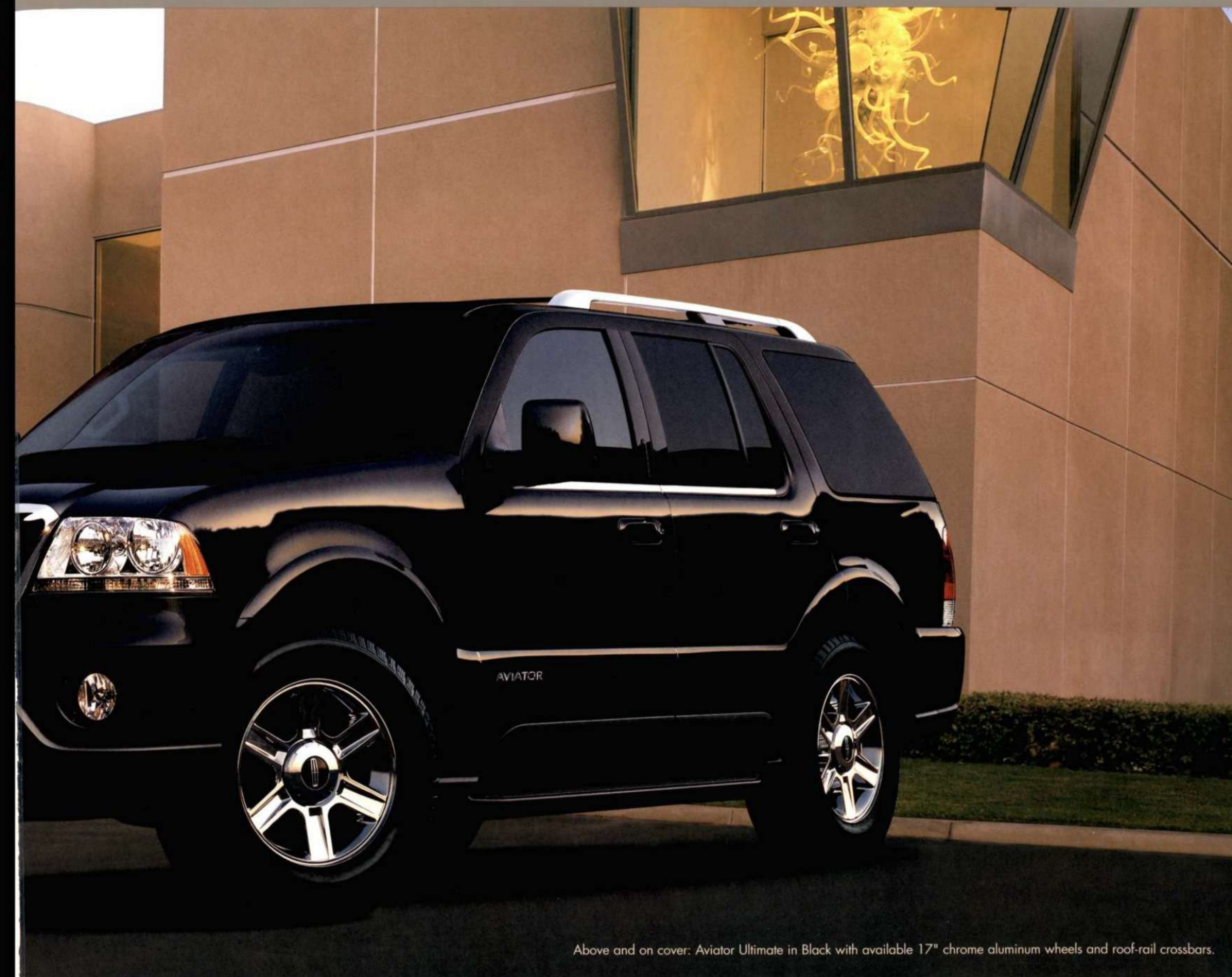
Above and on cover: Aviator Ultimate in Black with available 17" chrome aluminum wheels and roof-rail crossbars.