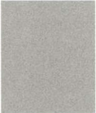
SILVER BIRCH METALLIC