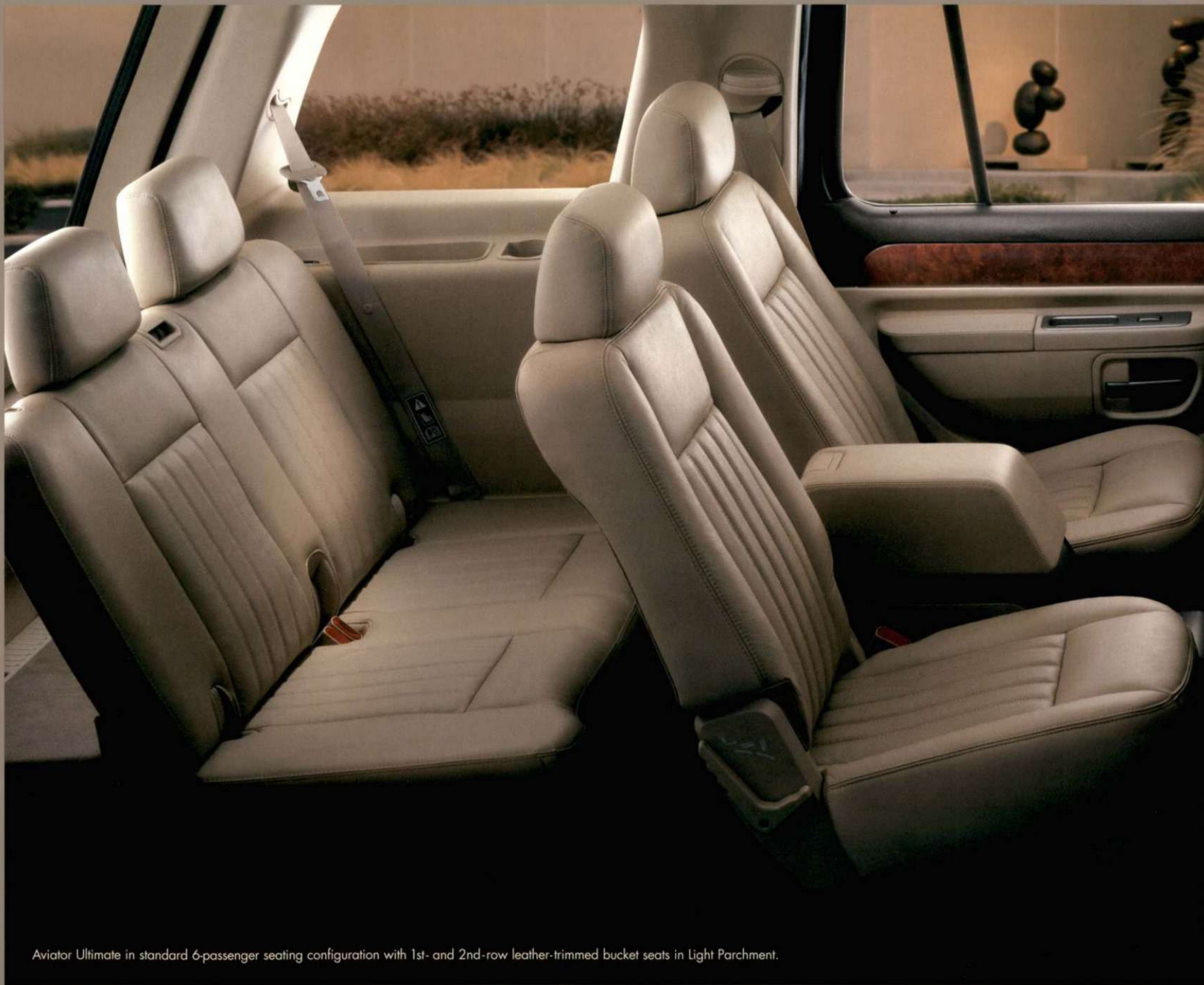
Aviator Ultimate in standard 6-passenger seating configuration with 1st- and 2nd-row leather-trimmed bucket seats in Light Parchment.