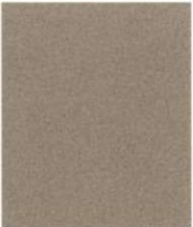
LIGHT FRENCH SILK METALLIC