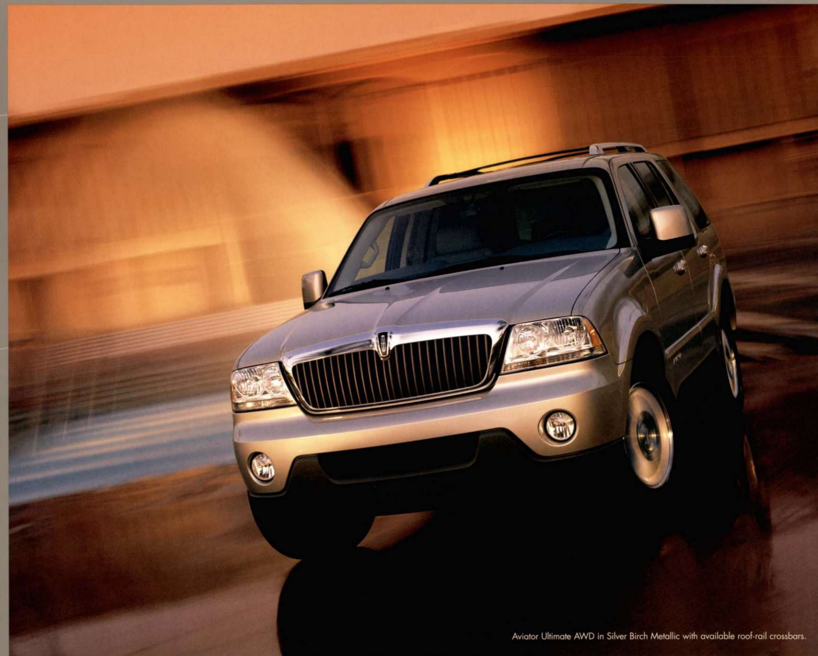
Aviator Ultimate AWD in Silver Birch Metallic with available roof-rail crossbars.