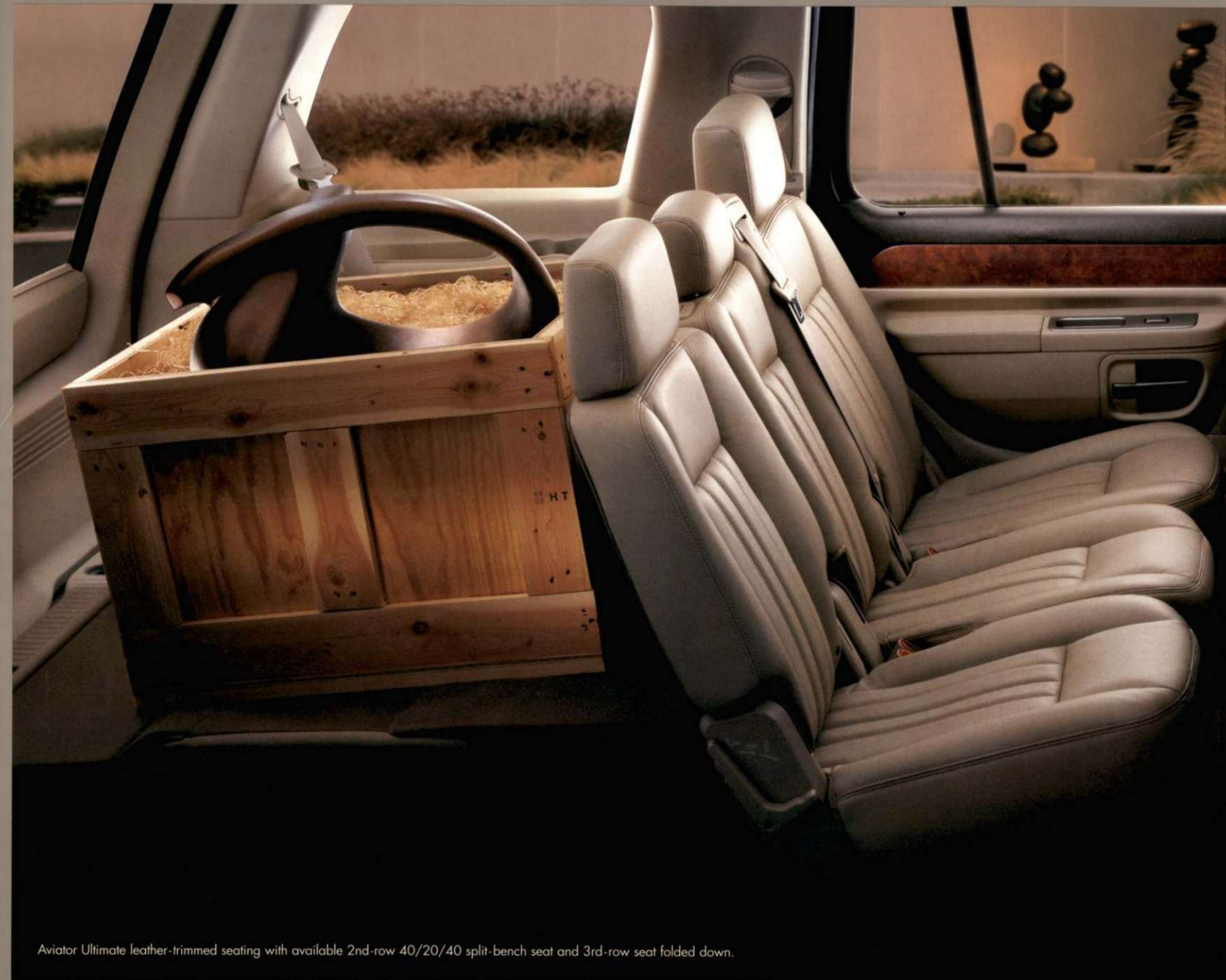
Aviator Ultimate leather-trimmed seating with available 2nd-row 40/20/40 split-bench seat and 3rd-row seat folded down.

ALL IN ONE The HomeLink Universal Transceiver can be programmed to control the functions of up to 3 remote control devices. You can open and shut garage doors and security gates, activate and deactivate alarm systems, or control security lights at the touch of a button.