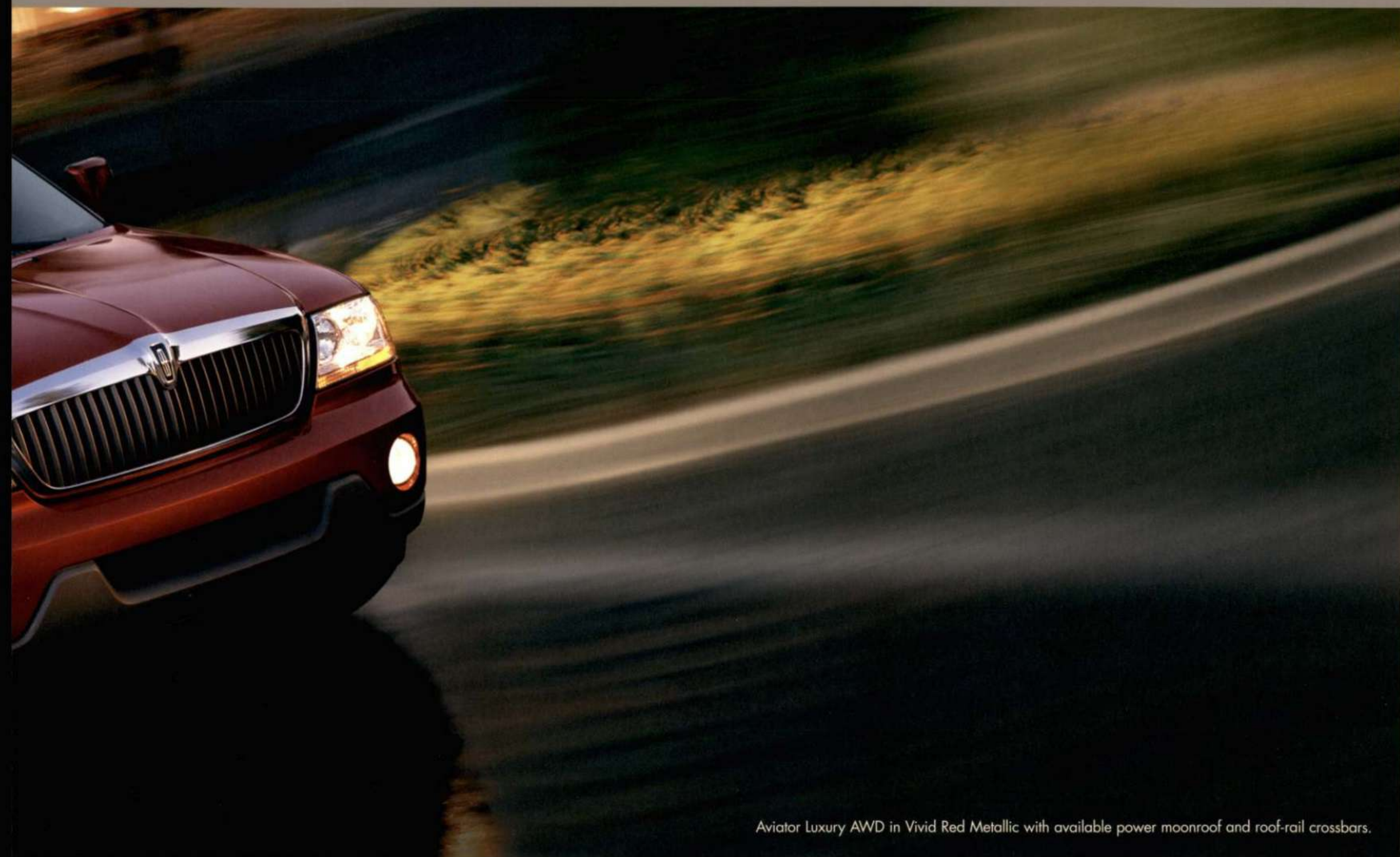
Aviator Luxury AWD in Vivid Red Metallic with available power moonroof and roof-rail crossbars.