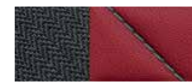
Red Premium Leather/ Dark Grey Zegna Silk with Light Grey Contrast Stitching