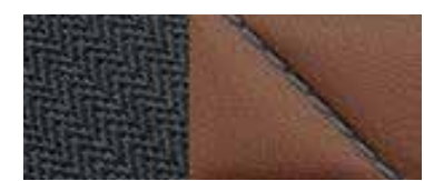
Tan Premium Leather/ Dark Grey Zegna Silk with Light Grey Contrast Stitching

The Quattroporte GranLusso is crafted for individuals who desire higher levels of luxury. Which is why this model features a remarkably exclusive interior, styled and crafted by Ermenegildo Zegna, one of Italy's most celebrated fashion designer brands. The finest leathers are combined with Zegna's mulberry silk inserts on the seats, door panels, headlining and light fixture. The silk is embellished with a hand-stitched micro-chevron pattern, while the seating features a central silk insert with a macro-chevron weave. All this is available in three combinations of leather and silk with contrast stitching. Other GranLusso cabin refinements include a wood and leather steering wheel, wood trim, power foot pedals, a power rear sunblind, four-zone climate control and heated rear seats.