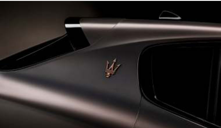
Trident logo on C-pillar

Bold Maserati design embraces electric innovation, inspiring a contemporary new range of colors and materials that breathe Folgore. From the coppery Rame Folgore shade to the interiors created with the regenerated nylon fiber ECONYL®, the Grecale Folgore breathes pure electric beauty. It exudes cutting-edge innovation, 100% Made in Italy.