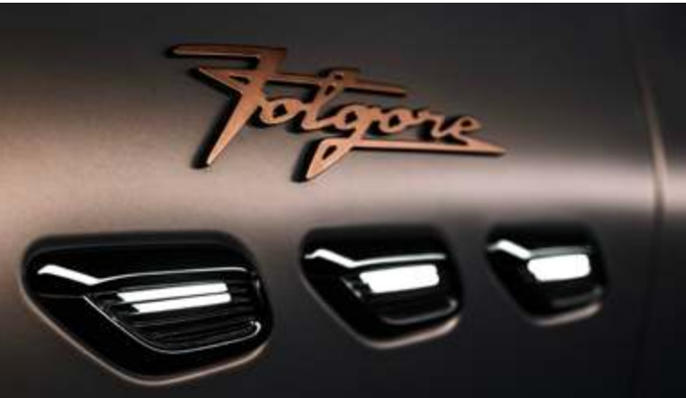
Side air vents and Folgore Badge