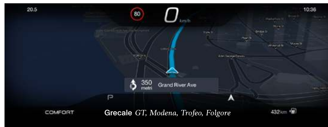
Grecale GT, Modena, Trofeo, Folgore