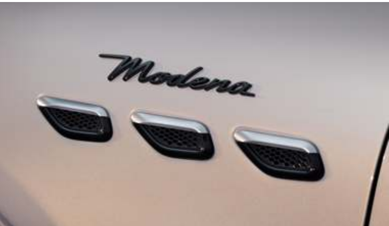
Side air vents and Modena Badge