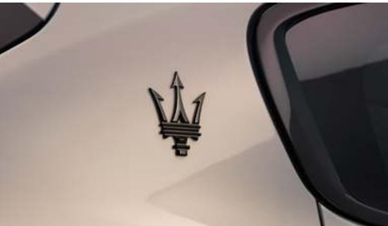
Trident logo on C-pillar