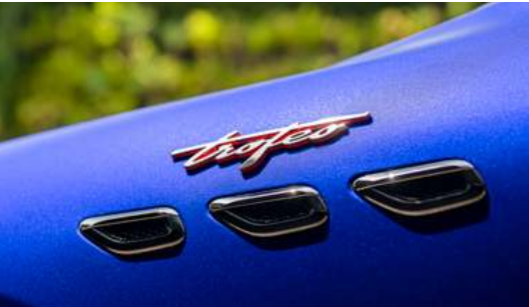
Side air vents and Trofeo Badge