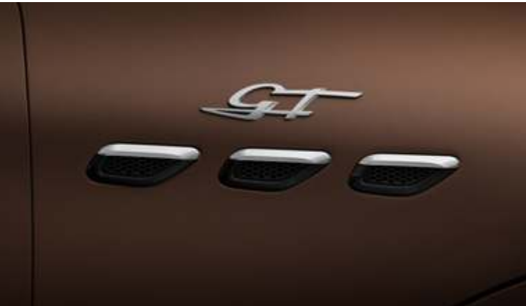
Side air vents and GT Badge