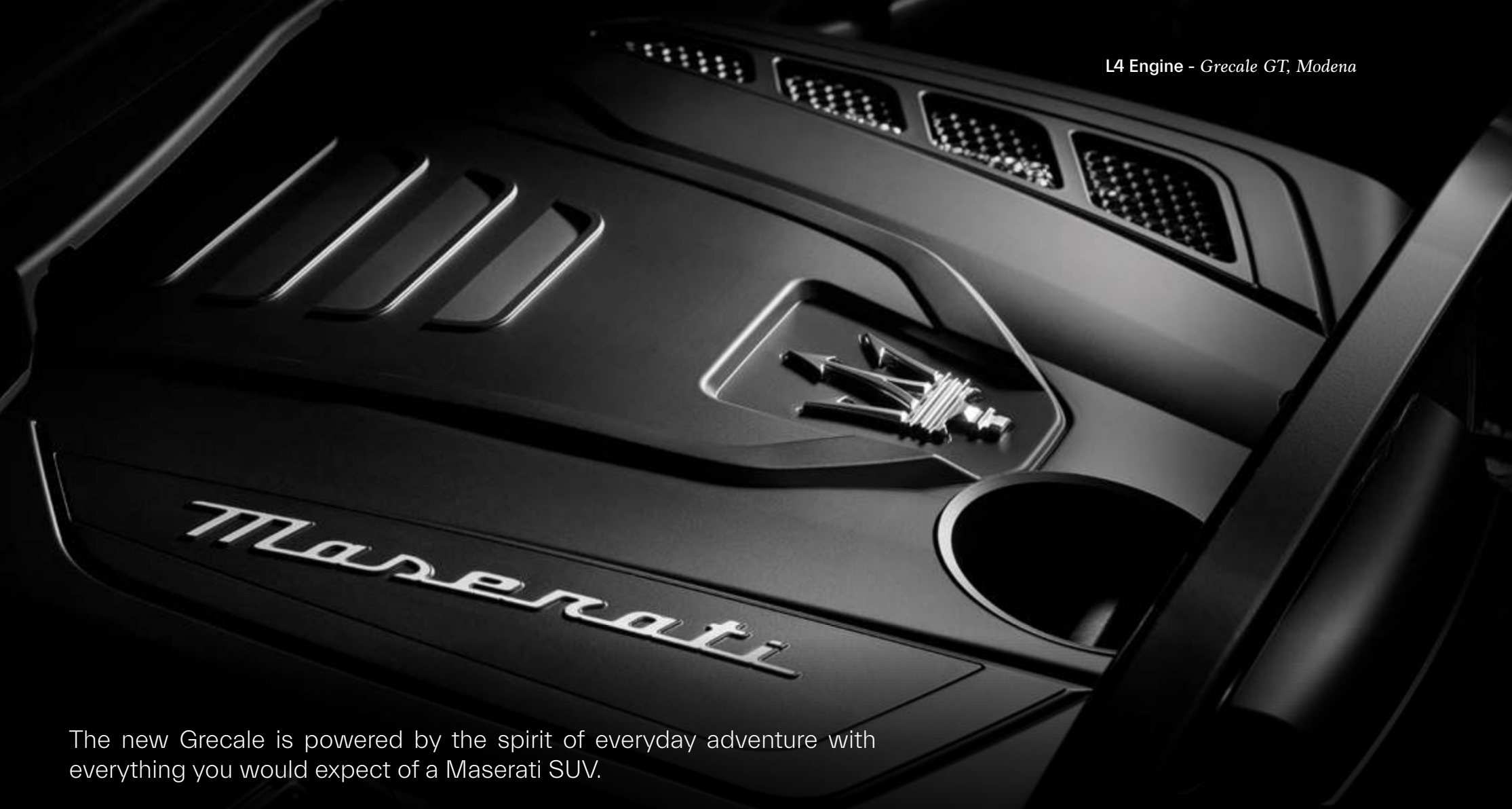
L4 Engine - Grecale GT, Modena

The new Grecale is powered by the spirit of everyday adventure with everything you would expect of a Maserati SUV.