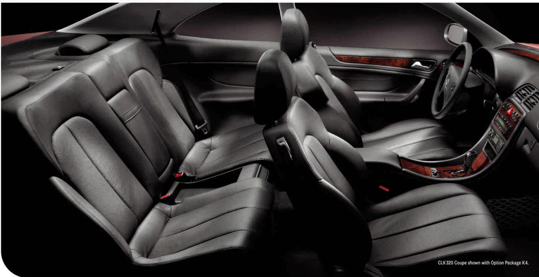
CLK320 Coupe shown with Option Package K4.

Outward beauty is undeniably captivating. But over time, it's what's inside that truly captures you. Soft, hand-fitted leather warms to your caress on the seat surfaces, magazine pockets, head restraints and door trim inserts. Hand-polished genuine wood accents help you feel instantly at home, no matter where you happen to be. Dual-zone automatic climate control lets the driver and front-seat passenger agree to disagree when it comes to airflow and temperature, while integrated filters help to eliminate dust and odors. And the telescopically adjustable multifunction steering wheel helps you control the audio system, optional telephone and more, fulfilling your wishes with barely a touch.