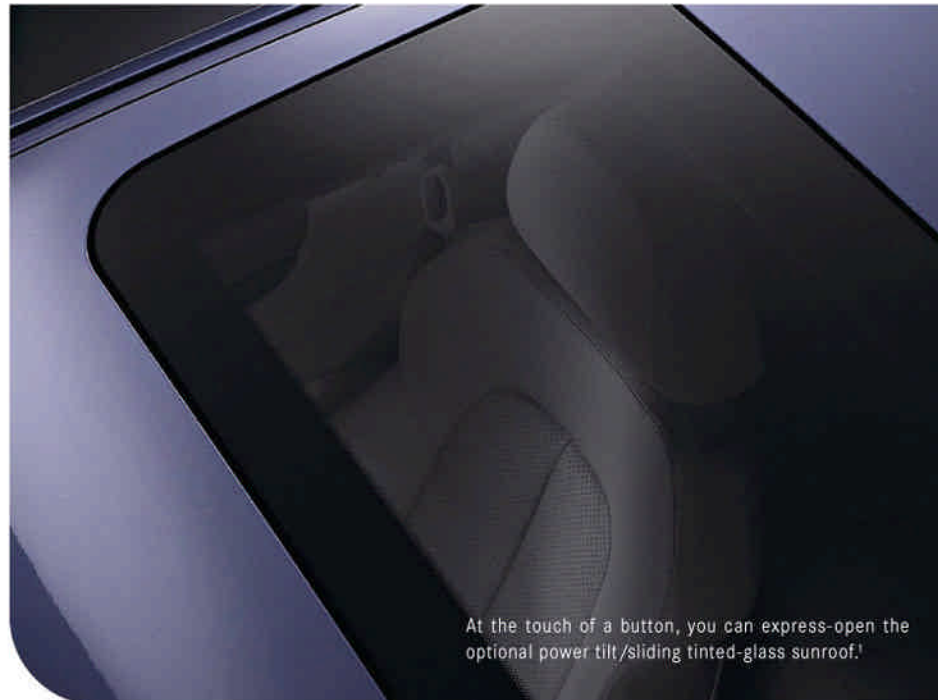
At the touch of a button, you can express-open the optional power tilt/sliding tinted-glass sunroof. 1