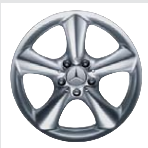
7.5x17 front, 8.5x17 rear