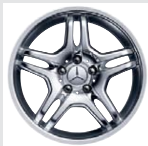
7.5x18 front, 8.5x18 rear