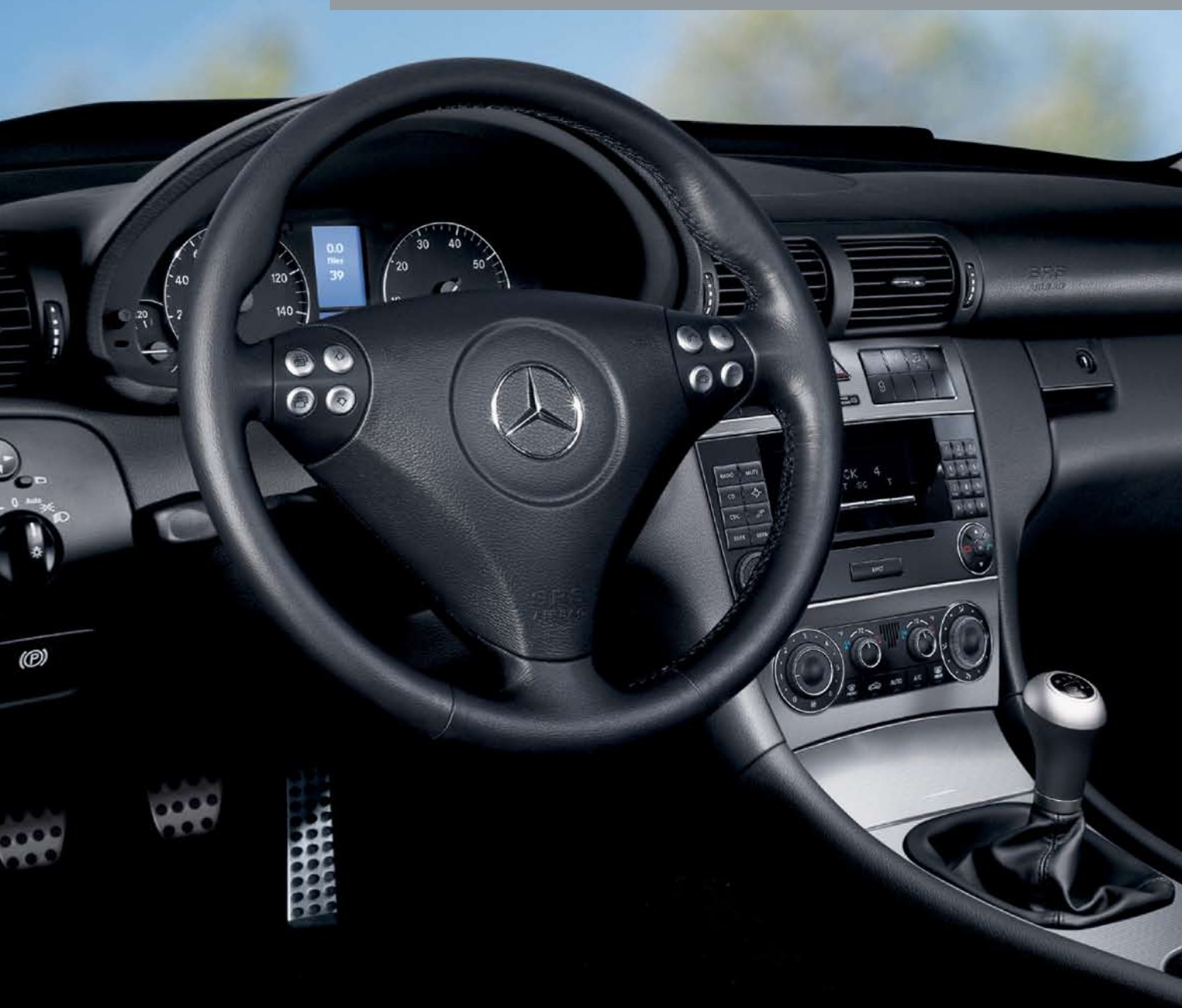
C 230 Sport Sedan shown in Black.

4-way adjustable steering column 3-spoke multifunction sport steering wheel Optional harman/kardon® LOGIC7® digital surround sound with 6-CD changer Optional 60/40-split folding rear seats