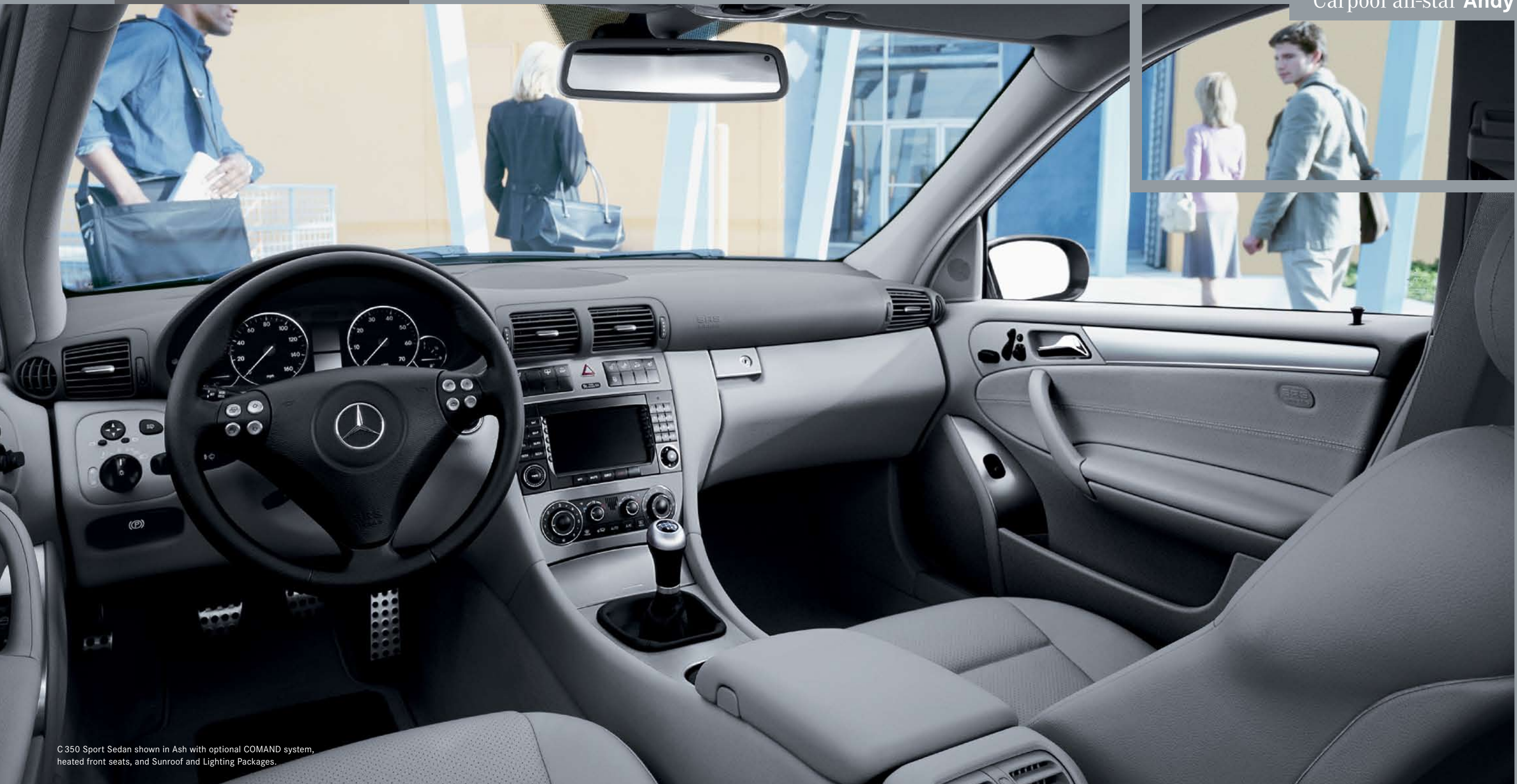
C 350 Sport Sedan shown in Ash with optional COMAND system, heated front seats, and Sunroof and Lighting Packages.