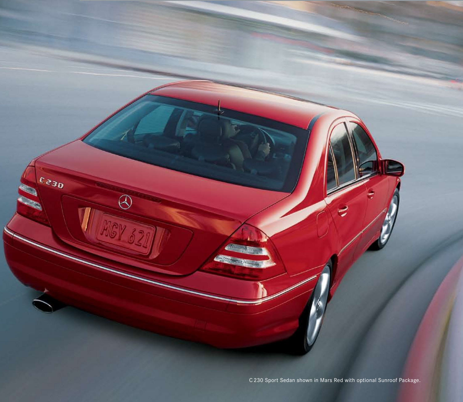
C 230 Sport Sedan shown in Mars Red with optional Sunroof Package.

Transmissions: Standard short-throw 6-speed manual Optional driver-adaptive 7-speed automatic with Touch Shift