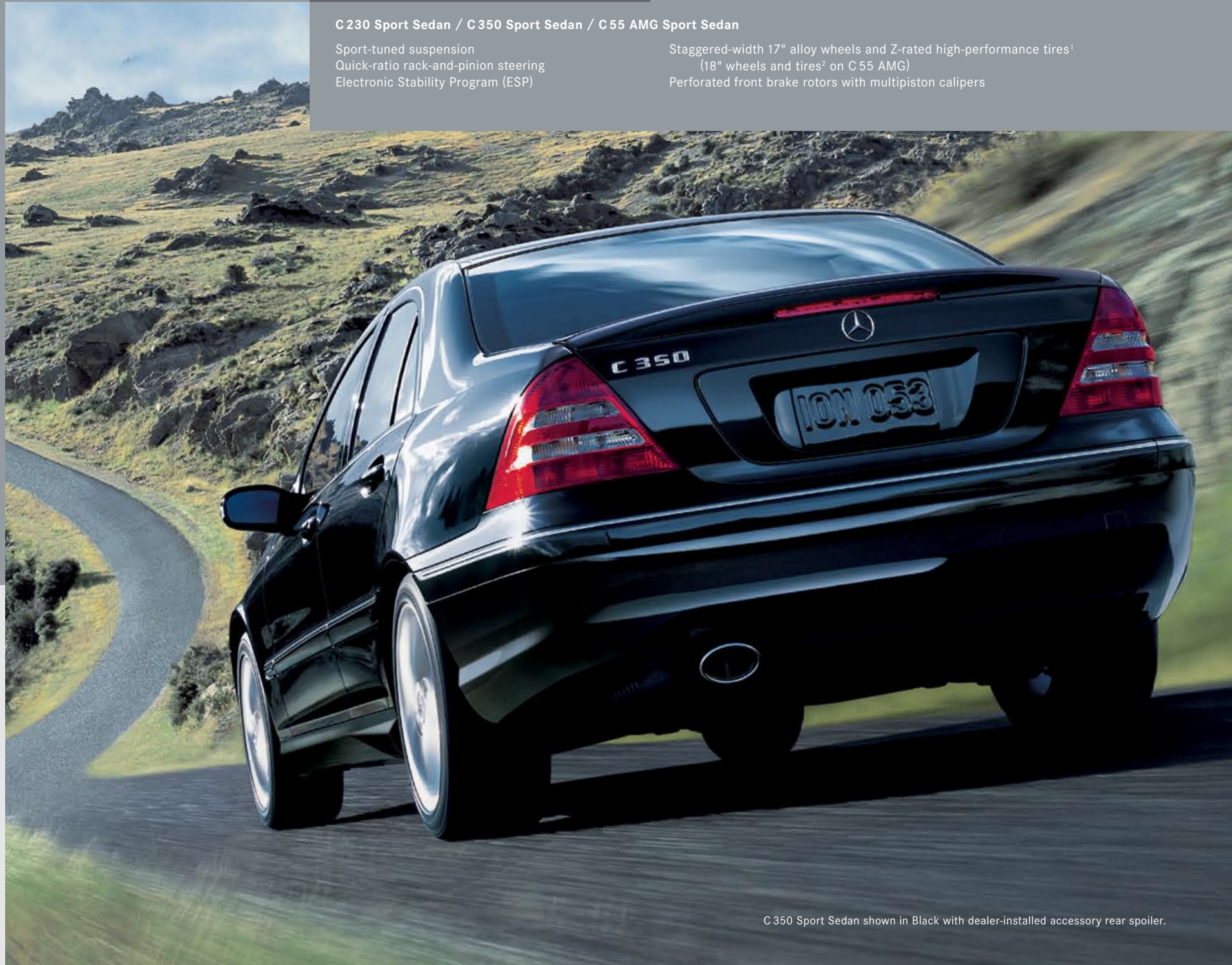
C 350 Sport Sedan shown in Black with dealer-installed accessory rear spoiler.

Staggered-width 17" alloy wheels and Z-rated high-performance tires 1 (18" wheels and tires 2 on C 55 AMG) Perforated front brake rotors with multipiston calipers