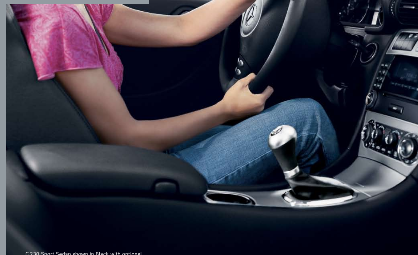
C 230 Sport Sedan shown in Black with optional automatic transmission and Sunroof Package.