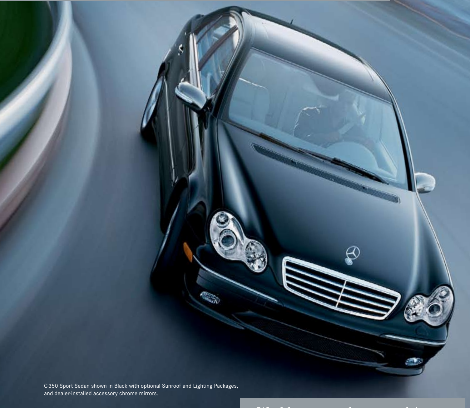
C 350 Sport Sedan shown in Black with optional Sunroof and Lighting Packages, and dealer-installed accessory chrome mirrors.

7-speed Touch Shift automatic ∨ ∨ 6-speed manual