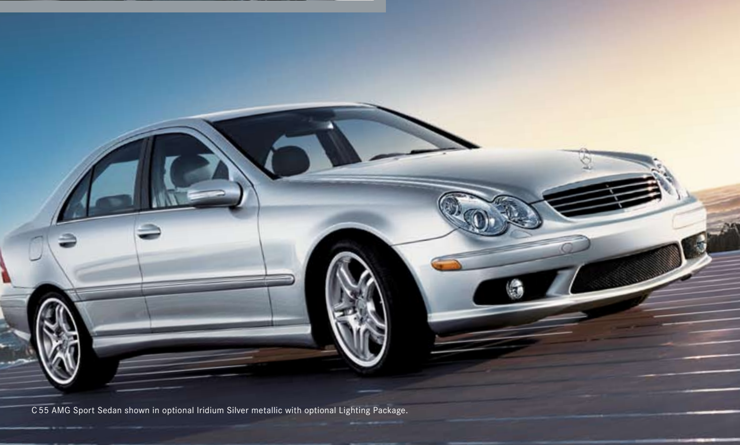
C 55 AMG Sport Sedan shown in optional Iridium Silver metallic with optional Lighting Package.

Staggered-width 18" wheels CLK-inspired front-end styling AMG-design lower bodywork AMG-design rear lip spoiler