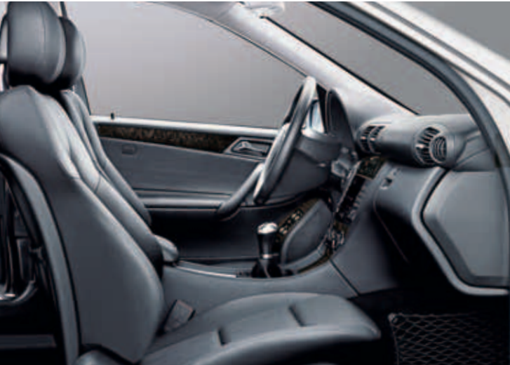
C 230 Sport Sedan shown in Black with optional manual transmission and Sunroof Package.