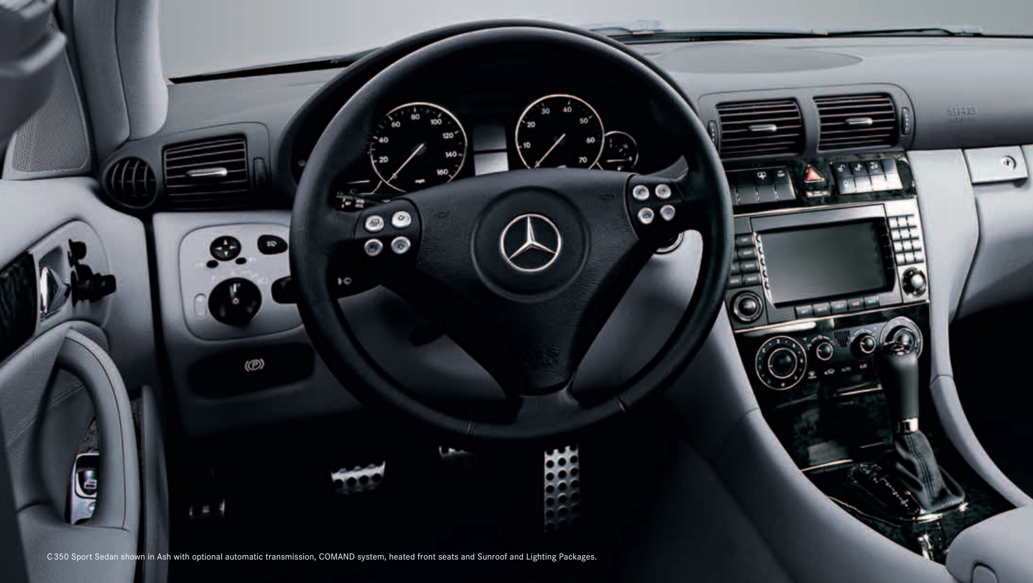
C 350 Sport Sedan shown in Ash with optional automatic transmission, COMAND system, heated front seats and Sunroof and Lighting Packages.

The performance-inspired interiors of the C 230 and C 350 Sport Sedans can satisfy just about any desire you have at a given moment. The C 230 offers 10-way adjustable sport front seats with power-adjustable height and recline. The C 350 features 10-way power-adjustable sport front seats with 3-position memory as well as a 4-way power-adjustable steering column. Both Sport Sedans are fitted with stylish MB-Tex upholstery. Black Birdseye Maple wood trims the console and doors, while hooded chrome rings encircle the gauges in the instrument panel. The powerful sound system features six speakers and a standard CD player, while the leather-wrapped multifunction sport steering wheel lets you change CD tracks, adjust the audio volume or, with the accessory iPod® Integration Kit, 1 even control an Apple iPod. Dual-zone climate control ensures that both driver and passengers will be equally pleased with the temperature. An electrostatic dust filter helps preserve the clean air in the cabin. And the optional 320-watt, 12-speaker, harman/kardon® LOGIC7® 7.1-channel digital surround-sound system 2 helps keep things moving at the exact pace of your choosing.