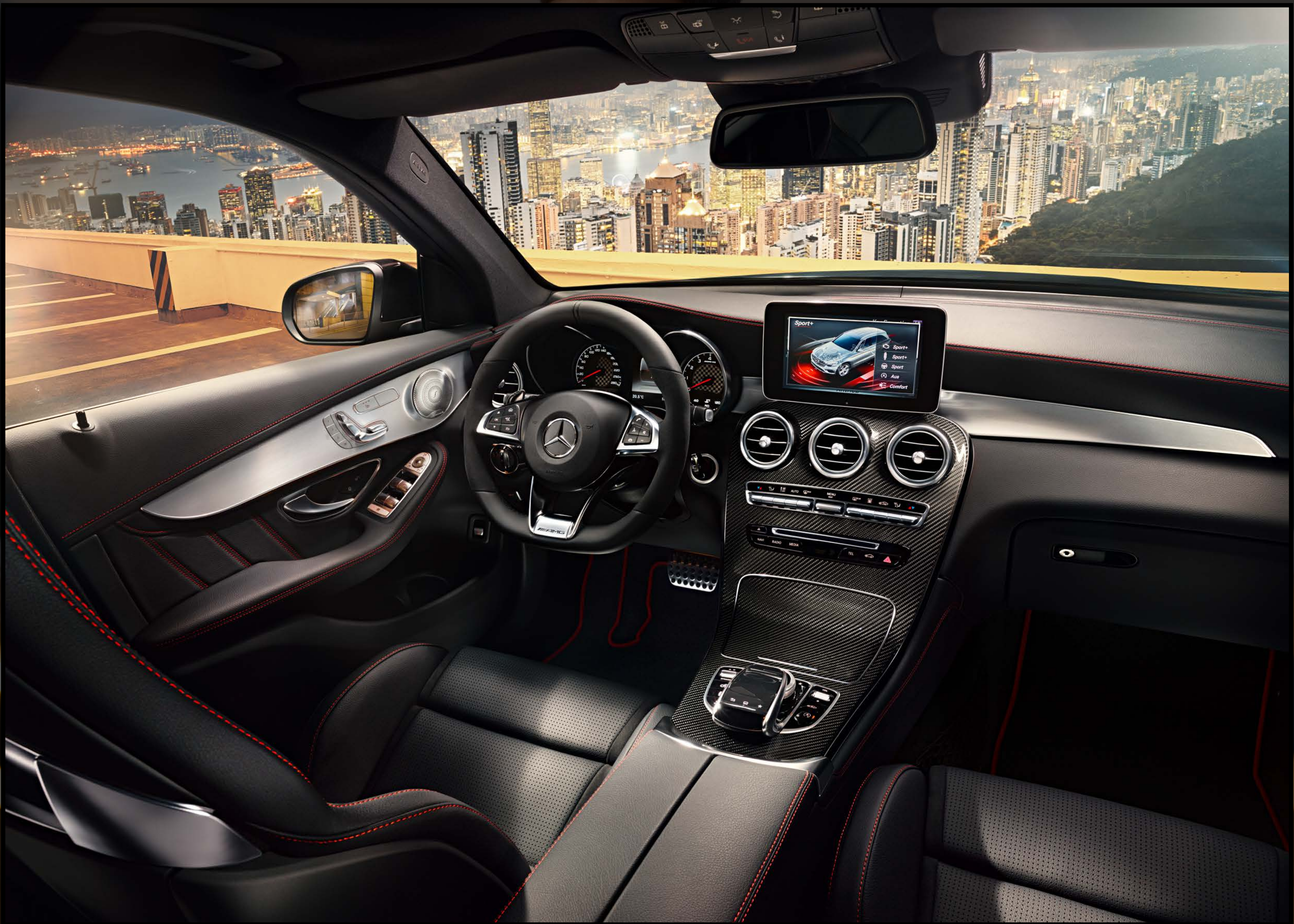
Mercedes-AMG GLC 43 4MATIC fuel consumption urban/extra-urban/combined: 11.2-10.8/7.3-6.9/8.7-8.3 l/100 km; combined CO 2 emissions: 199-189 g/km.