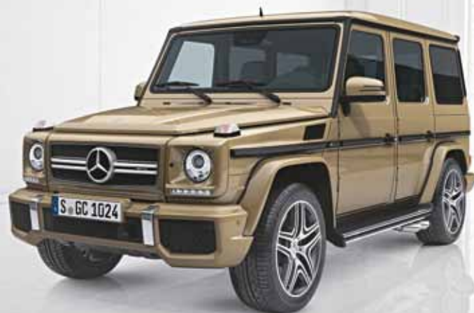
Non-metallic paint: desert sand