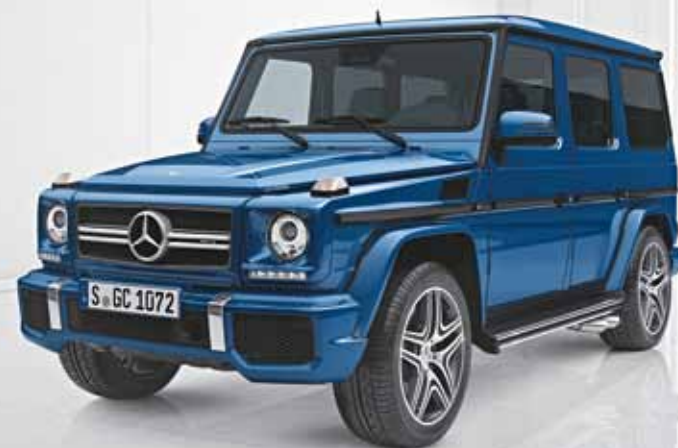
Metallic paint: designo mauritius blue metallic