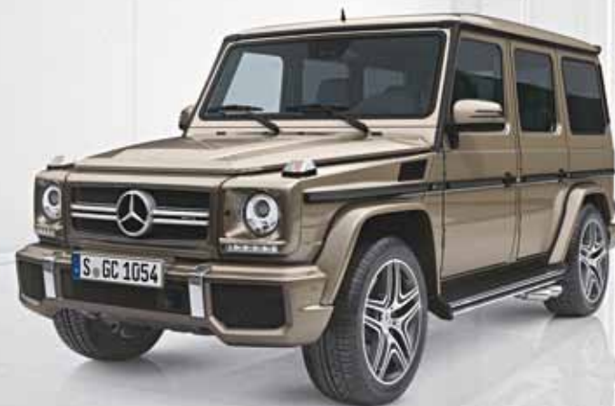
Metallic paint: sanidine beige