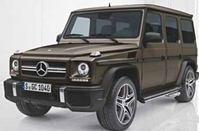
Magno paint: designo yellow olive magno with detachable body parts in designo night black magno