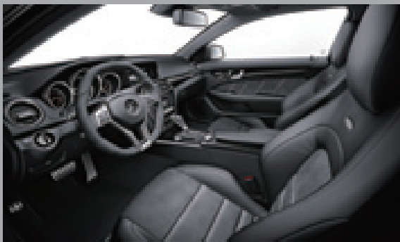
AMG sports seats