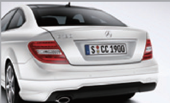
AMG Sports package