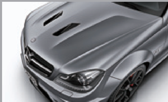
Unique AMG bonnet