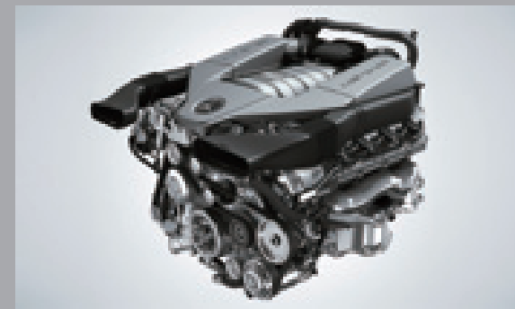
Upgraded 6.3-litre V8 naturally aspirated engine