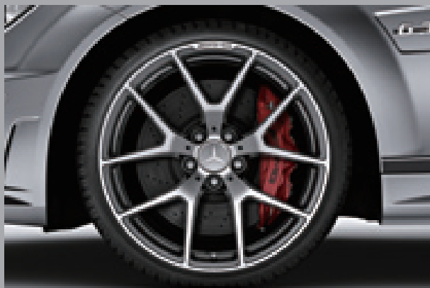
19-inch AMG cross-spoke forged wheels painted in titanium grey and featuring high-sheen finish