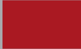
590 Fire opal