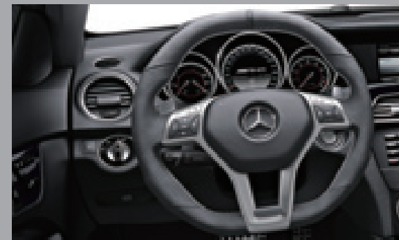
AMG instrument cluster & AMG Performance steering wheel