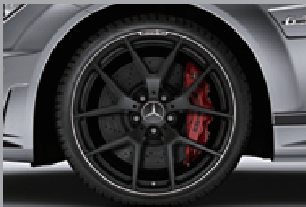
19-inch AMG cross-spoke forged wheels painted in matt black with high-sheen rim flange 1