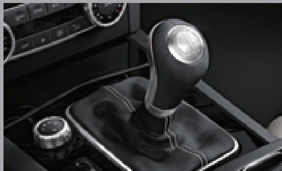
Selector lever embossed AMG emblem