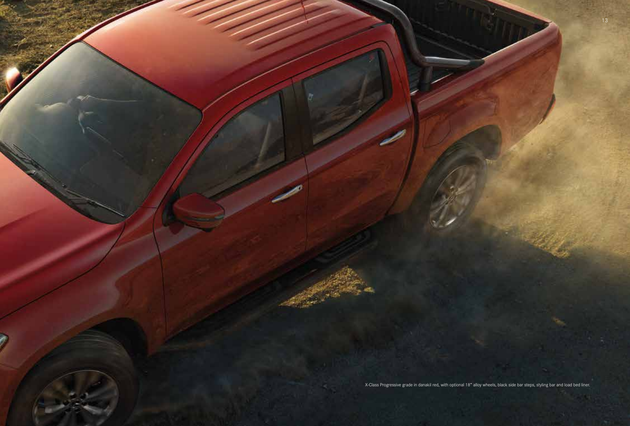
X-Class Progressive grade in danakil red, with optional 18" alloy wheels, black side bar steps, styling bar and load bed liner.