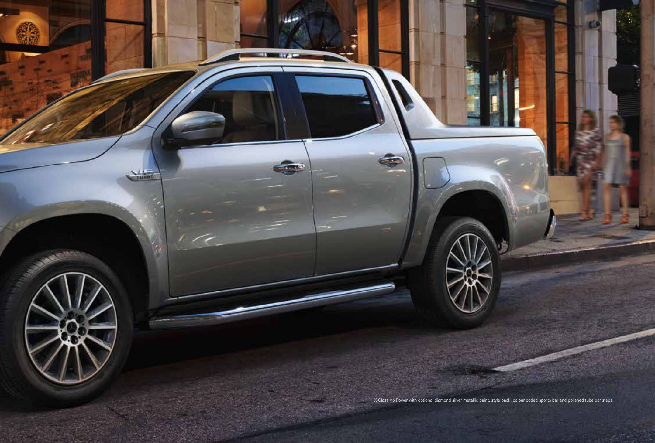
X-Class V6 Power with optional diamond silver metallic paint, style pack, colour coded sports bar and polished tube bar steps.