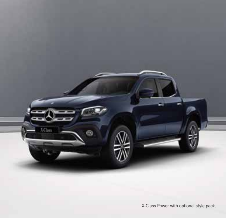
X-Class Power with optional style pack.