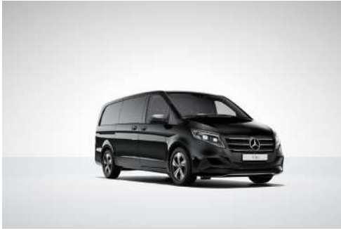
Obsidian black metallic