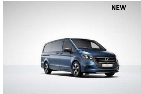
Sodalite blue metallic