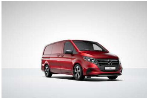
Hyacinth red metallic