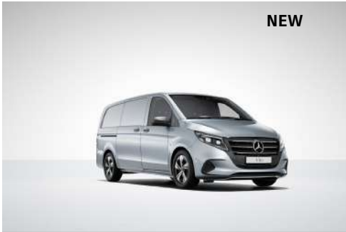
High-tech silver metallic