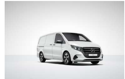
Rock crystal white metallic