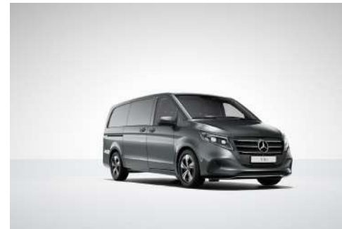
Graphite grey metallic