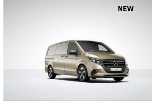
Kalahari gold metallic