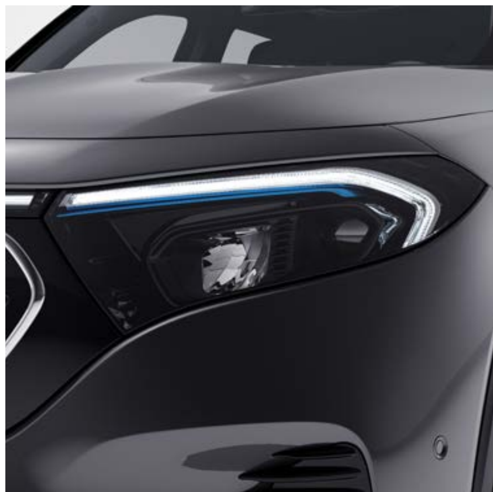
LED High Performance headlamps with EQ-specific blue element with high beam assist