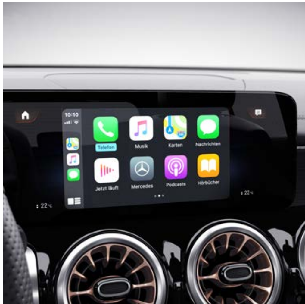
Apple CarPlay™ and Android Auto