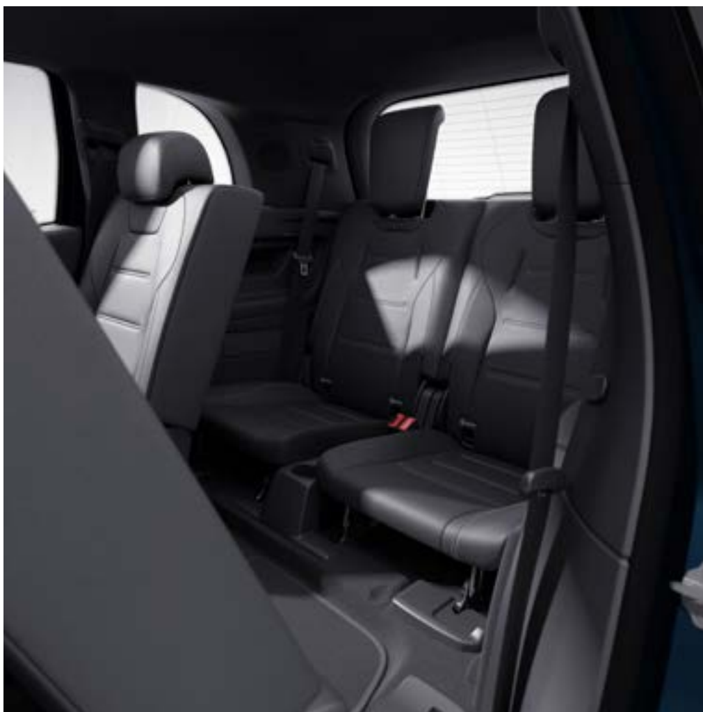
Third seat row for 2 additional, full-featured seats