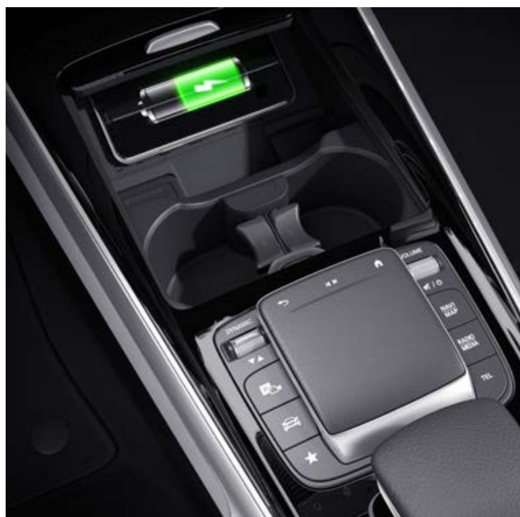
Wireless Charging System