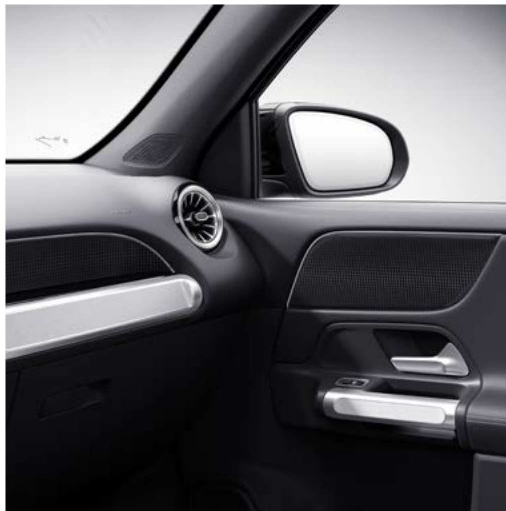
Advance Sound System with 10 speakers