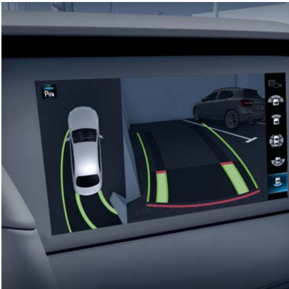
Active Parking Assist with Parking Package and 360° camera