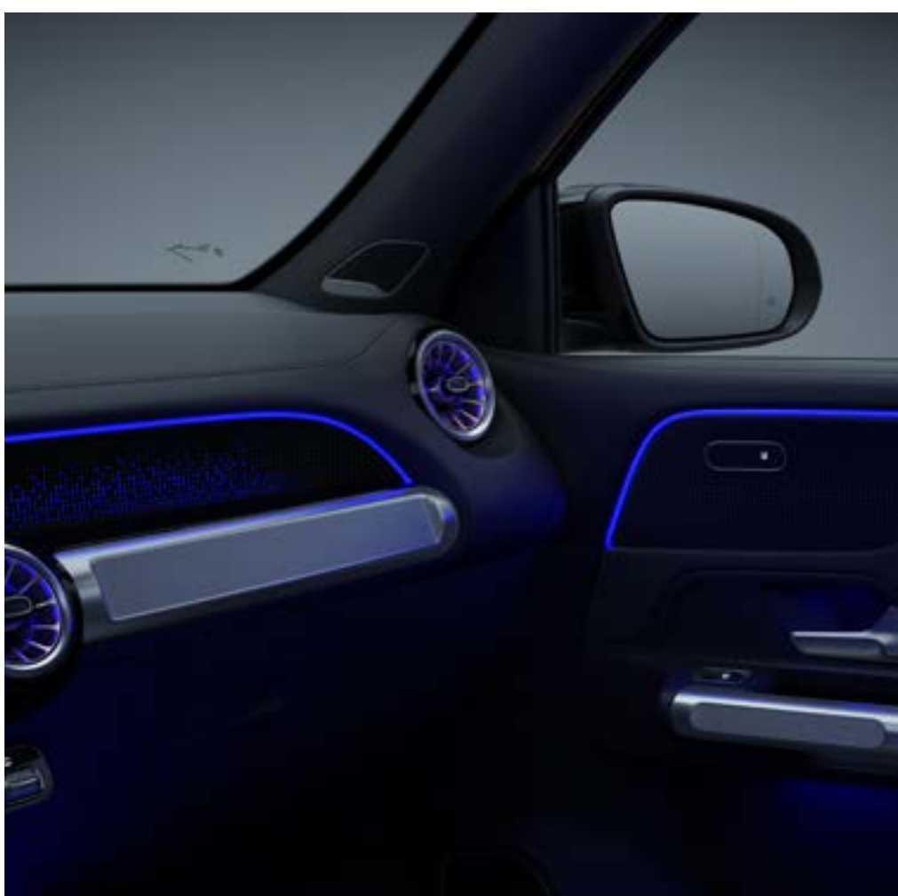
Spiral-look trim elements, backlit