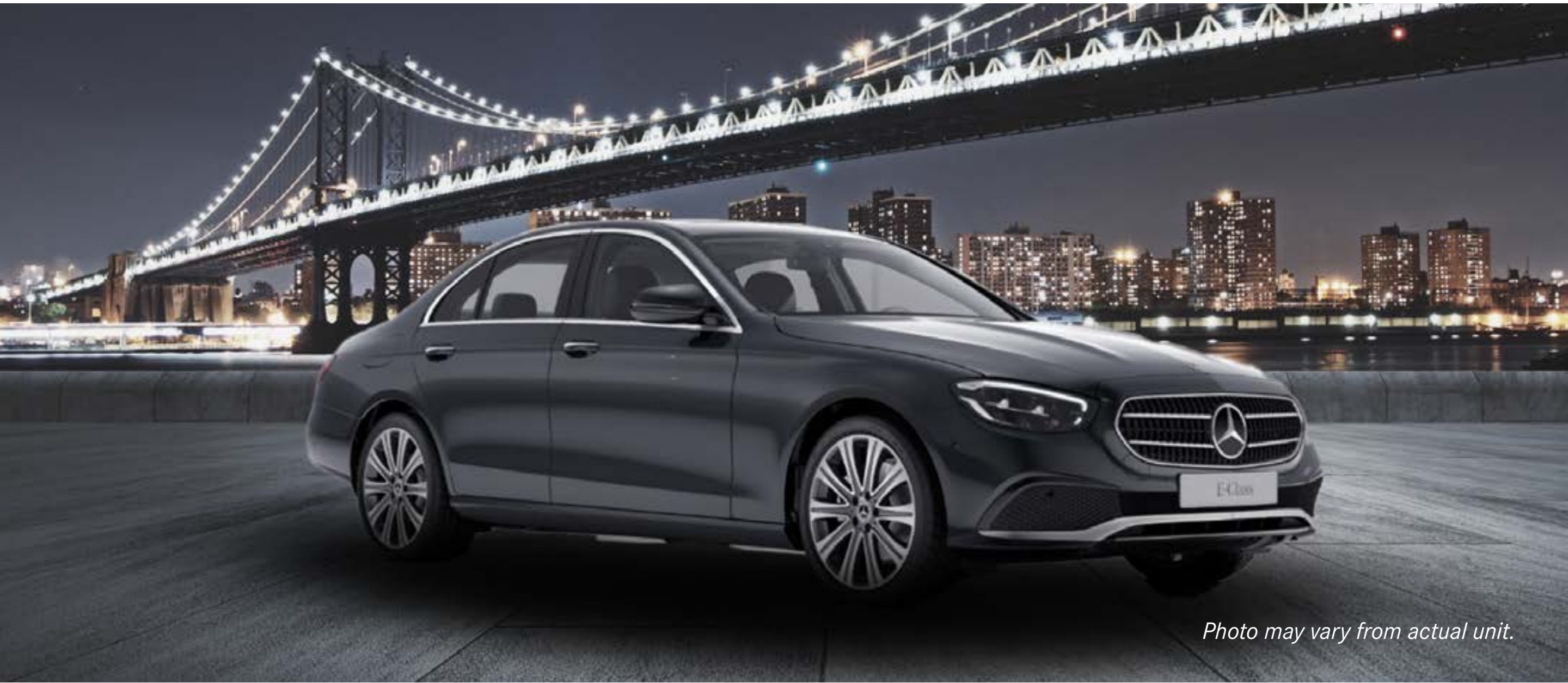
Photo may vary from actual unit.