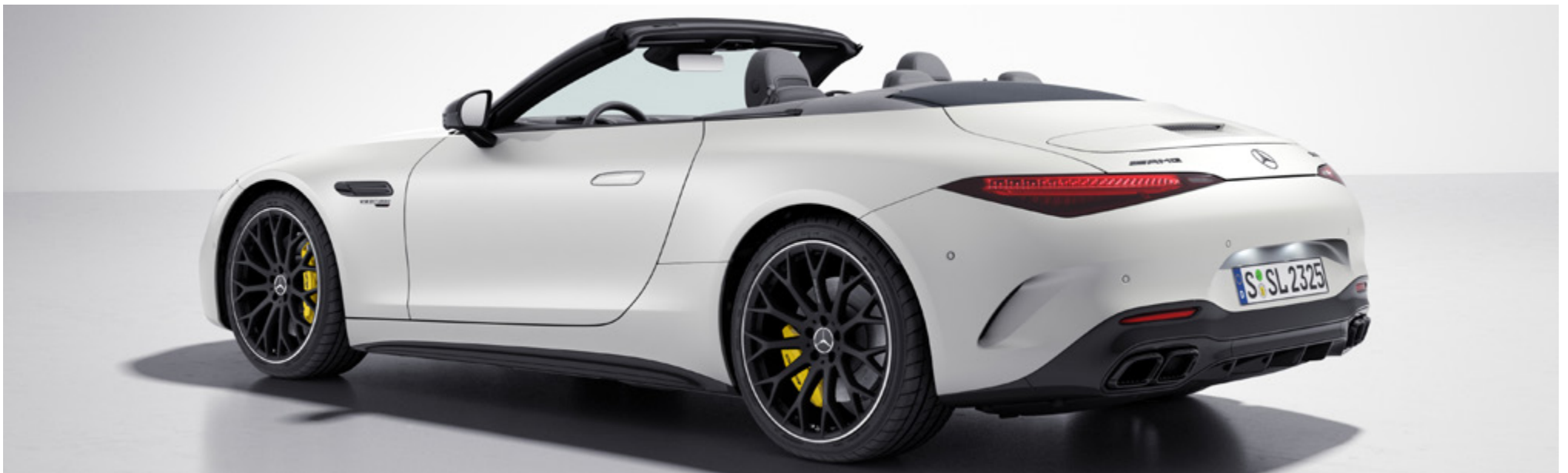
MANUFAKTUR opalite white magno (659U) | 53.3 cm (21") AMG 10-spoke light-alloy wheels (RWG) | AMG Night package (P60) | AMG Night Package II (PAZ)