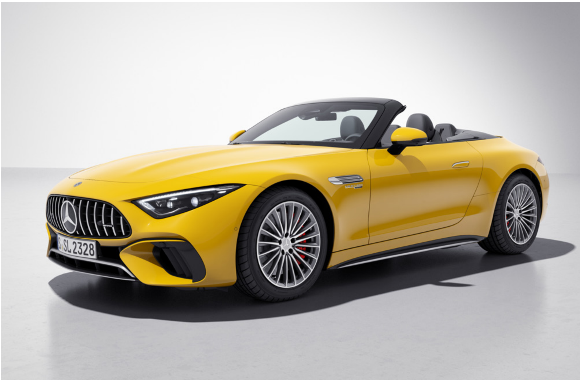
sun yellow (914U), 48.3 cm (19") AMG multi-spoke light-alloy wheels (RVC)