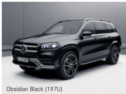
Obsidian Black (197U)