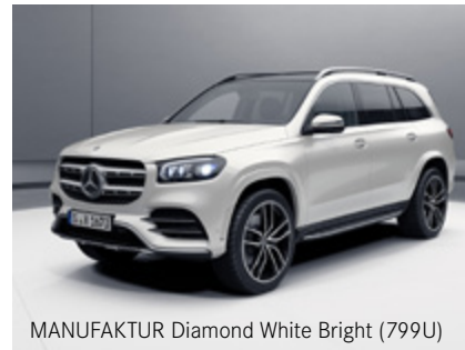
MANUFAKTUR Diamond White Bright (799U)