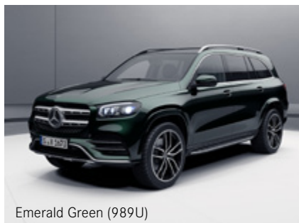
Emerald Green (989U)