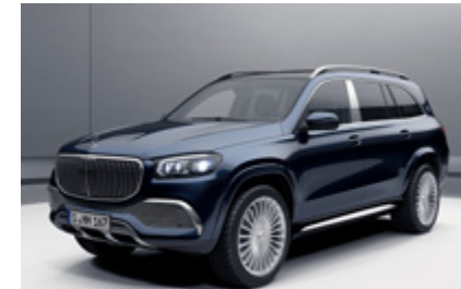
Cavansite Blue (890U)