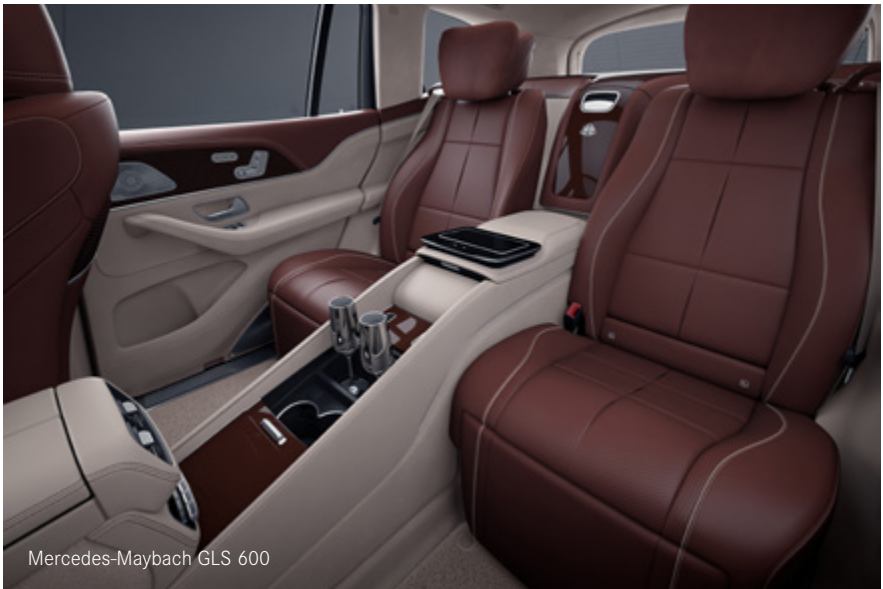
Nappa leather mahogany brown / macchiato beige (954A)