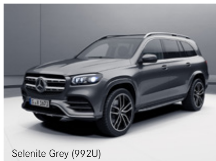
Selenite Grey (992U)