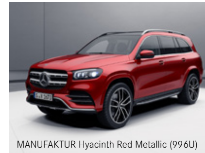
MANUFAKTUR Hyacinth Red Metallic (996U)