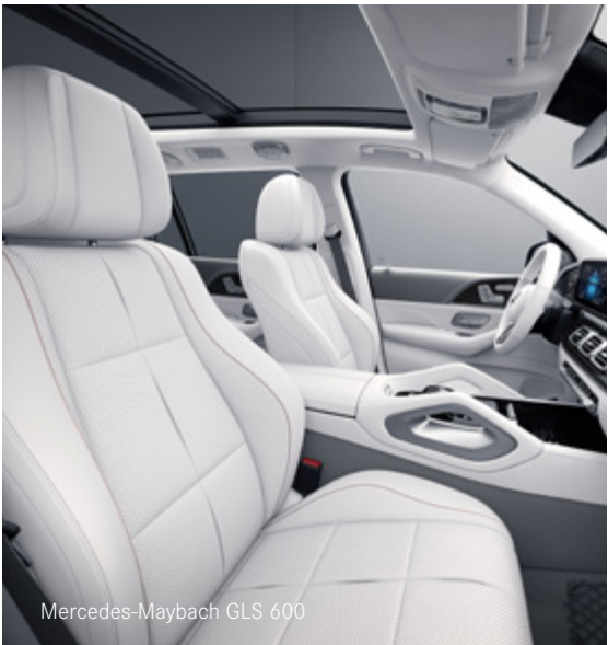
MANUFAKTUR crystal white / silver grey pearl (959A)