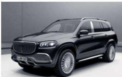
Obsidian Black (197U)