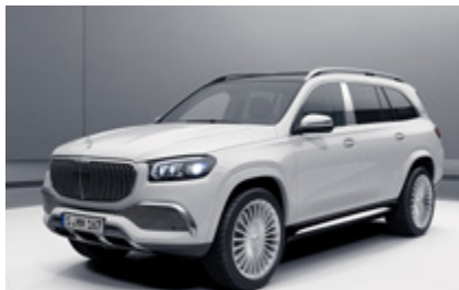
Polar White (149U)