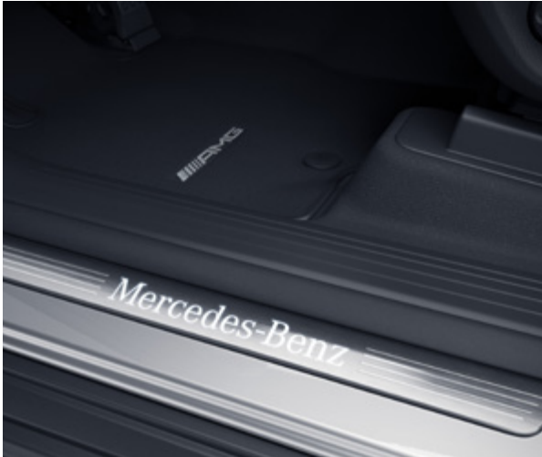
AMG floor mats (U26)