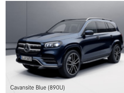
Cavansite Blue (890U)