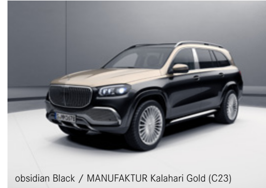
obsidian Black / MANUFAKTUR Kalahari Gold (C23)