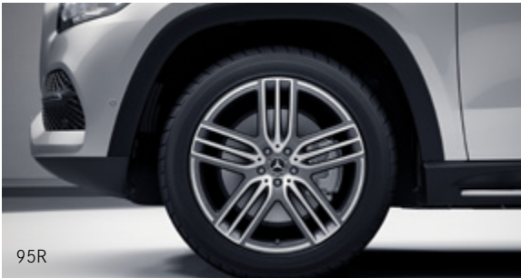
95R 53.3 cm (21") 5-triple-spoke light-alloy wheels painted in high-gloss himalayas grey with a high-sheen finish. Front: 275/45 R 21 tyres on 10 J x 21 ET 62.5 Rear: 315/40 R 21 tyres on 11 J x 21 ET 55 including black cladding on the rear axle GLS 400 d GLS 580 R 41,200 R 24,600