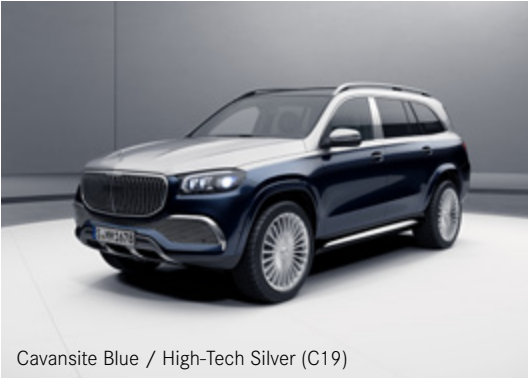
Cavansite Blue / High-Tech Silver (C19)