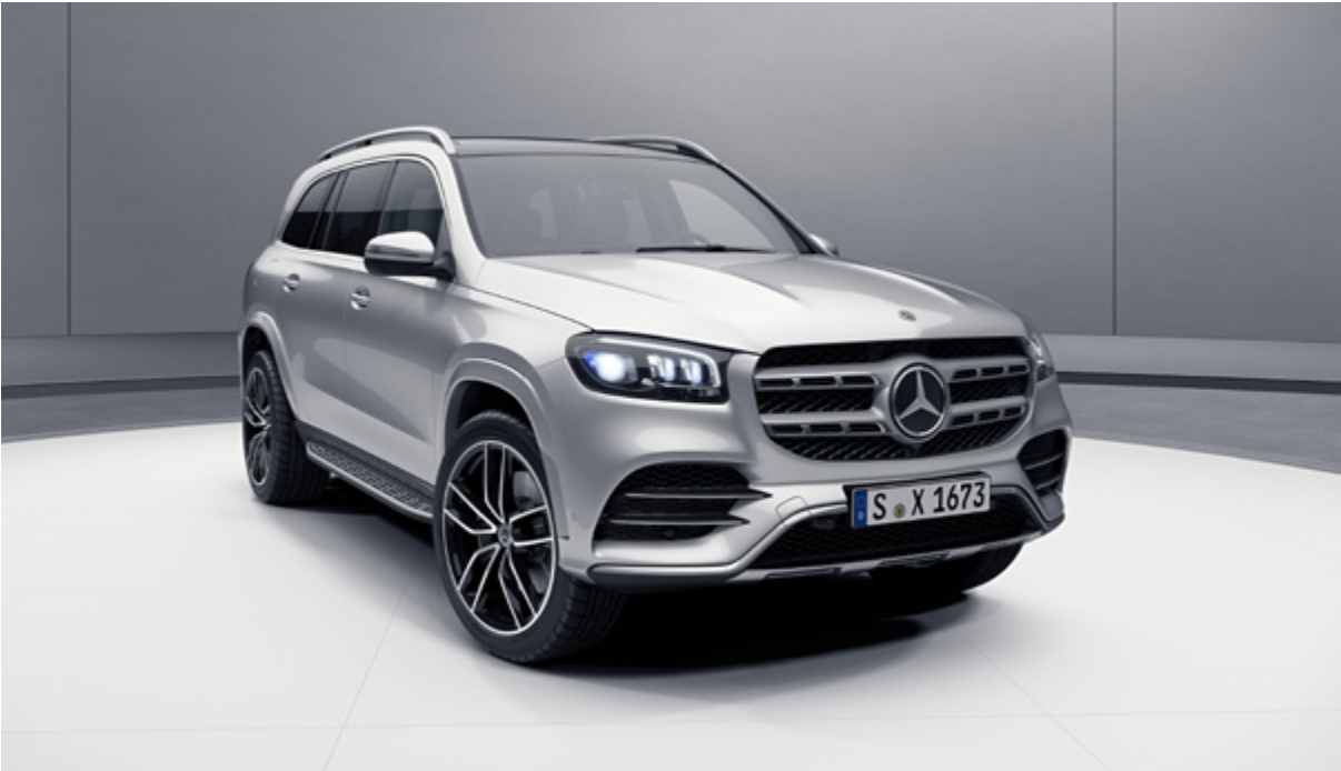
AMG Bodystyling (772)