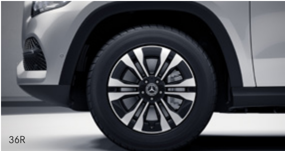
36R 6-twin-spoke light-alloy wheel 48,3 cm (19") Aerodynamically optimised, painted in high-gloss black with a high-sheen finish, with 275/55 R 19 tyres on 8.5 J x 19 ET 62.5 wheels GLS 400 d R 5,500