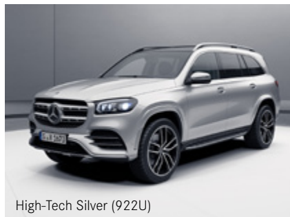
High-Tech Silver (922U)