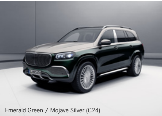
Emerald Green / Mojave Silver (C24)