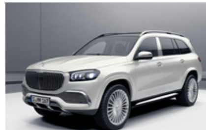
MANUFAKTUR Diamond White Bright (799U)