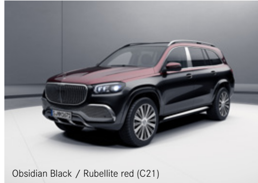
Obsidian Black / Rubellite red (C21)