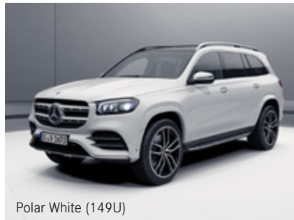
Polar White (149U)