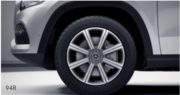
94R 50.8 cm (20") 8-spoke light-alloy wheels painted in high-gloss himalayas grey with a high-sheen finish with 275/50 R 20 tyres on 8.5 J x 20 ET 62.5 wheels GLS 400 d GLS 580 R 21,400 Standard