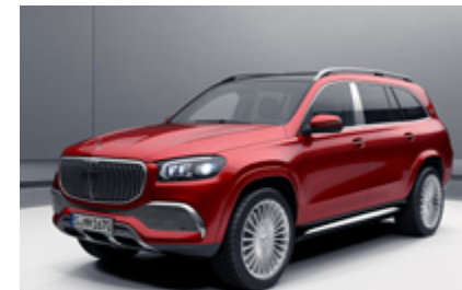
MANUFAKTUR Hyacinth Red Metallic (996U)