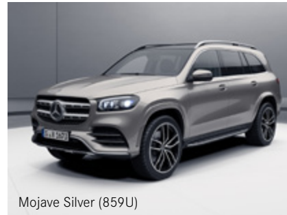
Mojave Silver (859U)