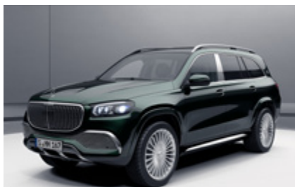
Emerald Green (989U)