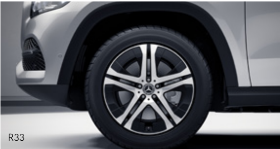
R33 50.8 cm (20") 5-twin-spoke light-alloy wheels aerodynamically optimised, painted in high-gloss black with a high-sheen finish, with 275/50 R 20 tyres on 8.5 J x 20 ET 62.5 wheels GLS 400 d GLS 580 R 21,400 R 0