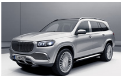
High-Tech Silver (922U)