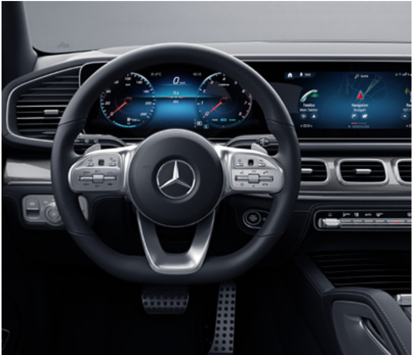
Multifunction sports steering wheel in nappa leather (L5C)