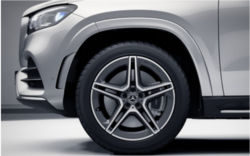
53.3 cm (21-inch) AMG 5-twin-spoke light-alloy wheels (RWF)