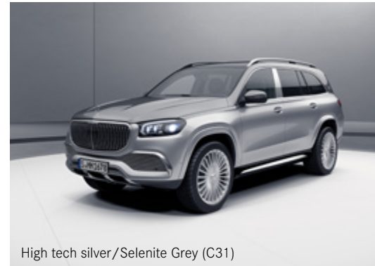
High tech silver / Selenite Grey (C31)