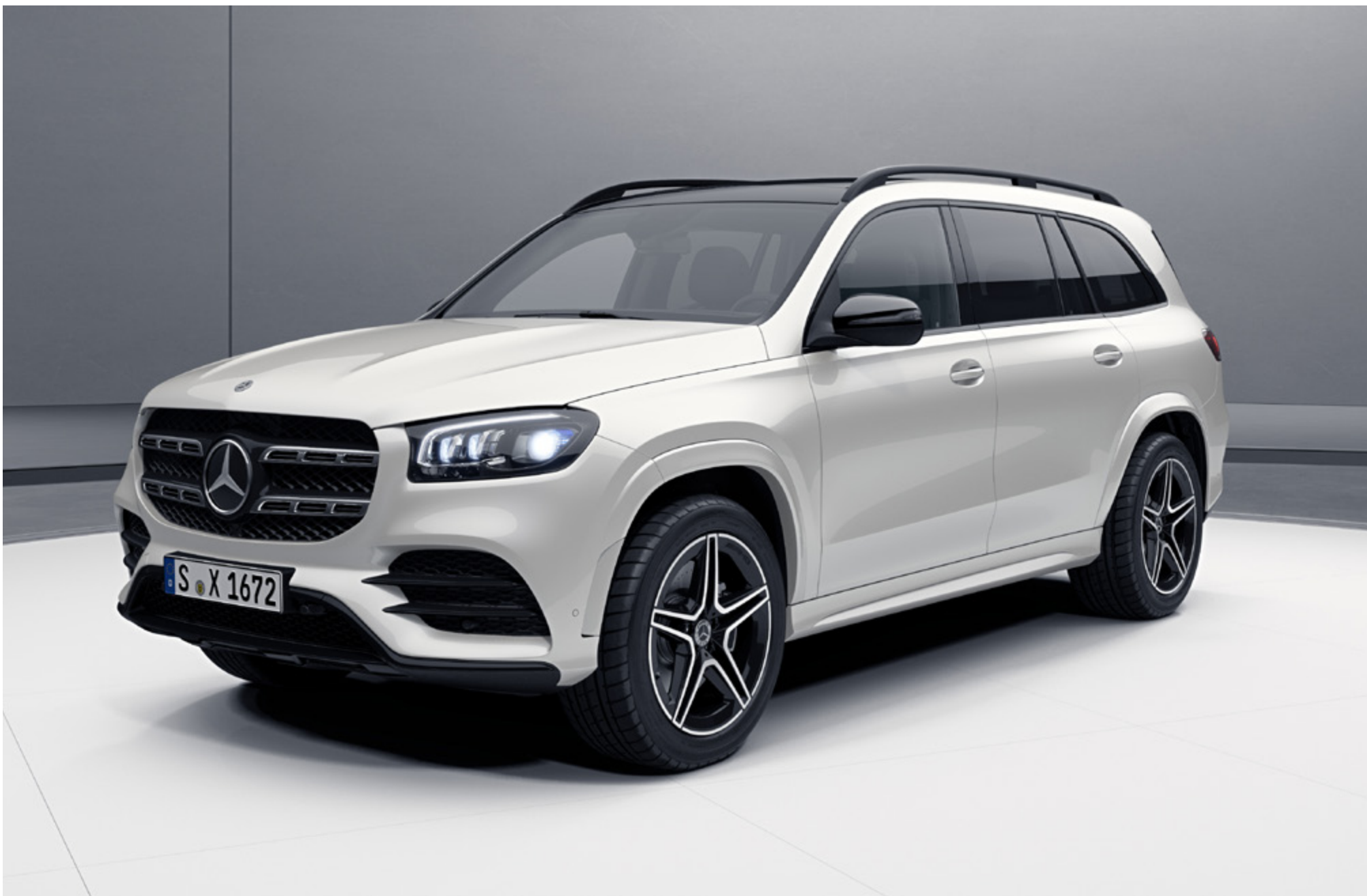
MANUFAKTUR diamond white bright (799U) | 53.3 cm (21") AMG 5-twin-spoke light-alloy wheels (RWH) | Night package (P55) | AMG Line (P31)