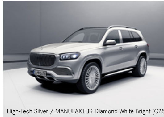
High-Tech Silver / MANUFAKTUR Diamond White Bright (C25)