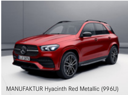
MANUFAKTUR Hyacinth Red Metallic (996U)