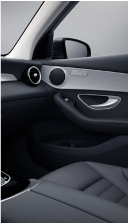
Brushed aluminium trim with light longitudinal grain (H46)