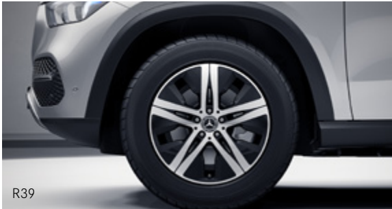
48.3 cm (19") 5-spoke light-alloy wheels (NICW 847) GLE 300 d 4M GLE 400 d 4M, GLE 450 4M R 22,500 R 5,400