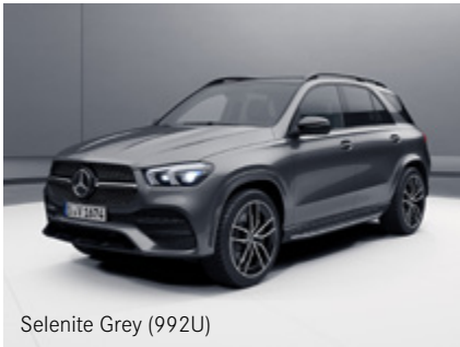
Selenite Grey (992U)