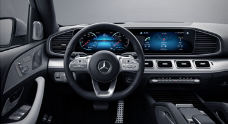
Multifunction sports steering wheel in nappa leather (L5C) | Interior Chrome package (901)