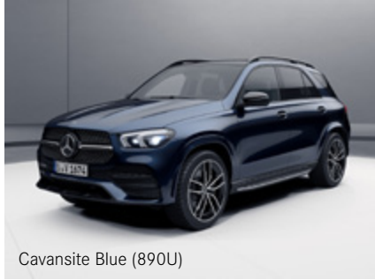
Cavansite Blue (890U)