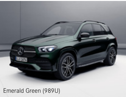
Emerald Green (989U)