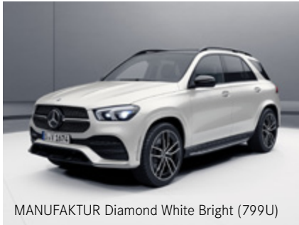
MANUFAKTUR Diamond White Bright (799U)