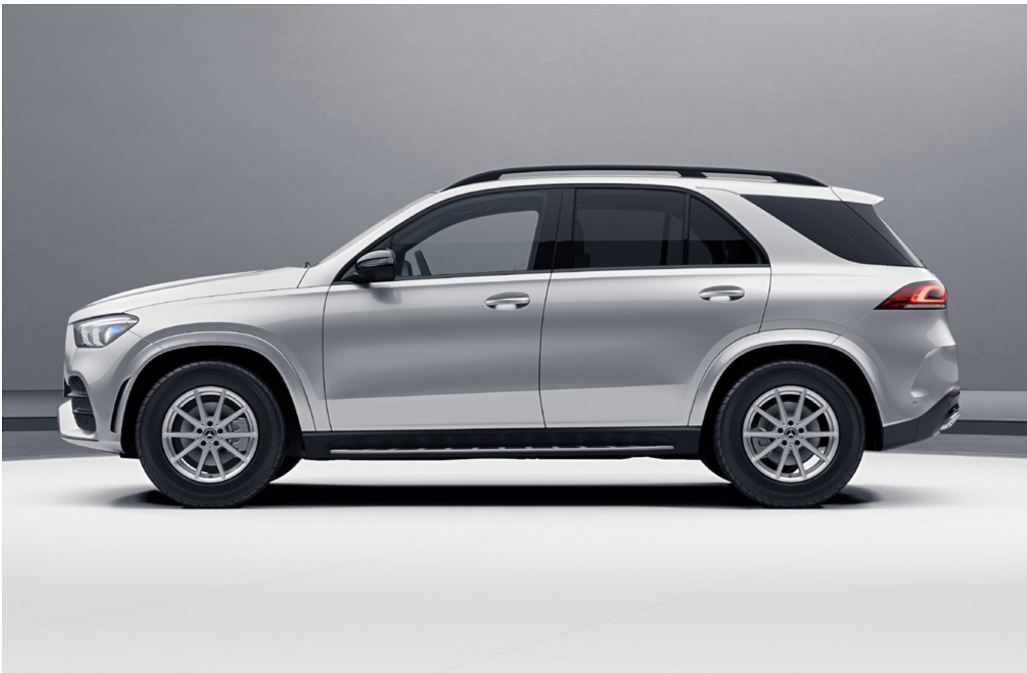
Night package (P55) | AMG Line exterior (P31) | 10-spoke light-alloy wheels (51R)