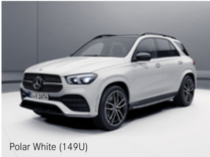
Polar White (149U)