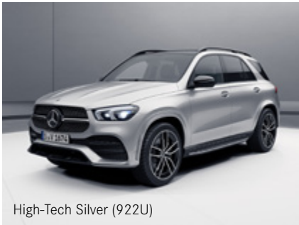
High-Tech Silver (922U)