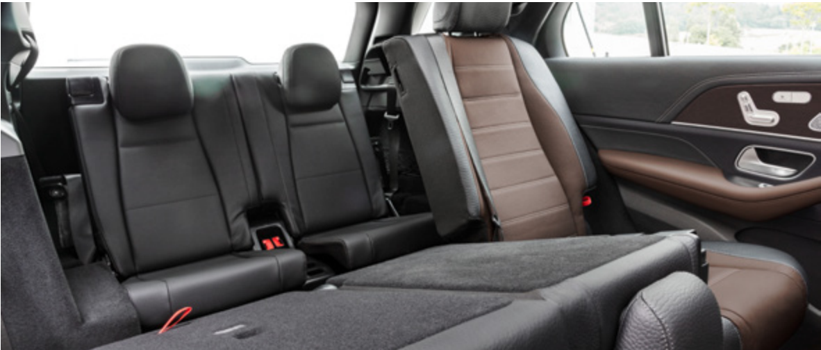
3rd row of seats (847) | Rough leather espresso brown/magma grey, brown open-pore walnut wood trim (201A/H22)