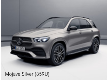
Mojave Silver (859U)