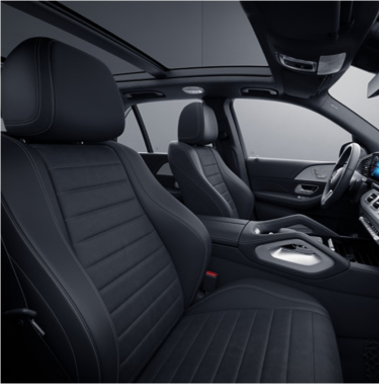
DINAMICA microfibre black (601A) | Roof liner in black fabric (51U)