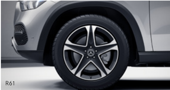
50.8 cm (20") 5-spoke light-alloy wheels GLE 300 d 4M GLE 400 d 4M, GLE 450 4M R 34,300 R 22,500