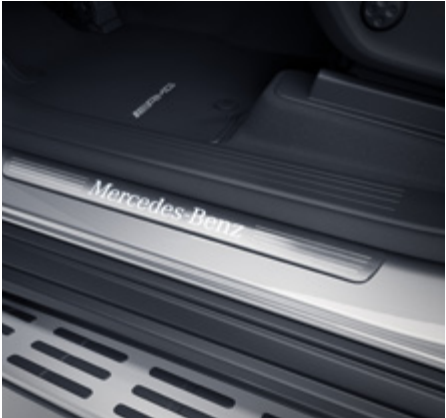
AMG floor mats (U26)