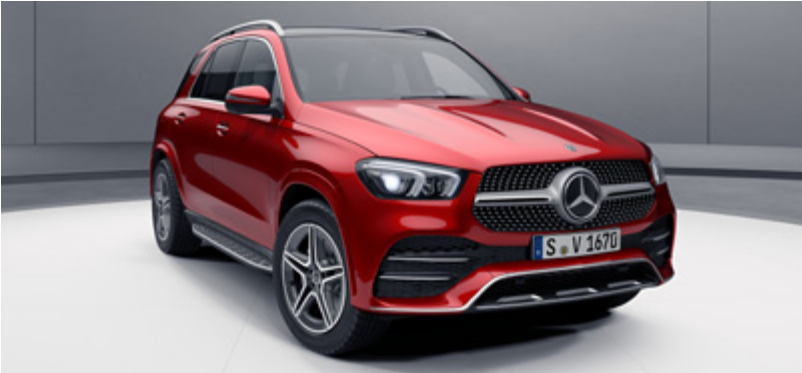
AMG Bodystyling (772)