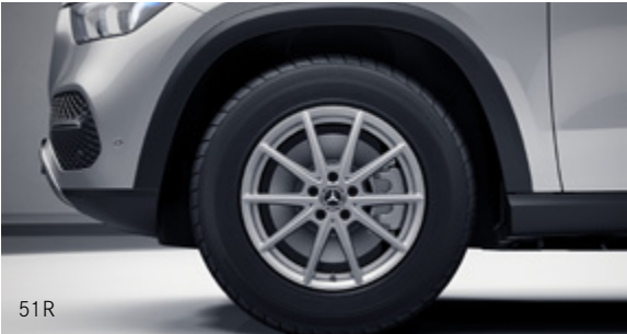
45,7 cm (18") 10-spoke light-alloy wheels GLE 300 d 4M Standard