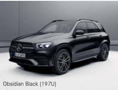
Obsidian Black (197U)