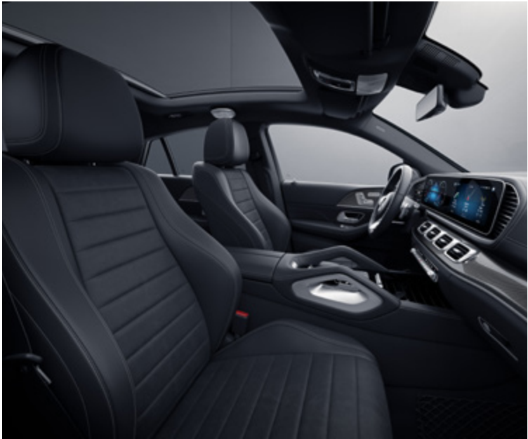
DINAMICA microfibre black (601A) | Roof liner in black fabric (51U)