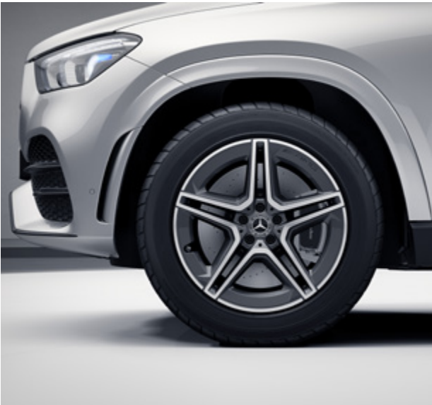
50.8 cm (20") AMG 5-twin-spoke light-alloy wheels (RZV)