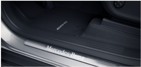
AMG floor mats (U26)