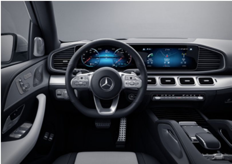
Multifunction sports steering wheel in nappa leather (L5C) | Interior Chrome package (901)