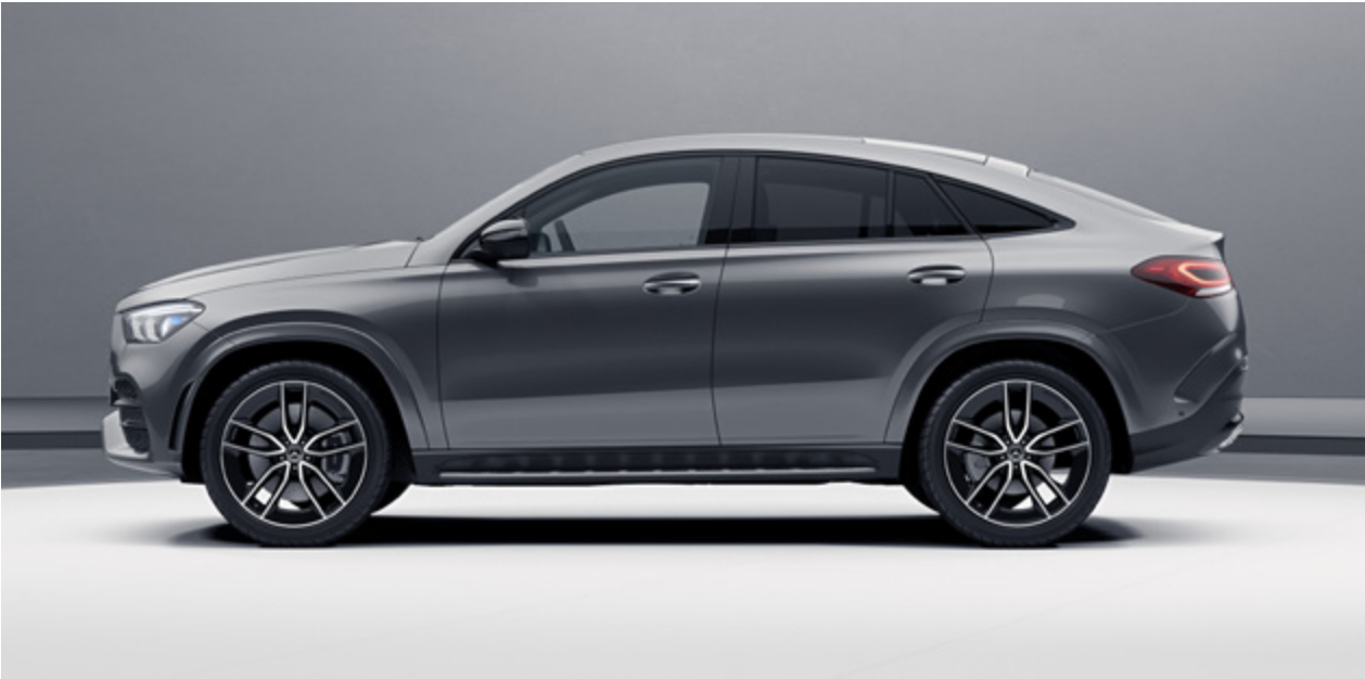
AMG Bodystyling (772)