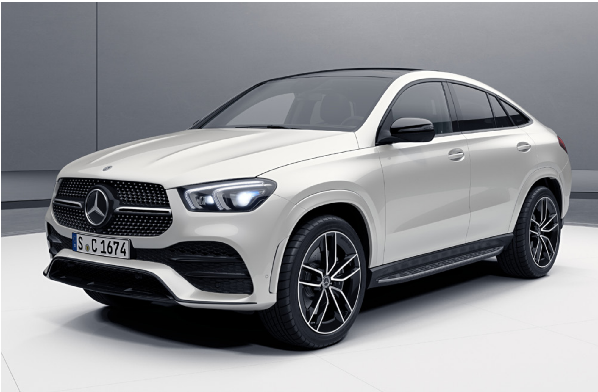
MANUFAKTUR diamond white bright (799U) | 55.9 cm (22") AMG 5-twin-spoke light-alloy wheels (RXT) | Night package (P55) | AMG Line exterior (P31)