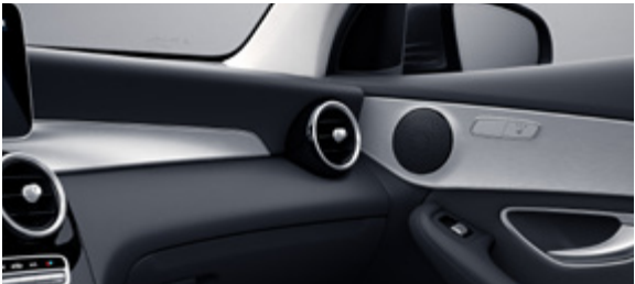
Brushed aluminium trim with light longitudinal grain (H46)