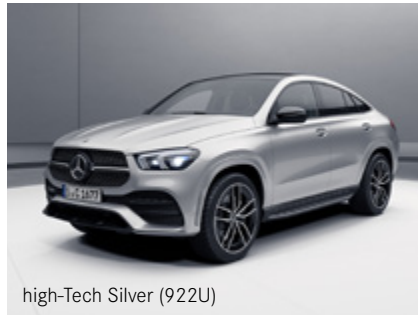
high-Tech Silver (922U)