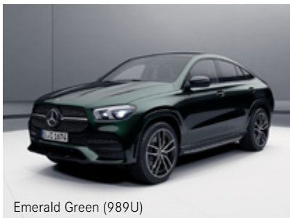
Emerald Green (989U)