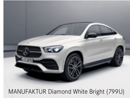
MANUFAKTUR Diamond White Bright (799U)