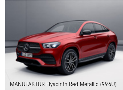
MANUFAKTUR Hyacinth Red Metallic (996U)