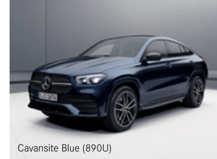
Cavansite Blue (890U)