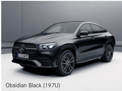
Obsidian Black (197U)