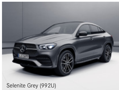
Selenite Grey (992U)