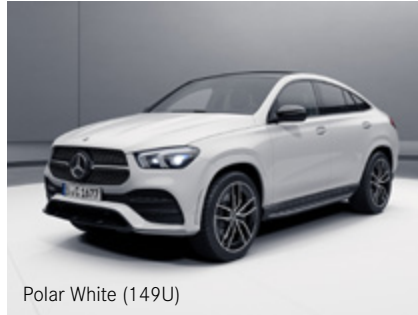
Polar White (149U)