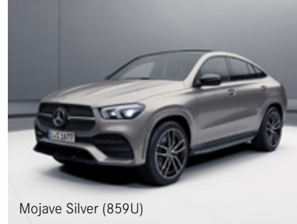
Mojave Silver (859U)