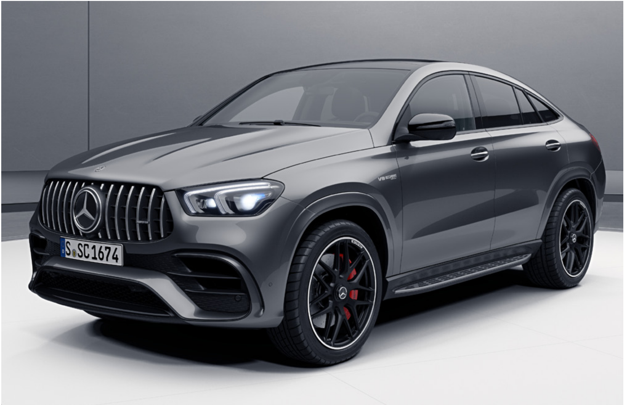
Selenite grey (992U) | 53.3 cm (21") AMG 5-twin-spoke light-alloy wheels (RWE) | AMG Night package (P60)