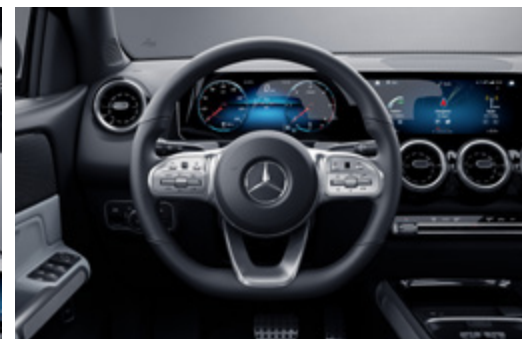
Multifunction sports steering wheel in nappa leather (L5C) | Galvanised steering-wheel gearshift paddles (431)