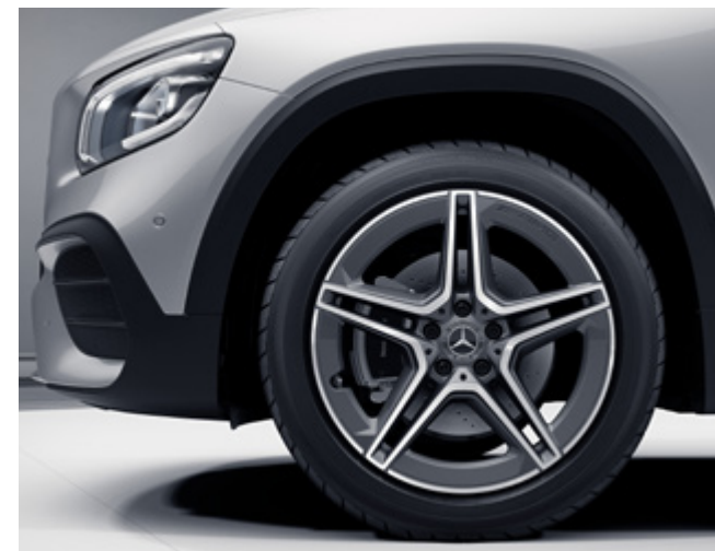
48.3 cm (19") AMG 5-twin-spoke light-alloy wheels (RTF)

Alternative wheelss: RTG/RVV/RVW | Alternative upholstery: 211A, 214A, 257A,258A | NICW P59 Images for illustration purposes | Item may differ due to South African Specifications