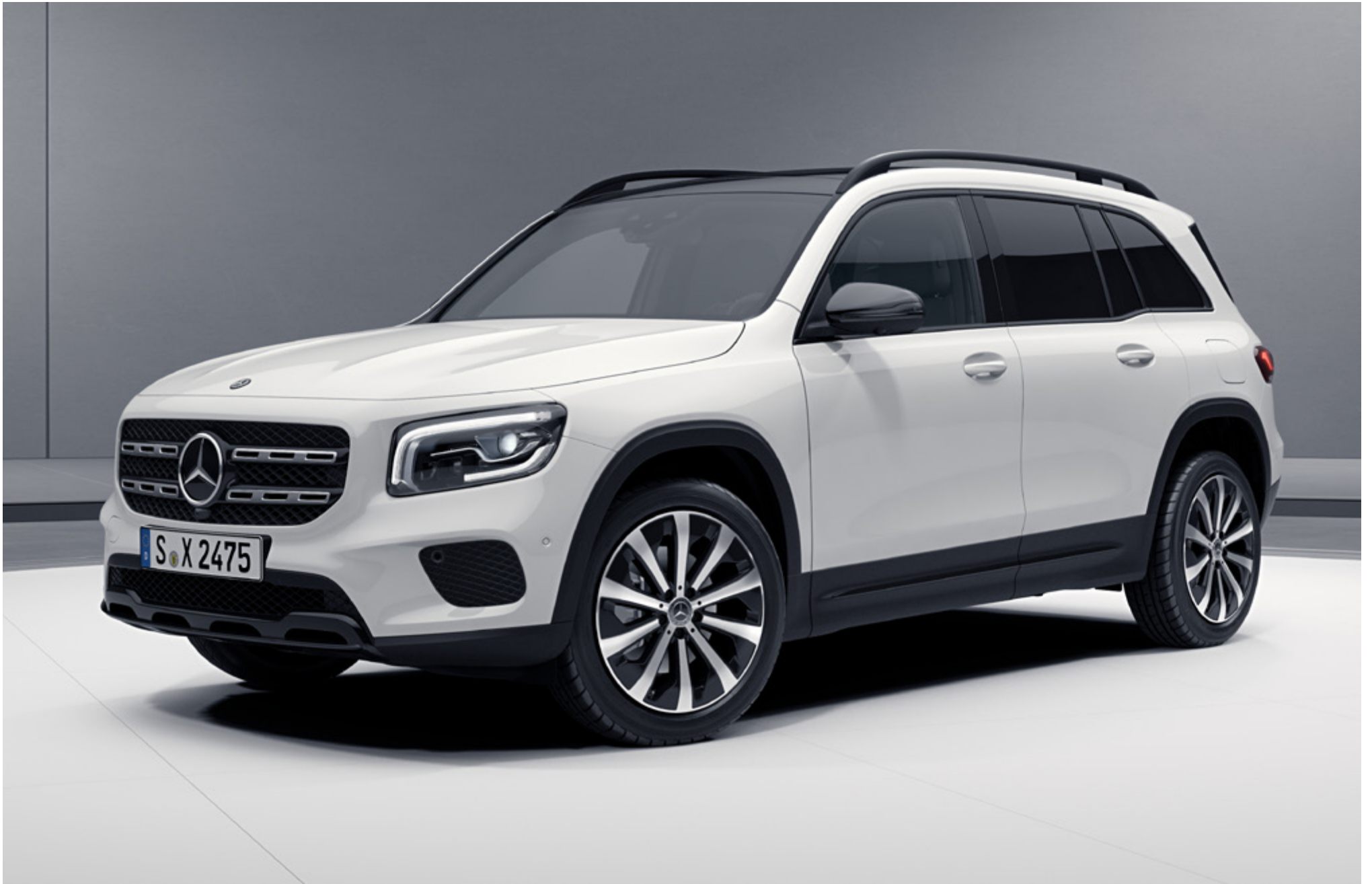
Polar White (149U) | 48.3 cm (19") 10-spoke light-alloy wheels (R58) | Night package (P55) | Progressive (P59)