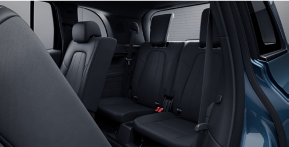
3rd row of seats for 2 people (847)