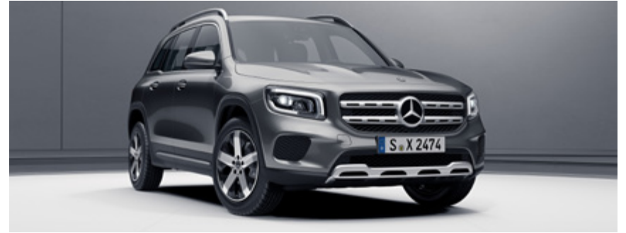
Polished aluminium roof rails (725)