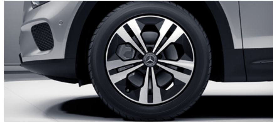
45.7 cm (18") 5-twin-spoke light-alloy wheels (R38)