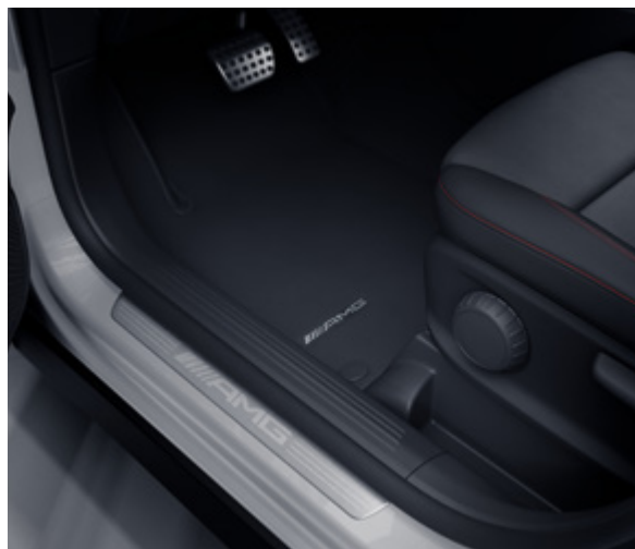
AMG floor mats (U26)