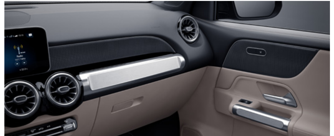
Spiral-look trim elements (H60)