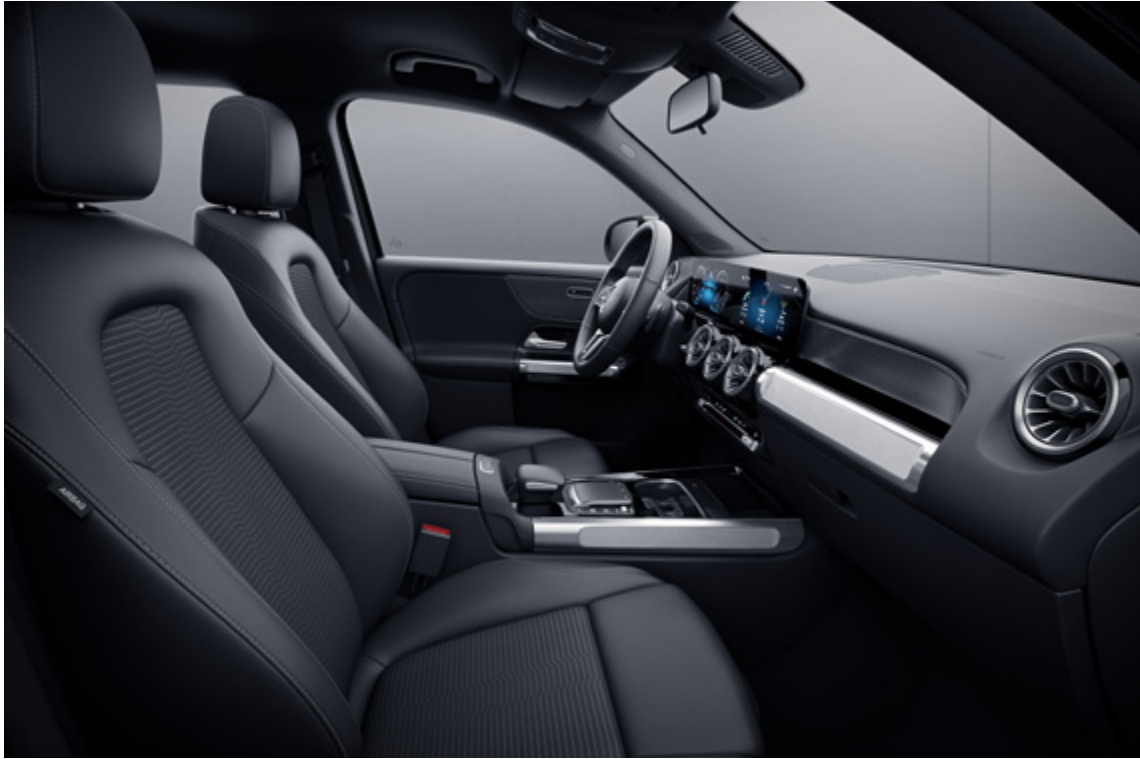
ARTICO man-made leather / Fléron fabric black (321A) | Sports Seats (7U2)