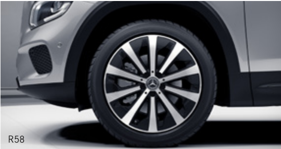
48.3 cm (19") 10-spoke light-alloy wheels In conjunction with P55/P59 R 15,100