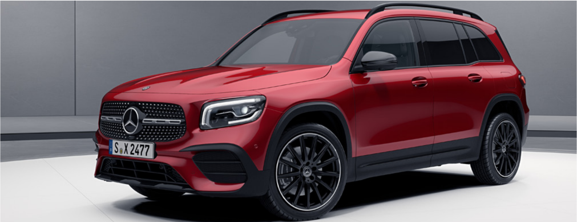
MANUFAKTUR patagonia red metallic (993U) | 50.8 cm (20") AMG multi-spoke light-alloy wheels (RVW) | AMG Line (950) | Night package (P55)