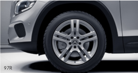
45.7 cm (18") 5-twin-spoke light-alloy wheels (OICW 428) In conjunction with (P55+P59)/P59 R 0