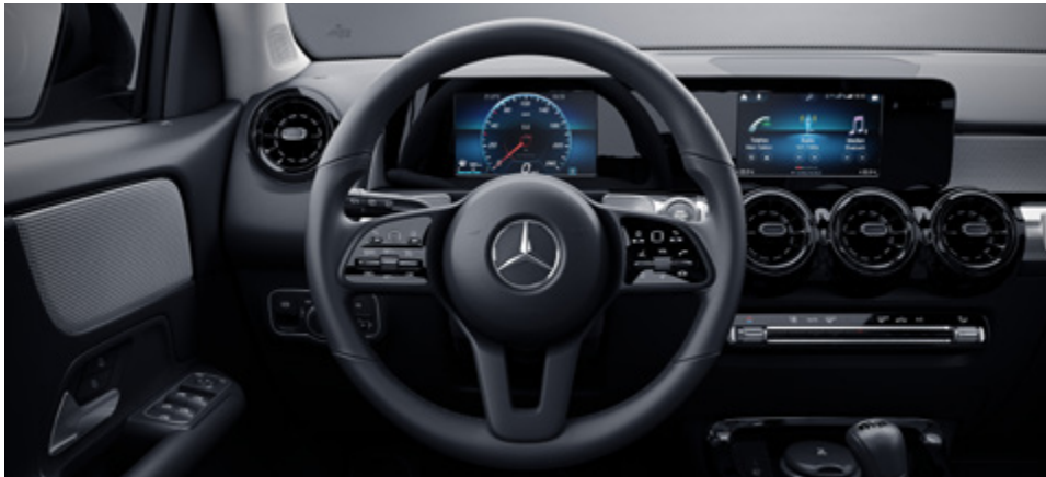
Multifunction sports steering wheel in leather (L3E)