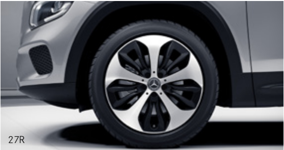
48.3 cm (19") 5-twin-spoke light-alloy wheels In conjunction with P59/P55 R 15,100