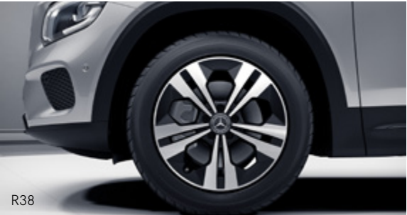
45.7 cm (18") 5-twin-spoke light-alloy wheels (OICW 428) Standard