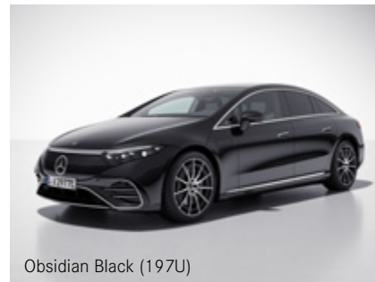
Obsidian Black (197U)