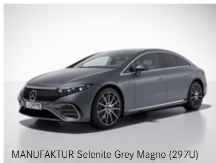
MANUFAKTUR Selenite Grey Magno (297U)