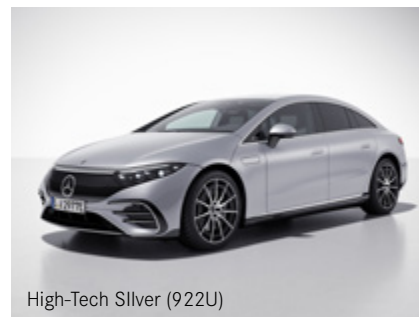
High-Tech Silver (922U)