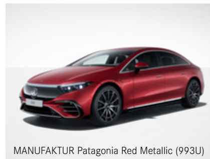
MANUFAKTUR Patagonia Red Metallic (993U)