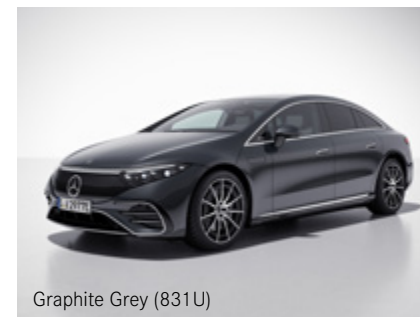
Graphite Grey (831U)