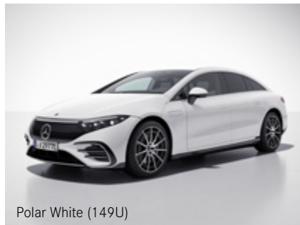
Polar White (149U)