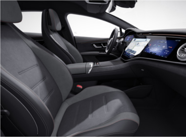
ARTICO man-made leather upholstery / MICROCUT microfibre two-tone - black / space grey (651A) | Sports seats (7U4)