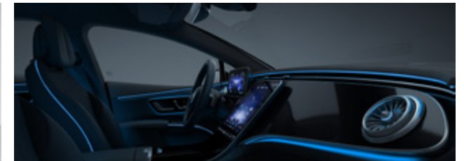
Ambient lighting (891)