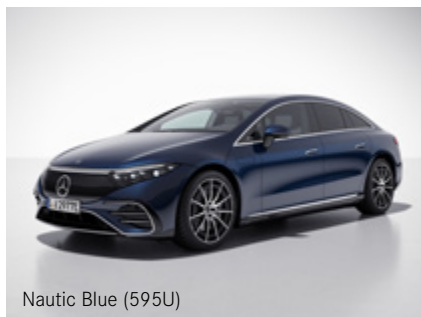
Nautic Blue (595U)