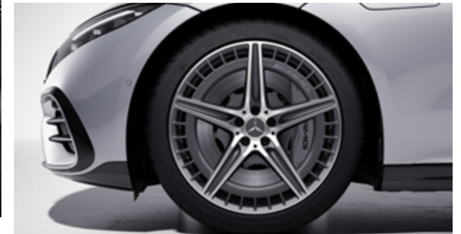
53.3 cm (21") AMG 5-twin-spoke light-alloy wheels (RW0)