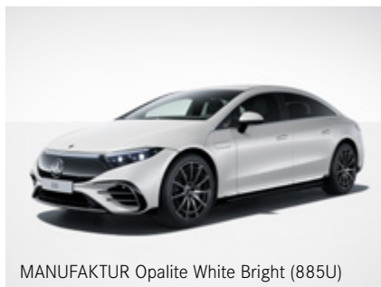
MANUFAKTUR Opalite White Bright (885U)