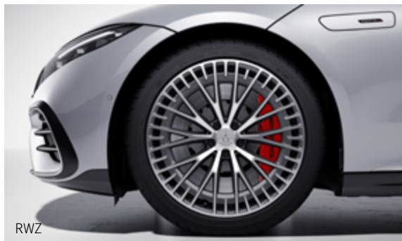
53.3 cm (21") AMG cross-spoke light-alloy wheels