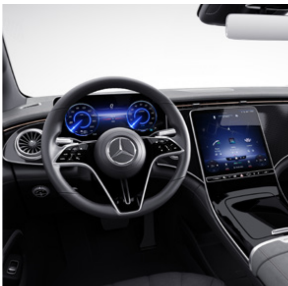
Multifunction steering wheel in nappa leather (L2B) | Galvanised steering-wheel gearshift paddles (431)