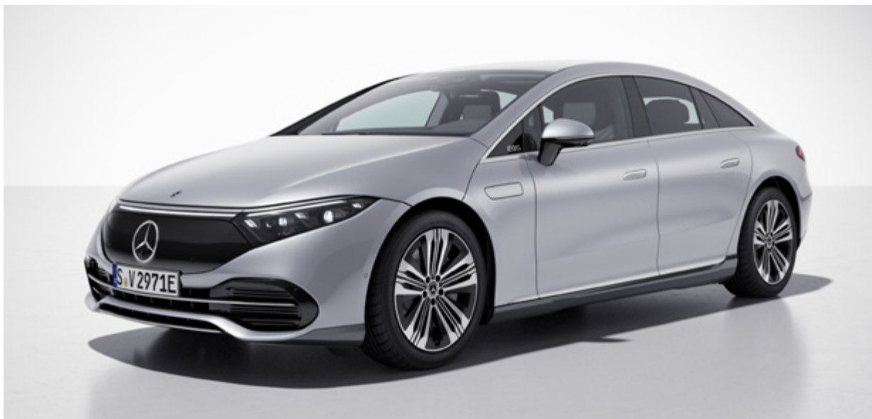
Suspension with adaptive damping system (215)