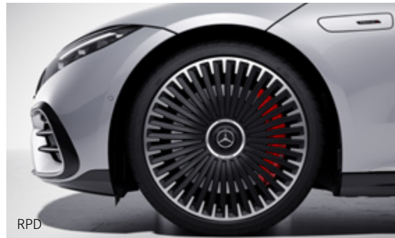
50.8 cm (22") AMG 5-spoke light-alloy wheels