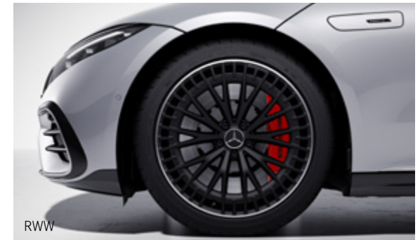
53.3 cm (21") AMG cross-spoke light-alloy wheels