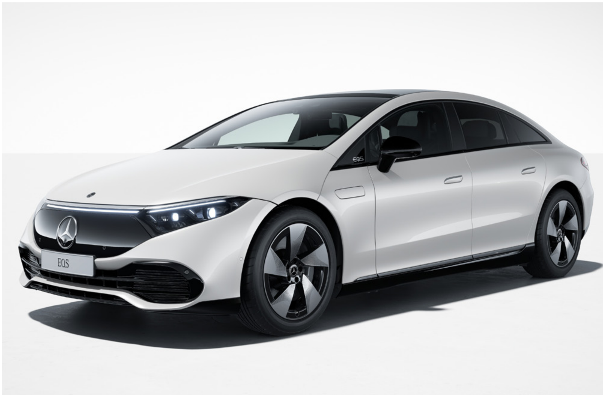
MANUFAKTUR opalite white bright (885U) | 50.8 cm (20") 5-spoke light-alloy wheels (96R) | Night package (P55) | Electric Art exterior (P15)