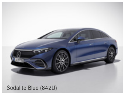
Sodalite Blue (842U)