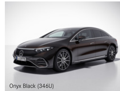
Onyx Black (346U)