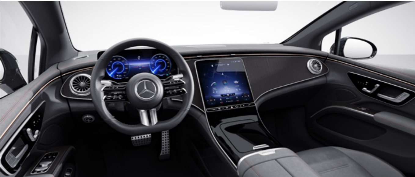
Multifunction sports steering wheel in nappa leather (L5C) | Galvanised steering-wheel gearshift paddles (431) | Anthracite line structure lime wood trim (H08) | AMG floor mats (U26) | Illuminated door sill panels with "Mercedes-Benz" lettering (U25)