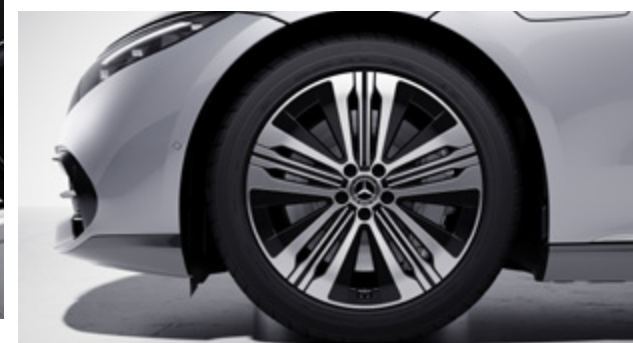
50.8 cm (20") 5-spoke light-alloy wheels (R61)