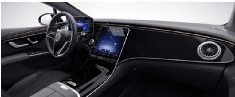
Centre console in high-gloss black (757) | Velour floor mats (U12)