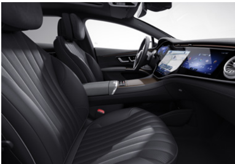
Leather black / space grey (201A) | Roof liner in black fabric (51U) | Comfort Seats (7U2)