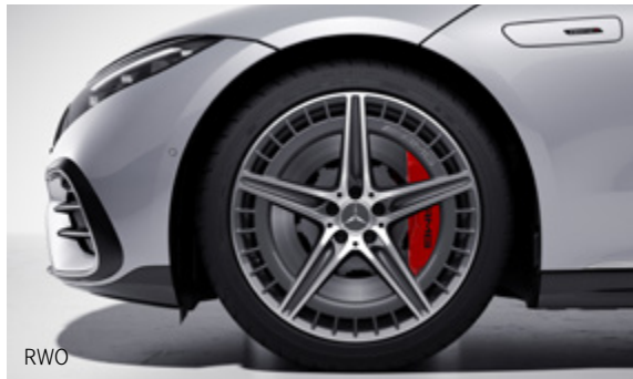
53.3 cm (21") AMG 5-twin-spoke light-alloy wheels