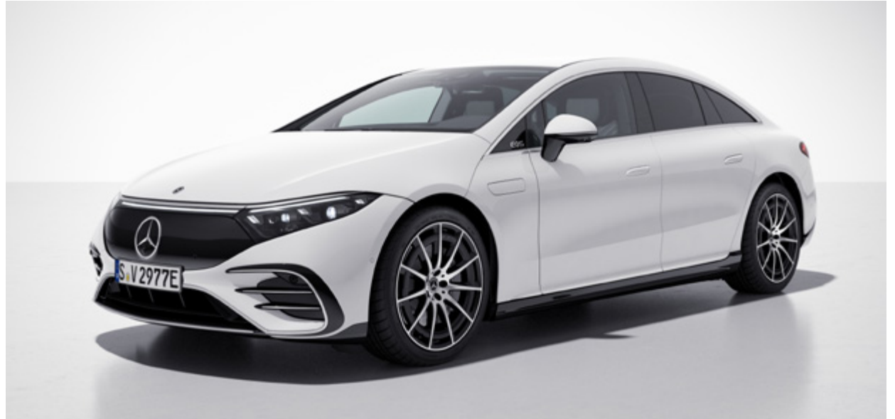
AMG bodystyling (772)