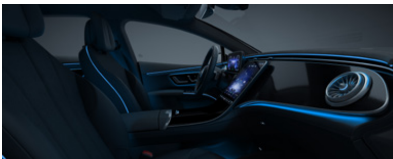
Ambient lighting (891)