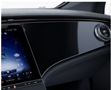
Black fine structure-look trim (H51) | Velour floor mats (U12)