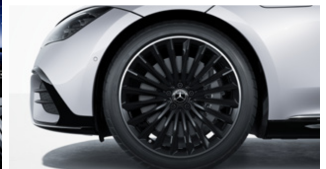
53.3 cm (21") AMG multi-spoke light-alloy wheels (RW1)