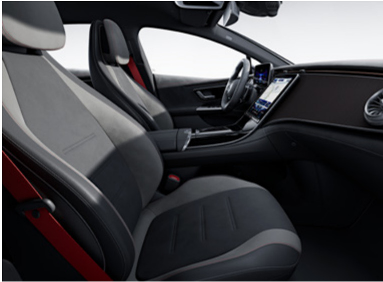
ARTICO man-made leather upholstery/MICROCUT microfibre two-tone black/space grey (651A) | 4-way lumbar support (U22) | Red seat belts (Y05)