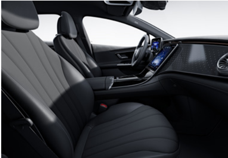
ARTICO man-made leather/fabric black/space grey (301A) | Comfort Seats (7U2)