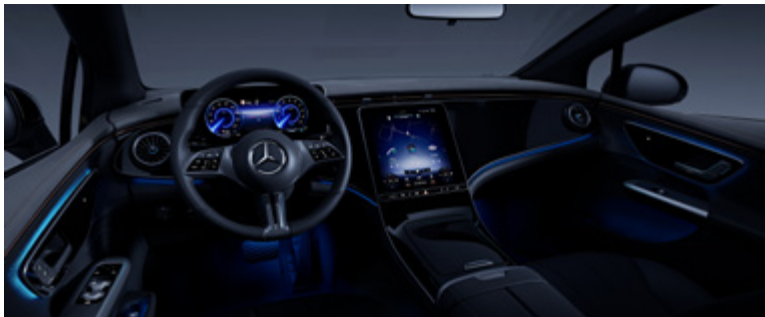
Ambient lighting (891)