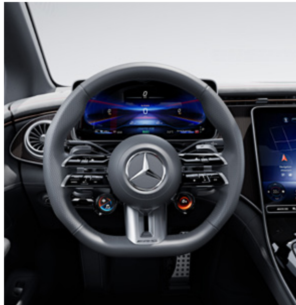
Multifunction sports steering wheel in nappa leather (L5C)