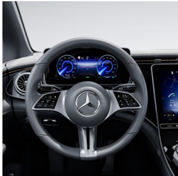
Leather multifunction sports steering wheel (L3E) Steering wheel shift paddles (428)