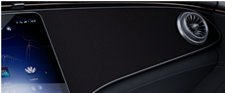
Anthracite linestructure lime wood trim (H08)