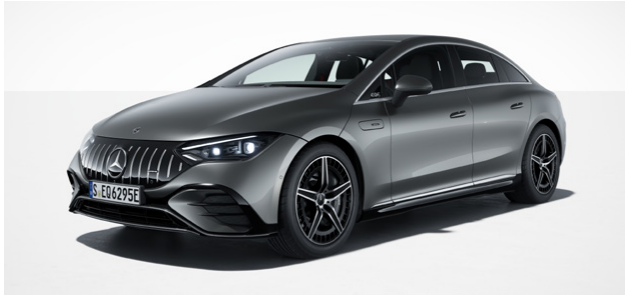
AMG bodystyling (772) | Roof liner in black fabric (51U) | Ambient lighting (891) | Sports seats (7U4)