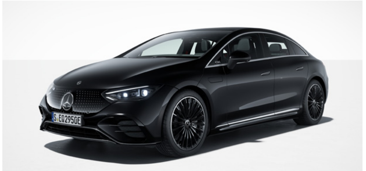
AMG bodystyling (772) | Roof liner in black fabric (51U) | Ambient lighting (891) | Sports seats (7U4)