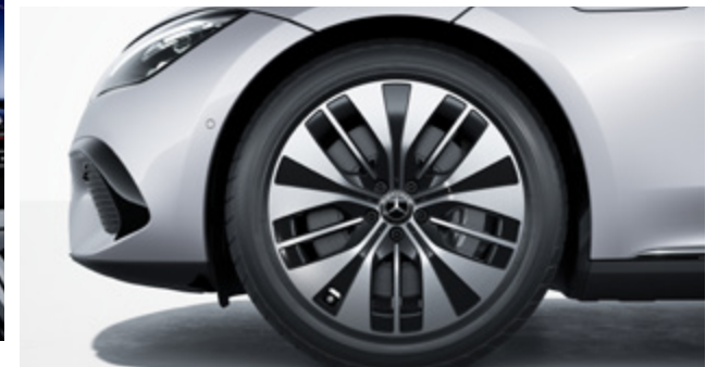
50.8 cm (20") 5-twin-spoke light-alloy wheels (60R)