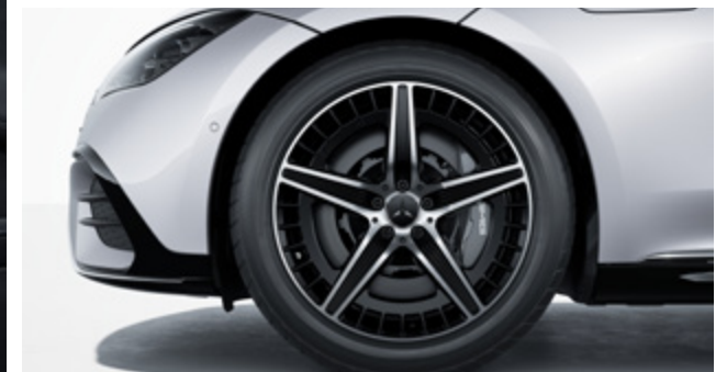
50.8 cm (20") AMG 5-twin-spoke light-alloy wheels (RTM)