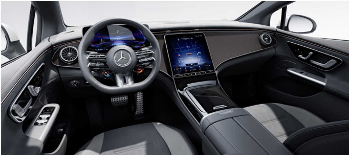
AMG Performance steering wheel in nappa leather (L6) | AMG steering wheel buttons (U88) Anthracite linstucture lime wood trim (H08)