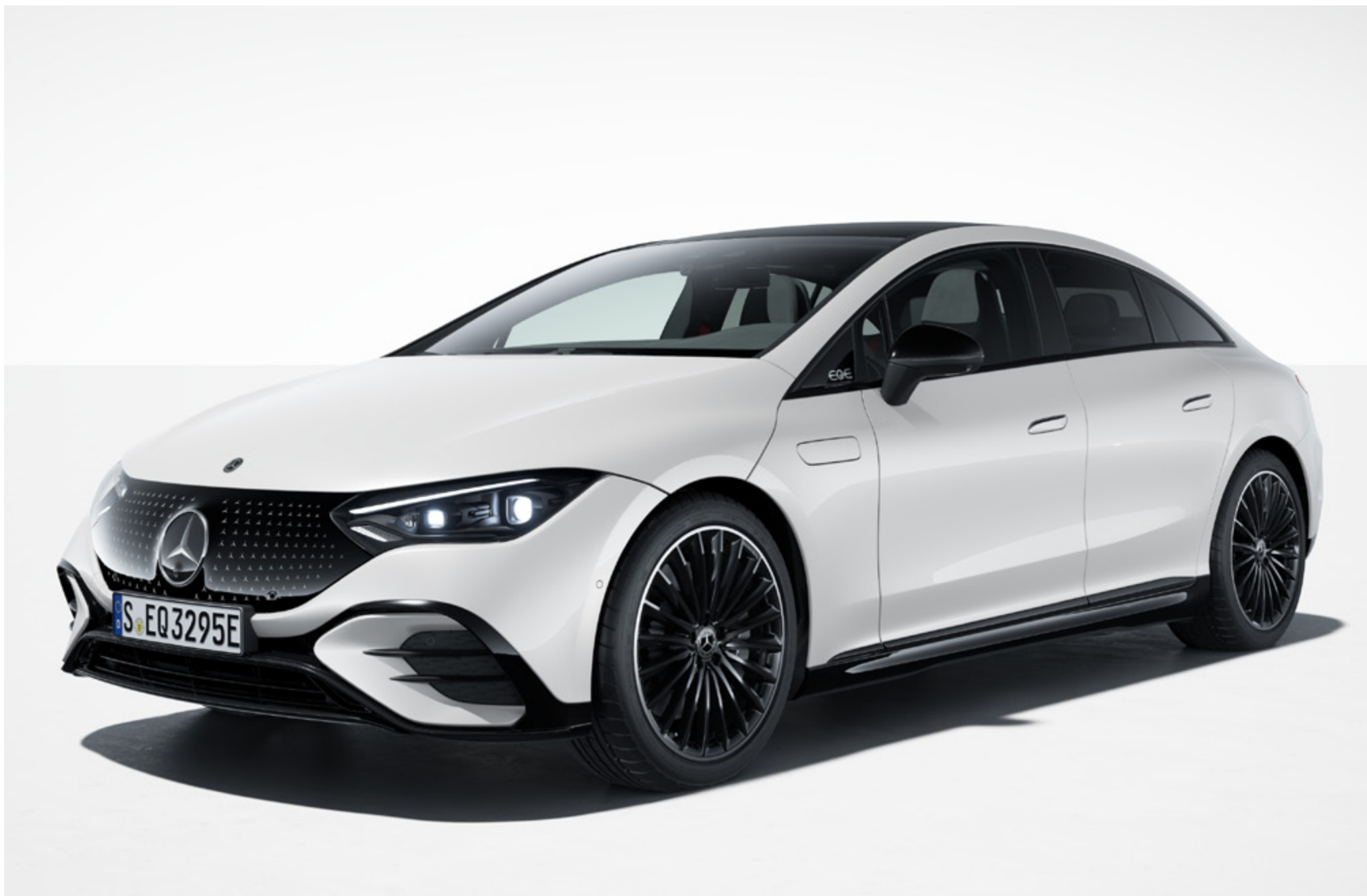
MANUFAKTUR diamond white bright (799U) | 53.3 cm (21") AMG multi-spoke light-alloy wheels (RWI) | Night package (P55) | AMG Line Exterior (P31) | Night Package (P55) | Premium Package (PDC)