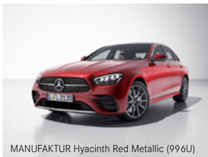
MANUFAKTUR Hyacinth Red Metallic (996U)