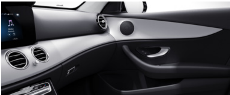
Silver special-effect paint trim (H56)