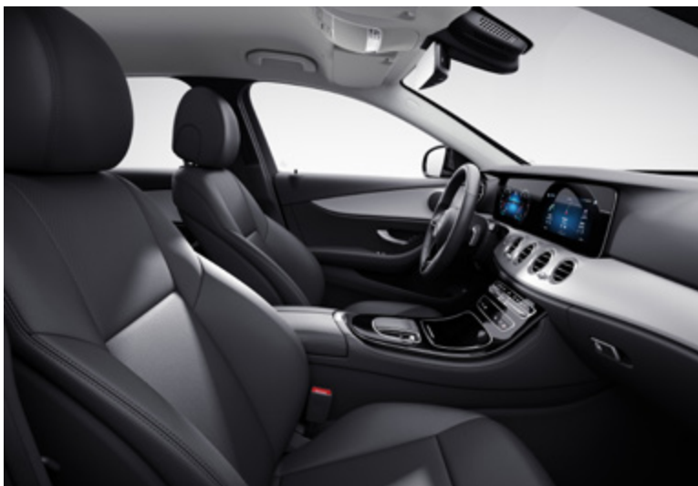
ARTICO man-made leather black (101A)