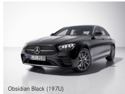
Obsidian Black (197U)