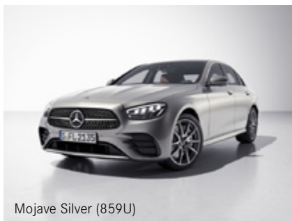
Mojave Silver (859U)