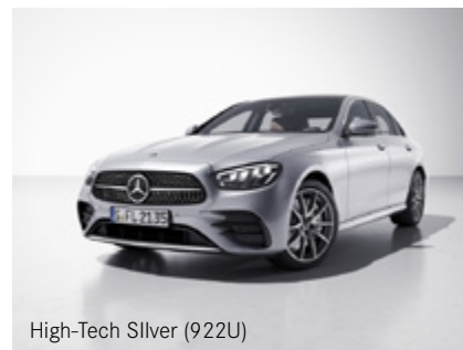
High-Tech Silver (922U)