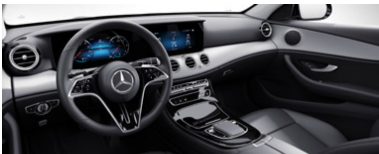
Multifunction steering wheel in nappa leather (L2B)