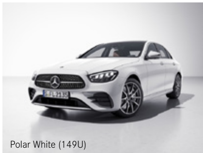
Polar White (149U)