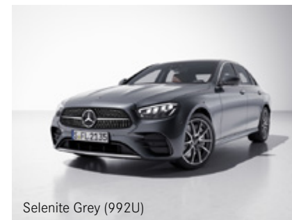
Selenite Grey (992U)