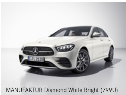
MANUFAKTUR Diamond White Bright (799U)