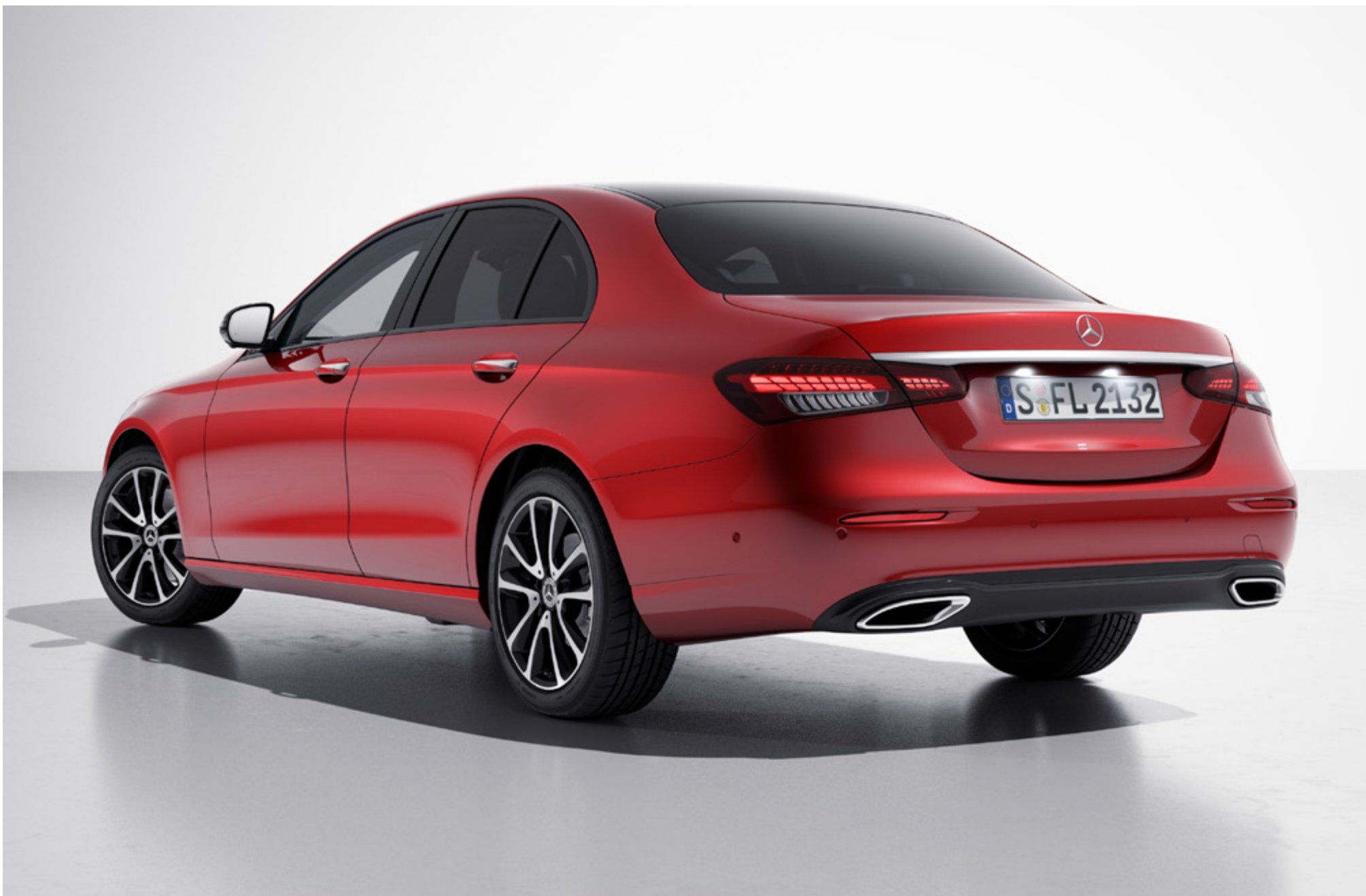
MANUFAKTUR hyacinth red metallic (996U) | 45.7 cm (18") 5-twin-spoke light-alloy wheels (R10) | Heat-insulating dark-tinted glass (840) | AVANTGARDE exterior (P15) | Night package (P55)