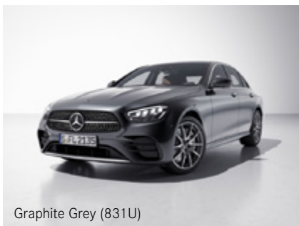
Graphite Grey (831U)