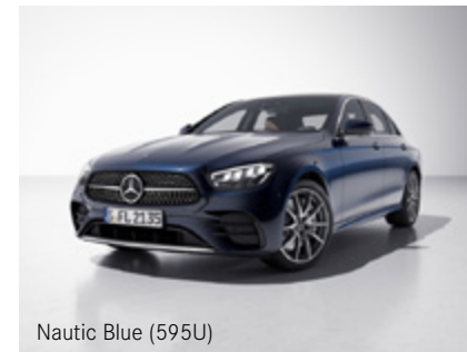
Nautic Blue (595U)