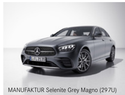
MANUFAKTUR Selenite Grey Magno (297U)