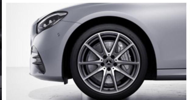
48.3 cm (19") AMG 10-spoke light-alloy wheels (RRD)