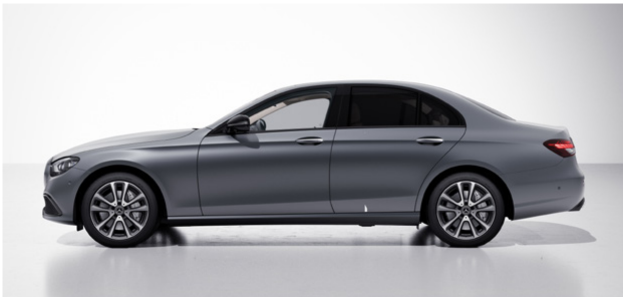
AGILITY CONTROL suspension with selective damping system (485)