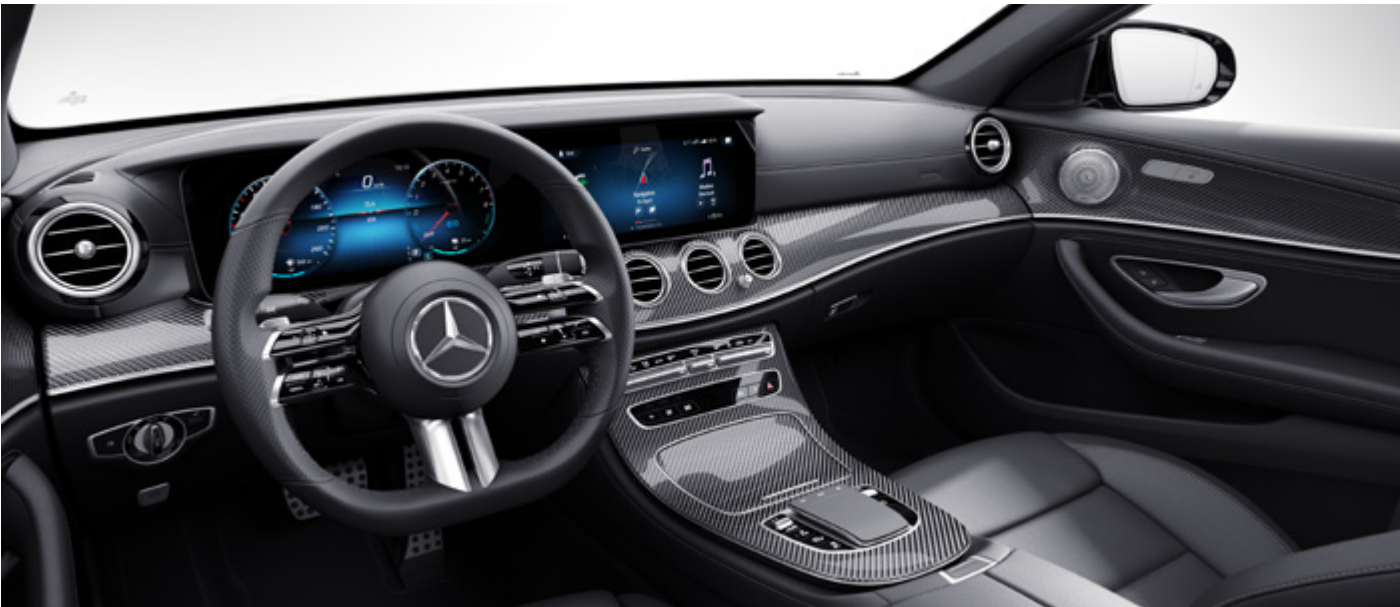
Multifunction sports steering wheel in nappa leather (L5C) | Lining in ARTICO man-made leather (U09)