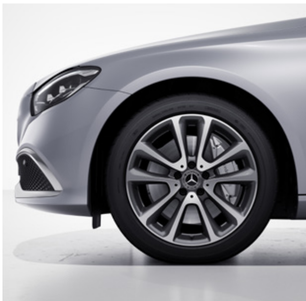
45.7 cm (18"v) 5-twin-spoke light-alloy wheels (22R)