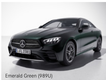
Emerald Green (989U)