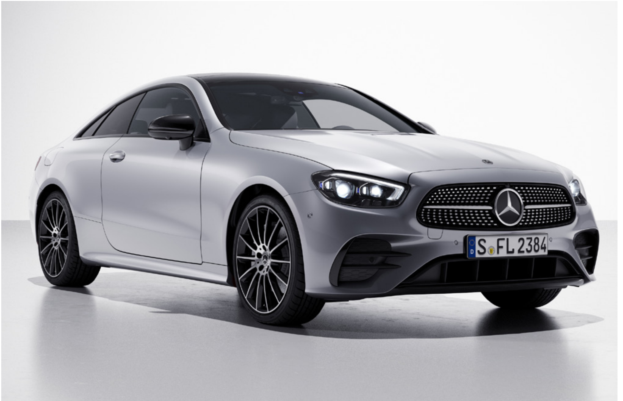
High-tech silver (922U) | 50.8 cm (20") AMG multi-spoke alloy wheels (RVR) | AMG Line exterior (P31) | Night package (P55)