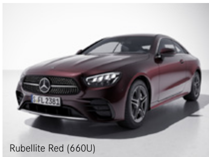
Rubellite Red (660U)