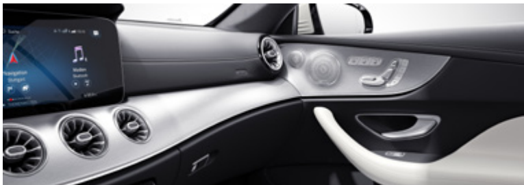
Aluminium trim with light crystal grain (H41) | Galvanised steering-wheel gearshift paddles (431) | Ambient lighting (891)