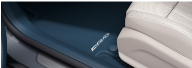
AMG floor mats (U26)