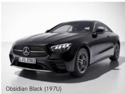
Obsidian Black (197U)