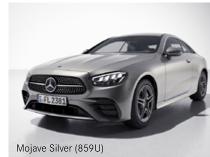
Mojave Silver (859U)