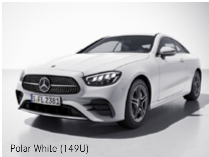
Polar White (149U)