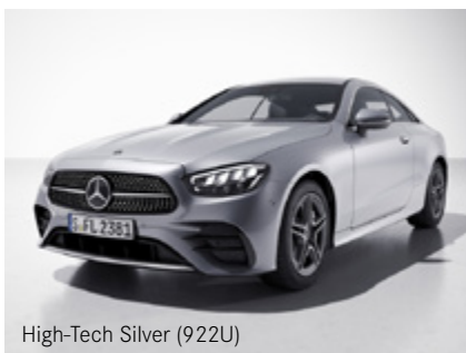
High-Tech Silver (922U)