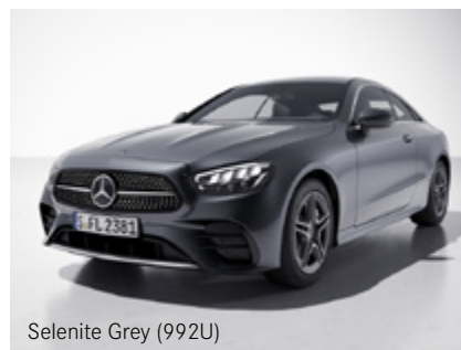
Selenite Grey (992U)