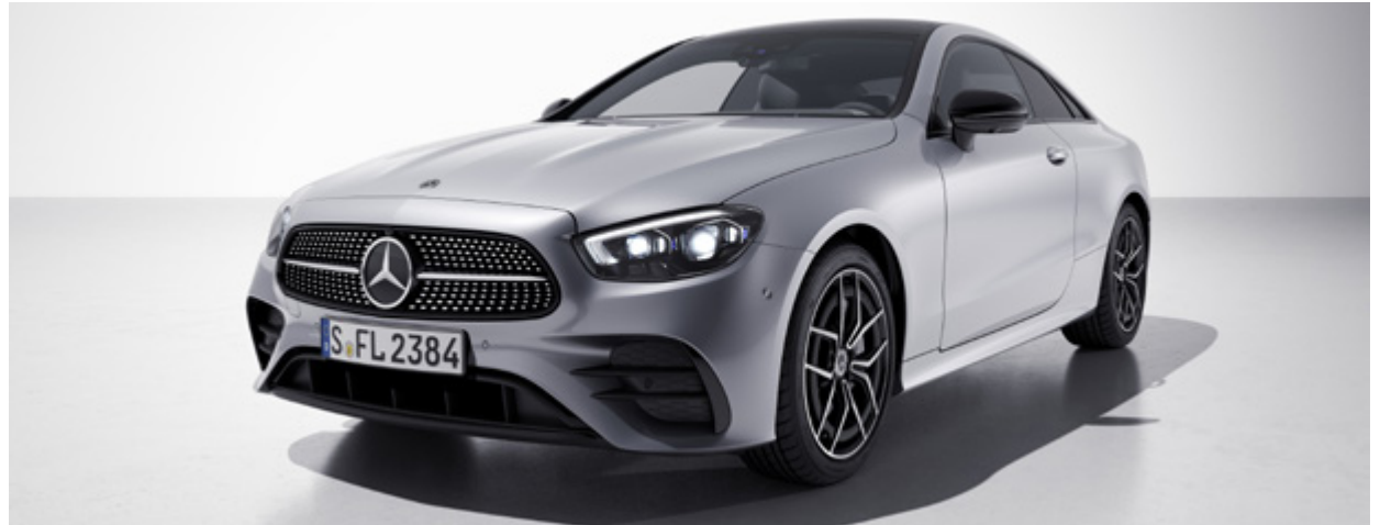
AMG Bodystyling (772) | Wider wheel arch for AMG wheels (776)