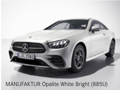
MANUFAKTUR Opalite White Bright (885U)