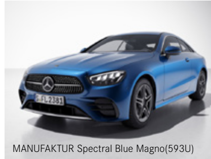
MANUFAKTUR Spectral Blue Magno(593U)