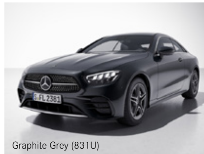
Graphite Grey (831U)