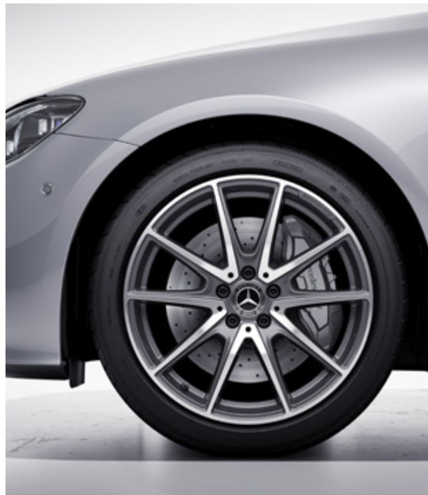
48.3 cm (19") AMG 10-spoke light-alloy wheels (RRD)