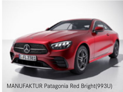
MANUFAKTUR Patagonia Red Bright(993U)