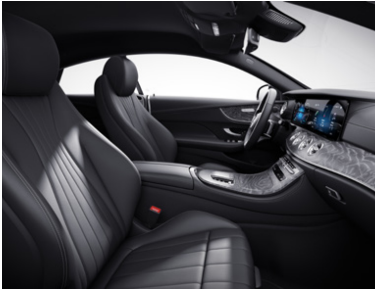
Leather black (201A) | Multifunction sports steering wheel in nappa leather (L5C)