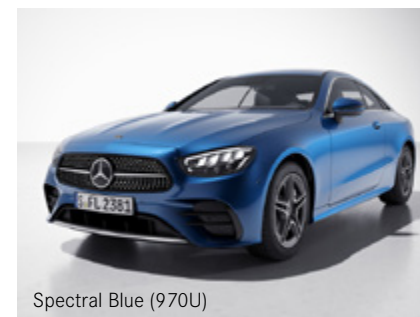
Spectral Blue (970U)