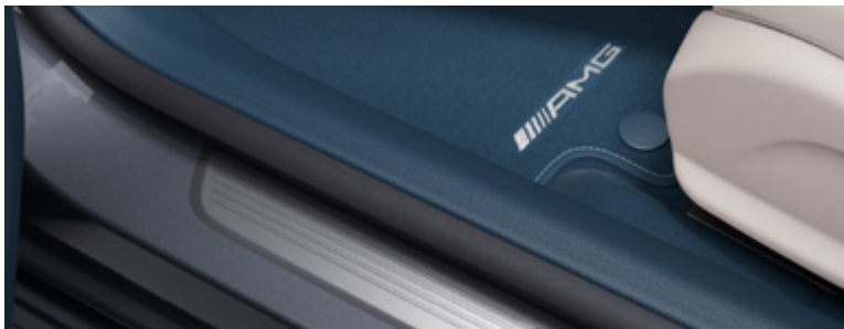
AMG floor mats (U26) | Galvanised steering-wheel gearshift paddles (431)