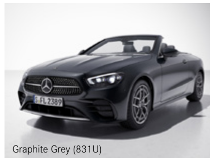
Graphite Grey (831U)