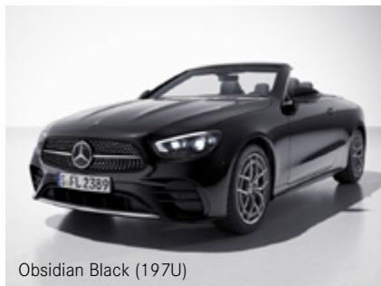
Obsidian Black (197U)