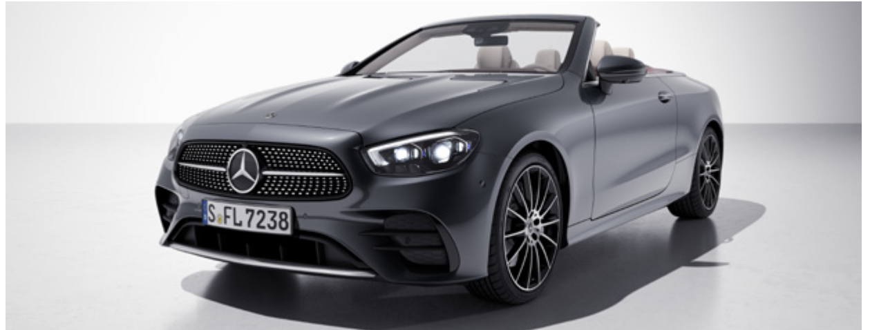
AMG Bodystyling (772) | Wider wheel arch for AMG wheels (776)