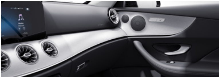
Light longitudinal-grain aluminium trim (H41)