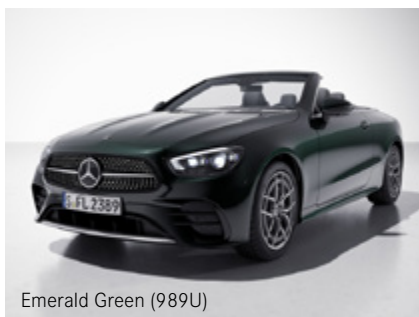
Emerald Green (989U)