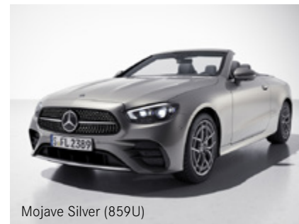
Mojave Silver (859U)