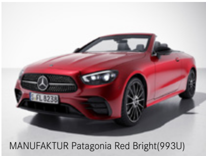
MANUFAKTUR Patagonia Red Bright(993U)