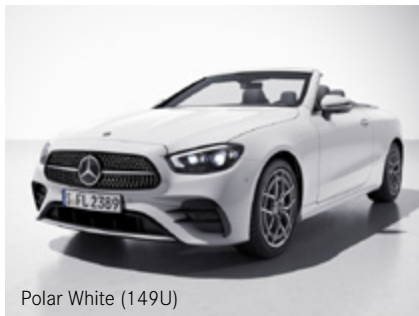
Polar White (149U)