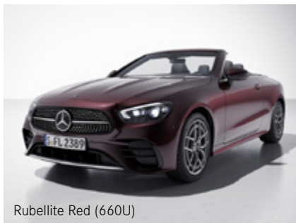
Rubellite Red (660U)