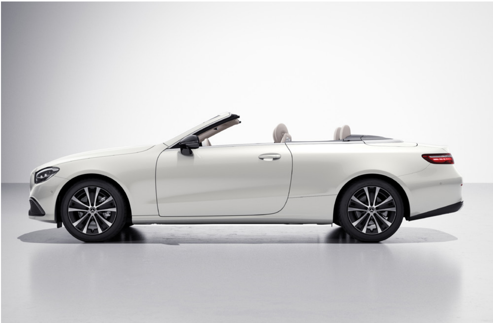
MANUFAKTUR patagonia red bright (993U) | 50.8 cm (20") AMG multi-spoke alloy wheels (RVR) | Fabric soft top in black (740) | AMG Line exterior (P31) | Night Package (P55)