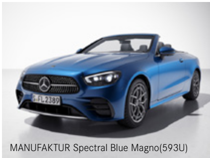
MANUFAKTUR Spectral Blue Magno(593U)