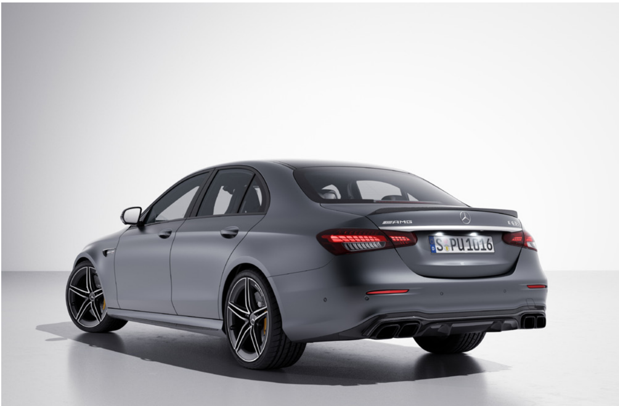
Mercedes-AMG E 63 S 4MATIC+ | MANUFAKTUR selenite grey magno (297U) | 50.8 cm (20") AMG 5-twin-spoke light-alloy wheels (RZX) | AMG Night package (P60) | AMG Exterior Carbon-Fibre package I & II (773) & (B28)