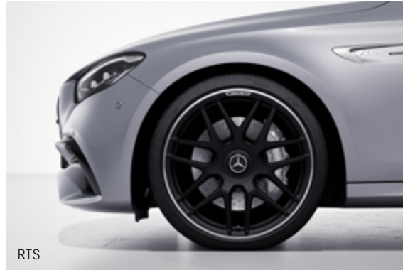
50.8 cm (20") AMG cross-spoke forged wheels