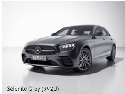
Selenite Grey (992U)