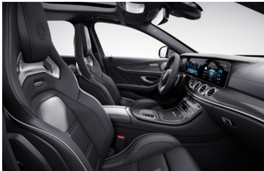
AMG Exclusive nappa leather - black (561A) | AMG Performance steering wheel in nappa leather/DINAMICA microfibre (L6K)