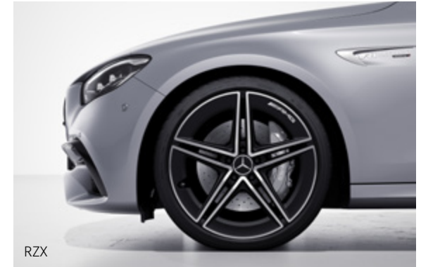
50.8 cm (20") AMG 5-twin-spoke light-alloy wheels