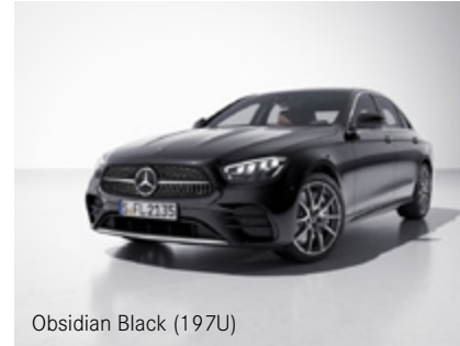
Obsidian Black (197U)