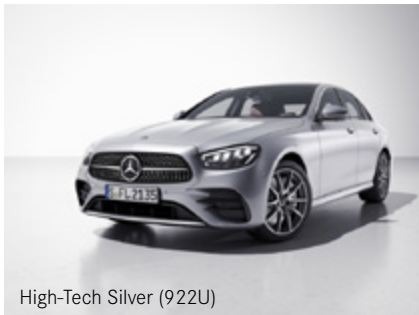
High-Tech Silver (922U)