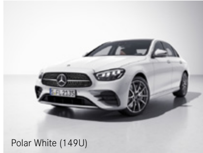
Polar White (149U)