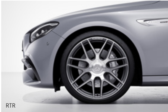
50.8 cm (20") AMG cross-spoke forged wheels