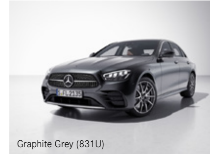
Graphite Grey (831U)