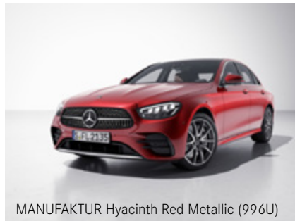
MANUFAKTUR Hyacinth Red Metallic (996U)