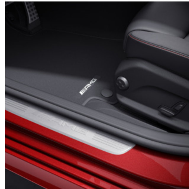
AMG spoiler lip (U47) | AMG bodystyling (772) | Heated front seats (873) | AMG floor mats (U26) | Dashboard and door beltlines in nappa leather (U38)