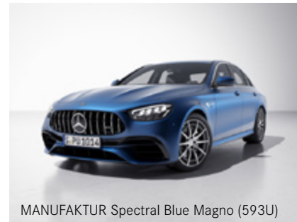
MANUFAKTUR Spectral Blue Magno (593U)