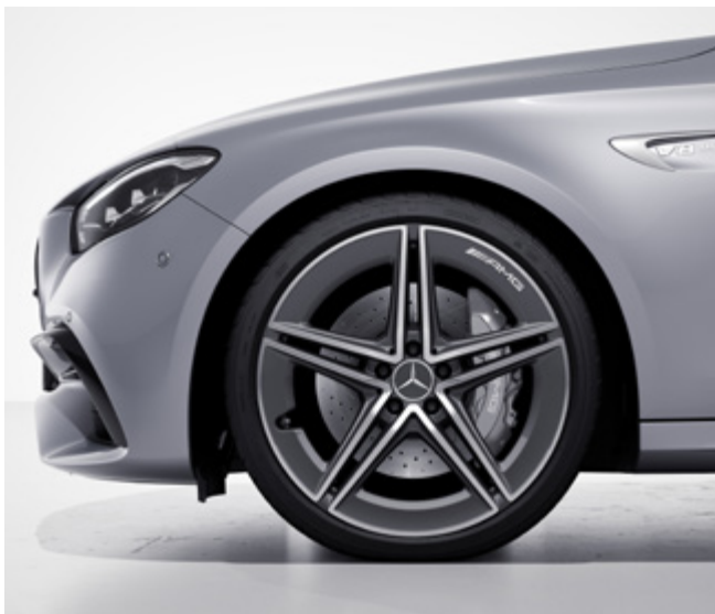
50.8 cm (20") AMG 5-twin-spoke light-alloy wheels (RZU)