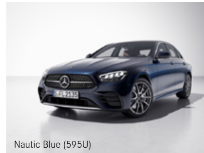
Nautic Blue (595U)