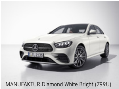
MANUFAKTUR Diamond White Bright (799U)