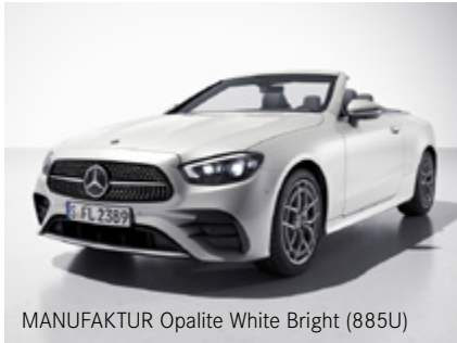
MANUFAKTUR Opalite White Bright (885U)