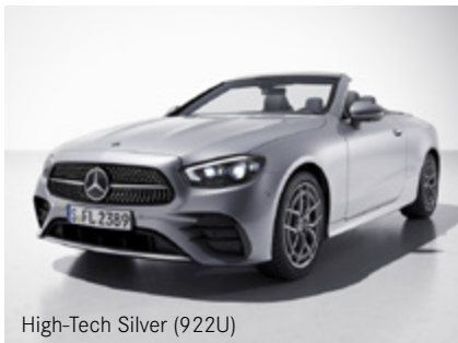
High-Tech Silver (922U)