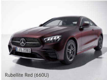
Rubellite Red (660U)