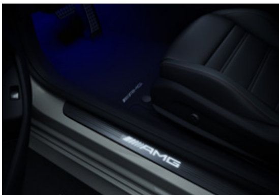
AMG floor mats (U26)