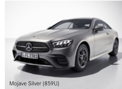
Mojave Silver (859U)