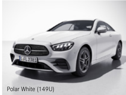
Polar White (149U)