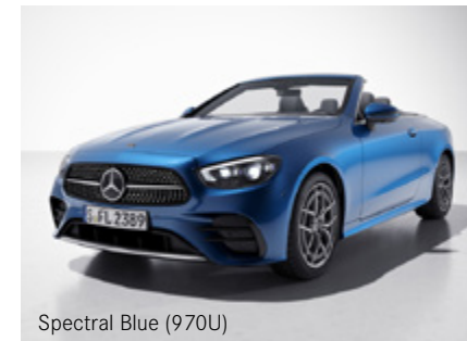
Spectral Blue (970U)