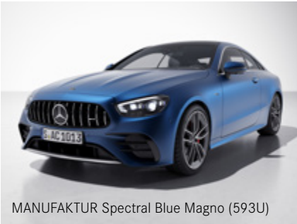
MANUFAKTUR Spectral Blue Magno (593U)