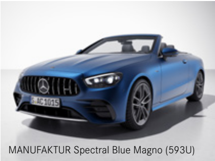
MANUFAKTUR Spectral Blue Magno (593U)