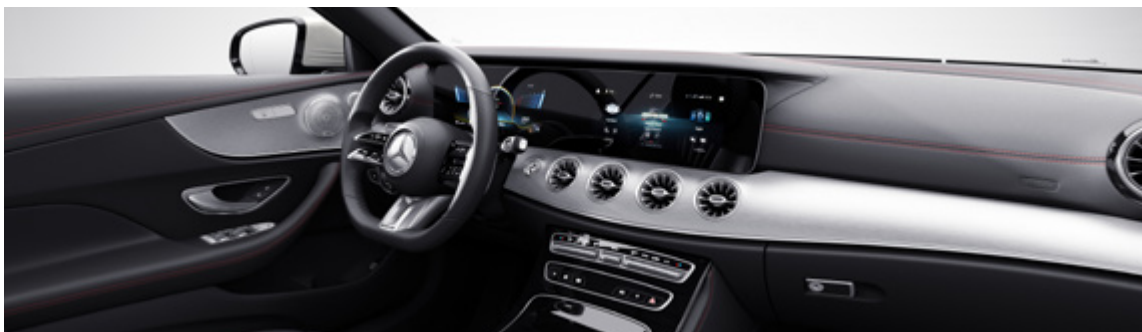
AMG Performance steering wheel in nappa leather (L6J) | Light longitudinal-grain aluminium trim (H41)