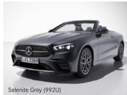
Selenite Grey (992U)