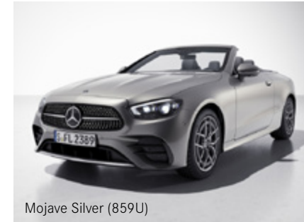
Mojave Silver (859U)