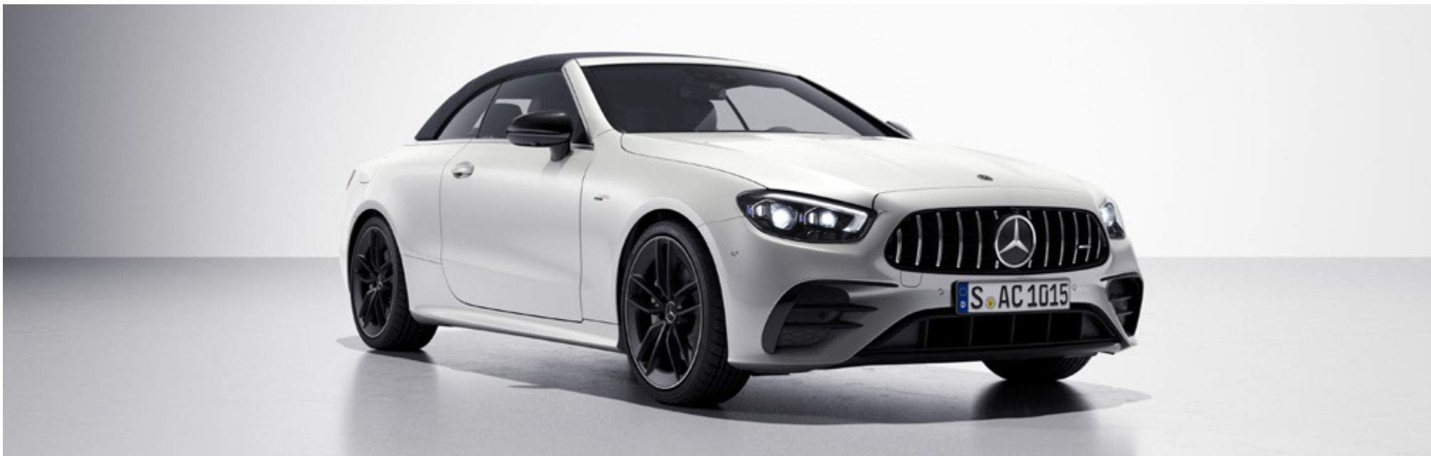
MANUFAKTUR opalite white bright (885U | 50.8 cm (20") AMG 5-twin-spoke light-alloy wheels (RZS) | AMG Night package (P60) | Mercedes-AMG exterior (P31)