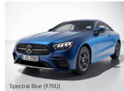
Spectral Blue (970U)