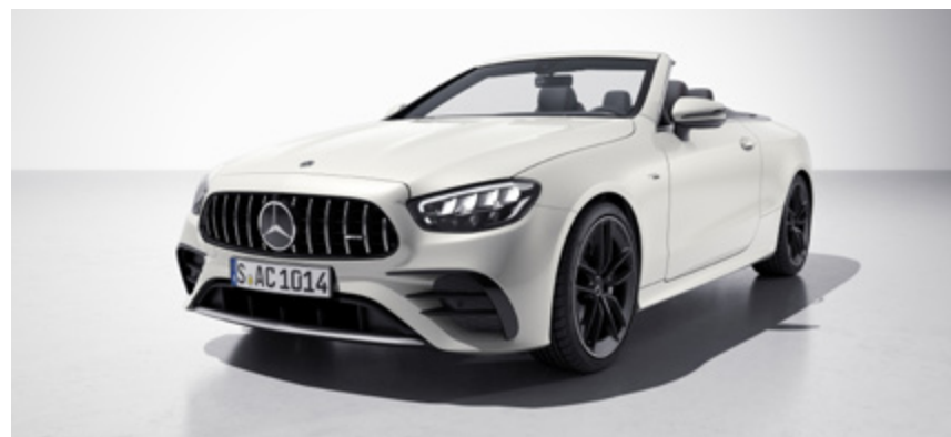
AMG bodystyling (772) | AMG RIDE CONTROL+ (489) | AMG spoiler lip (U47)