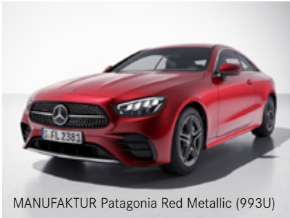
MANUFAKTUR Patagonia Red Metallic (993U)