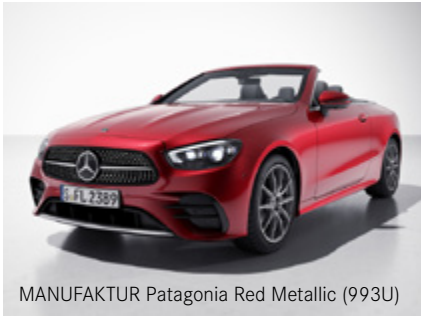
MANUFAKTUR Patagonia Red Metallic (993U)