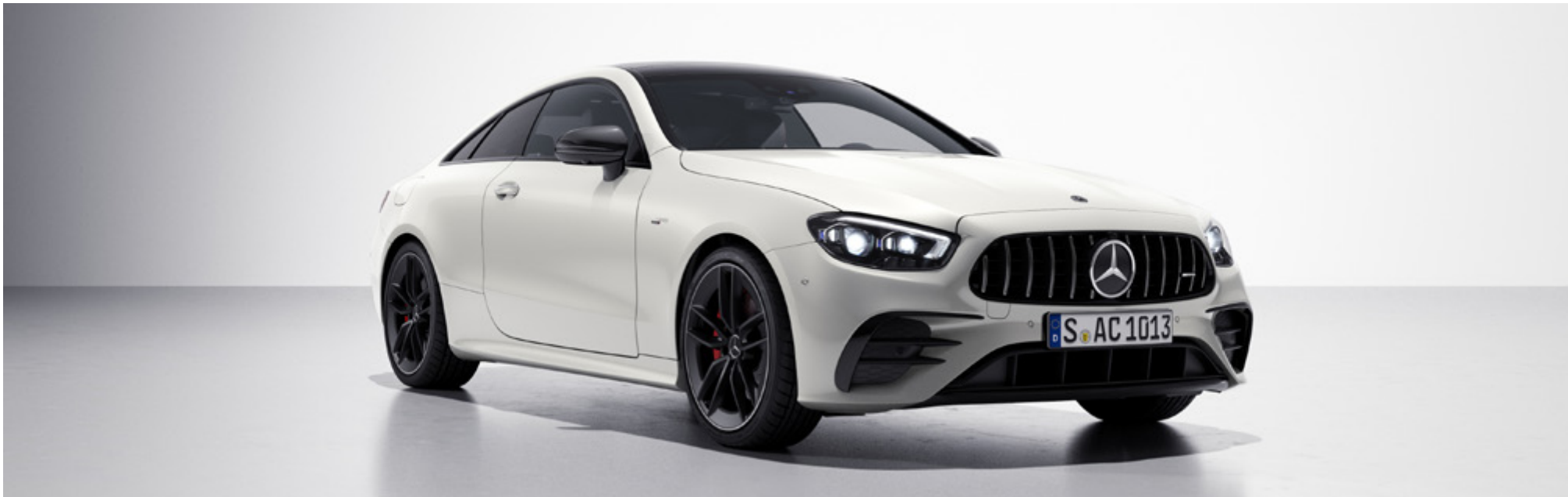
MANUFAKTUR diamond white bright (799U) | 50.8 cm (20") AMG 5-twin-spoke light-alloy wheels (RZS) | AMG Night package (P60) | Mercedes-AMG exterior (P31)