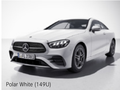
Polar White (149U)