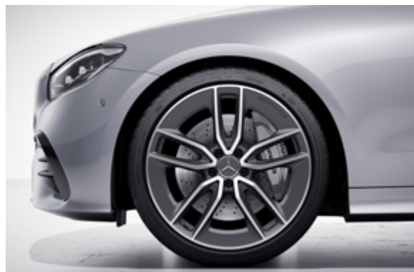
50.8 cm (20-inch) AMG 5-twin-spoke light-alloy wheels (RZT)