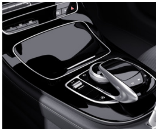
ARTICO man-made leather / DINAMICA microfibre black (651A) | Centre console in black piano-lacquer look (728)