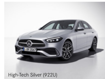
High-Tech Silver (922U)