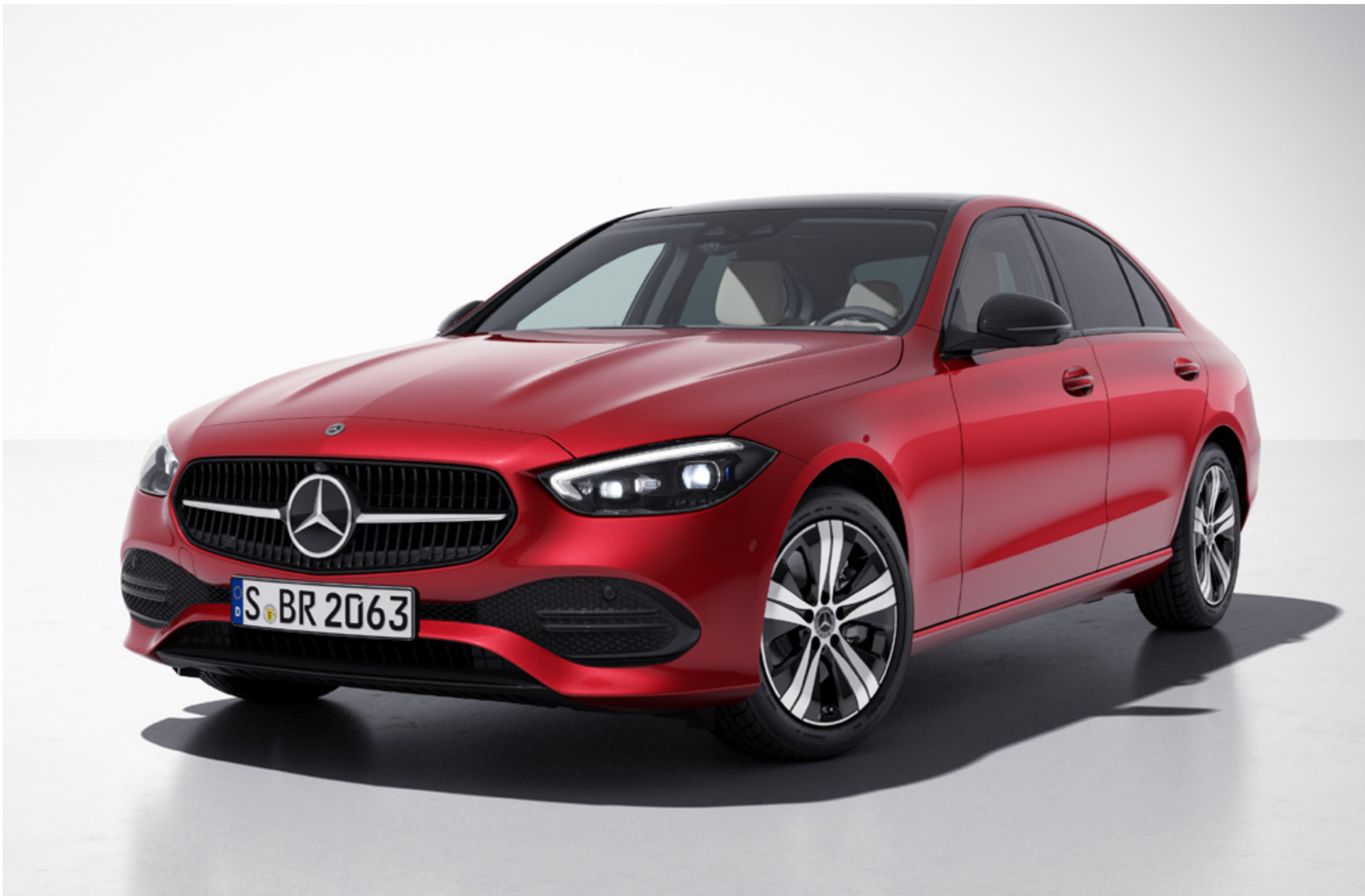
MANUFAKTUR patagonia red bright (993U) | 45.7 cm (18") multi-spoke light-alloy wheels (R86) | Night package (P55) | AVANTGARDE exterior (P15)