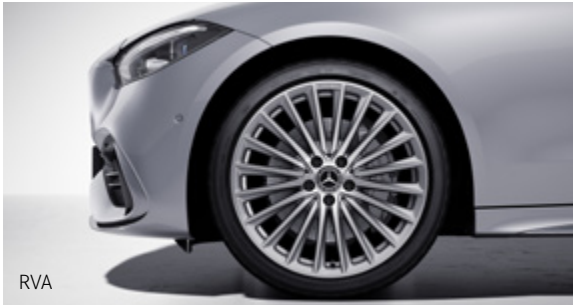
RVA 48.3 cm (19") AMG multi-spoke light-alloy wheels In conjunction with P31