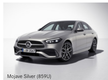
Mojave Silver (859U)