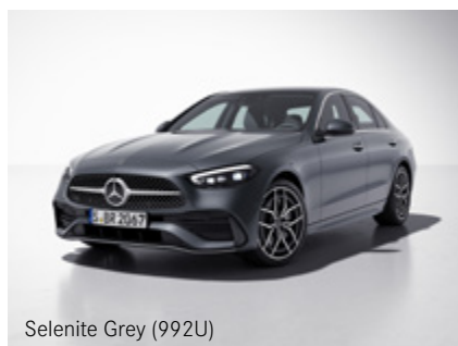
Selenite Grey (992U)