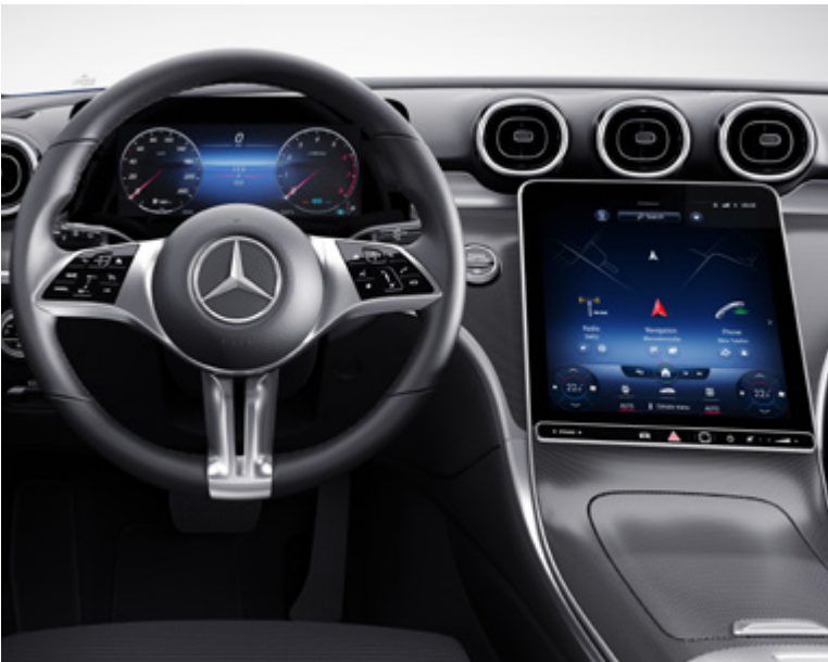
Leather multifunction sports steering wheel (L3E) | Silver grey diamond-pattern trim (H50)