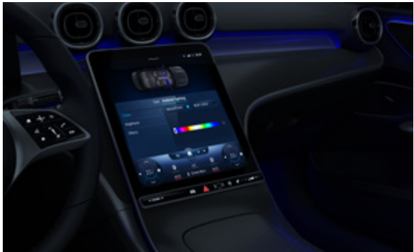
Ambient lighting (891)