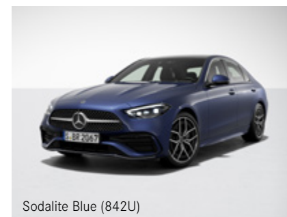
Sodalite Blue (842U)