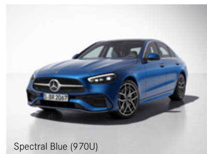
Spectral Blue (970U)