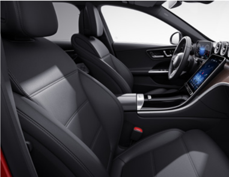
ARTICO man-made leather black (101A)