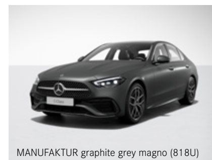
MANUFAKTUR graphite grey magno (818U)