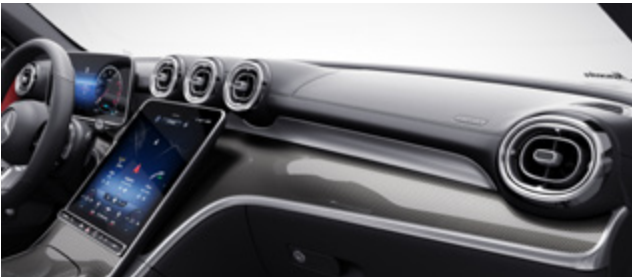
Instrument panel & beltlines in ARTICO man-made leather nappa look (U34)