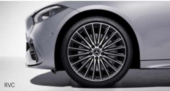
RVC 48.3 cm (19") AMG multi-spoke light-alloy wheels Only in conjunction with P31+P55 (P55 at additional cost) R 5,000