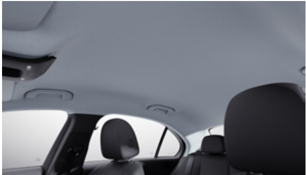
Roof liner in crystal grey fabric (58U)