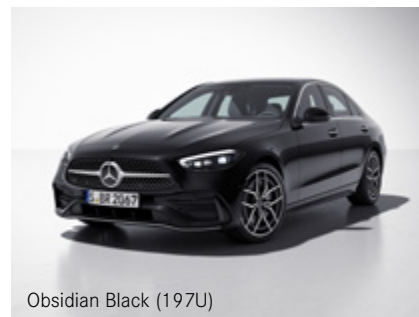
Obsidian Black (197U)