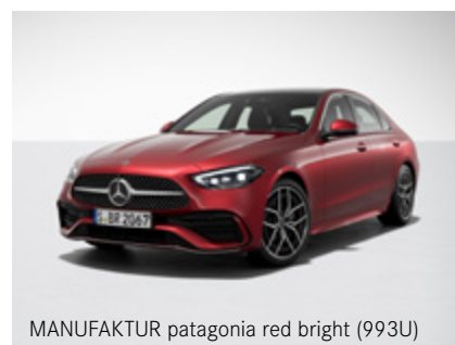
MANUFAKTUR patagonia red bright (993U)