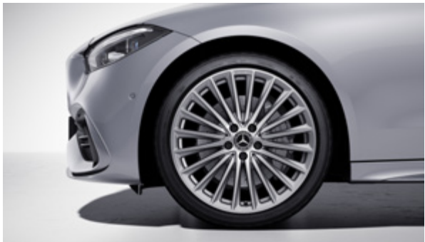
48.3 cm (19") AMG multi-spoke light-alloy wheels (RVA)