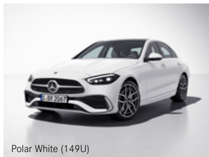
Polar White (149U)