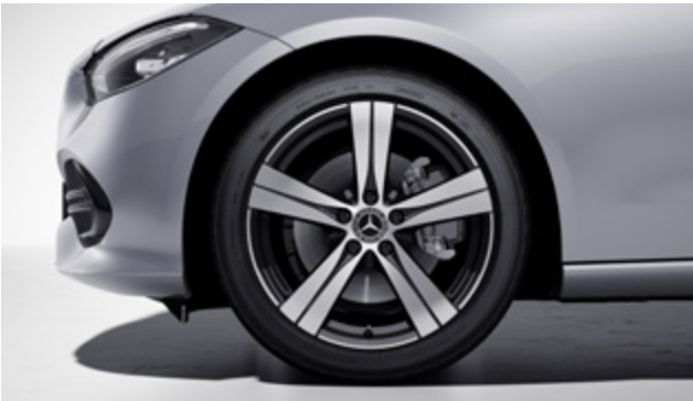
45.7 cm (18") 5-spoke light-alloy wheels (R32)