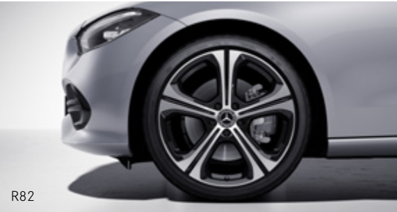
R82 48.3 cm (19") 5-spoke light-alloy wheels (OICW P15+R06 | Automatically added with P55)