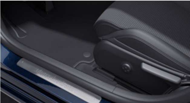
Velour floor mats (U12)