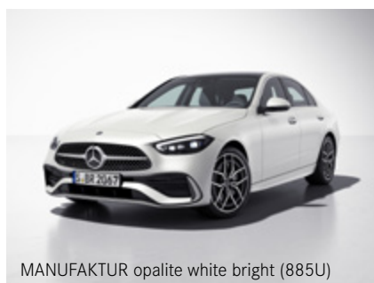
MANUFAKTUR opalite white bright (885U)