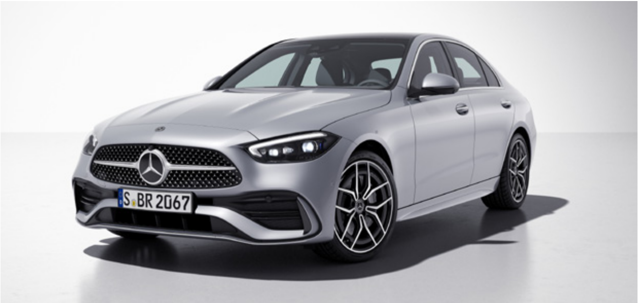
Diamond grille (5U4) | AMG bodystyling (772) | Braking system with larger brake discs on the front axle (U29) | Interior light package (876)