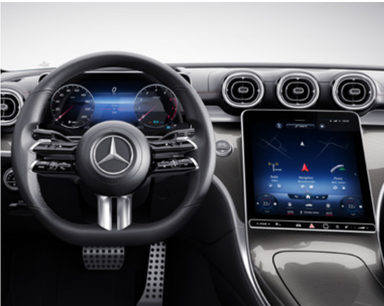
Multifunction sports steering wheel in nappa leather (L5C) | Metal-weave trim (H64)