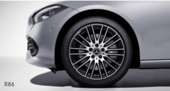
R86 45.7 cm (18") multi-spoke light-alloy wheels In conjunction with P15