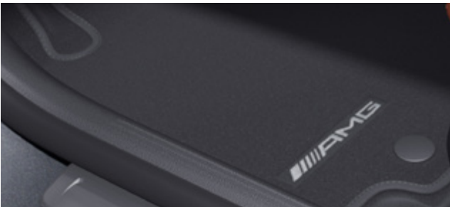
AMG floor mats (U26) | Black roof liner (51U) | Grey Roof Liner (58U)