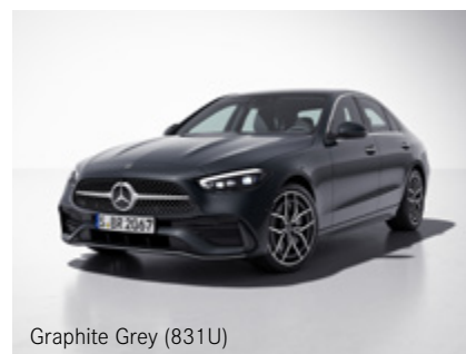
Graphite Grey (831U)