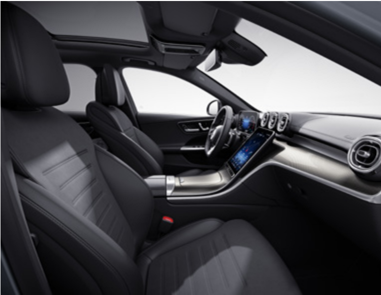
ARTICO man-made leather/DINAMICA microfibre black (601A) | Sports seats (7U3)