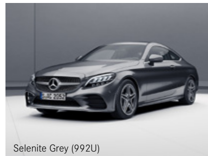
Selenite Grey (992U)