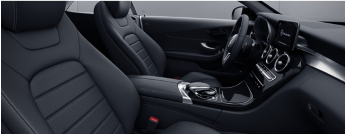
ARTICO man-made leather black (101A)