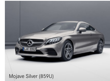
Mojave Silver (859U)