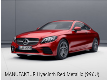
MANUFAKTUR Hyacinth Red Metallic (996U)