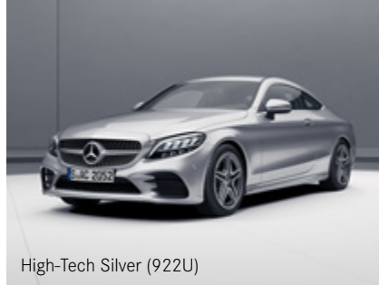
High-Tech Silver (922U)