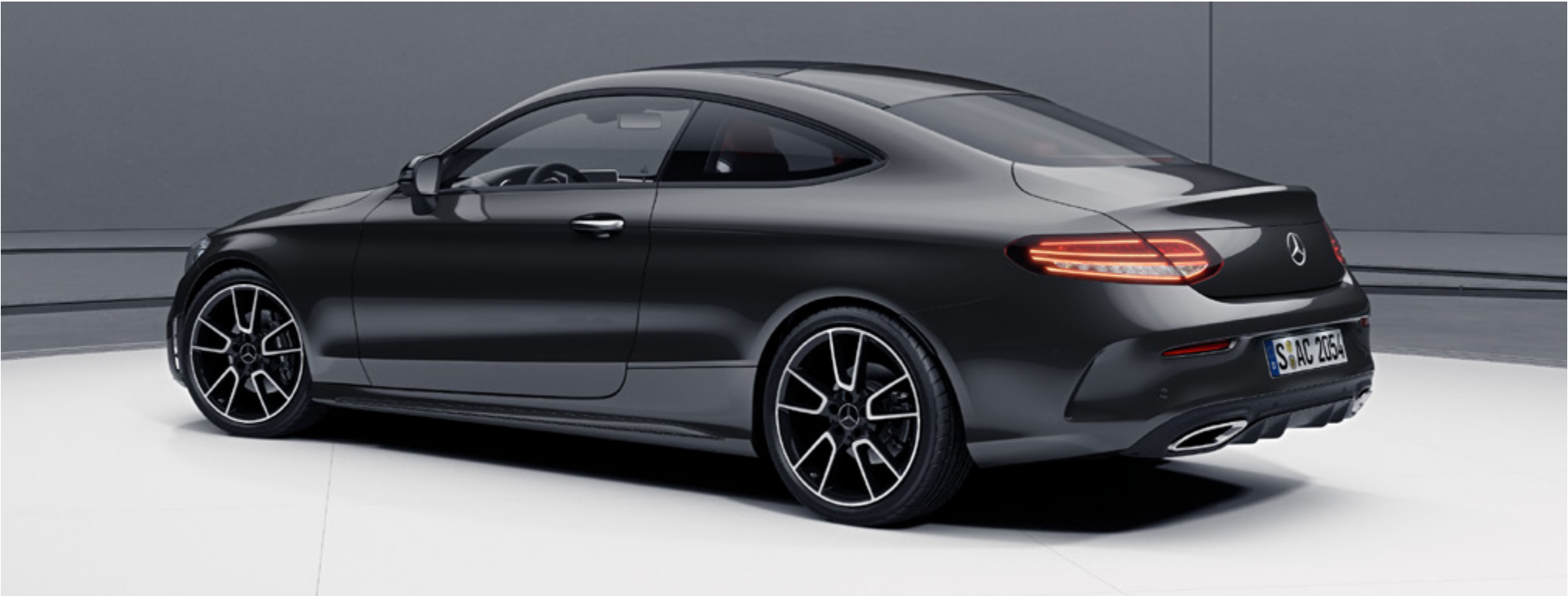
Graphite grey (831U) | 48.3 cm (19") AMG 5-twin-spoke light-alloy wheels (604) | AMG Line exterior (P31) | Night package (P55)