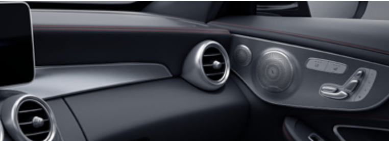
Dark aluminium with longitudinal grain with trim options below: