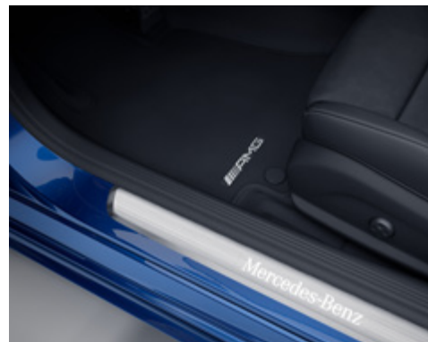
AMG floor mats (U26)