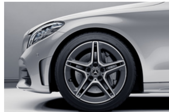
45.7 cm (18") AMG 5-spoke light-alloy wheels (RSJ)