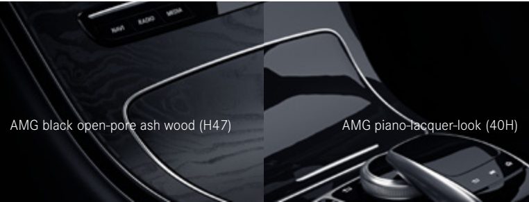
AMG black open-pore ash wood (H47)