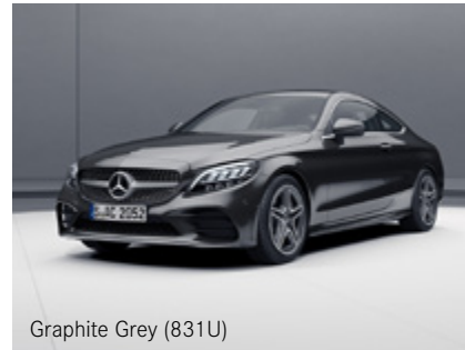
Graphite Grey (831U)