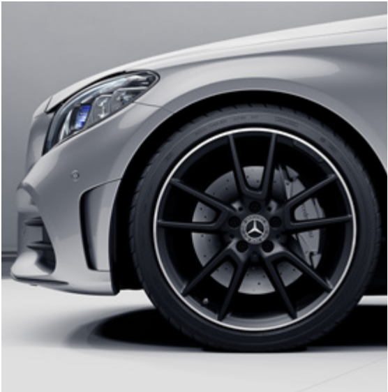
48.3 cm (19 inch) AMG 5-twin-spoke light-alloy wheels (RTA)