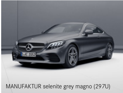
MANUFAKTUR selenite grey magno (297U)