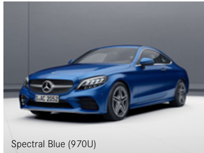
Spectral Blue (970U)