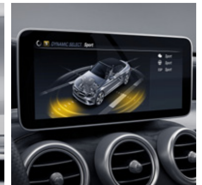
DYNAMIC SELECT (B59)