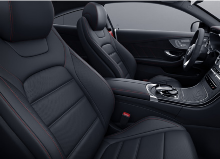
ARTICO man-made leather / DINAMICA microfibre AMG black (641A) | Red Seat Belts (Y05 - Optional)