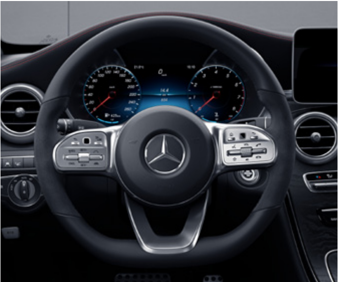
Multifunction sports steering wheel in nappa leather/DINAMICA microfibre (L51)