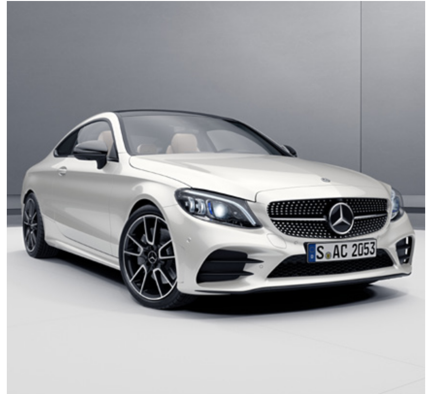
Diamond grille (5U4) | AGILITY CONTROL (677) | AMG bodystyling (772)