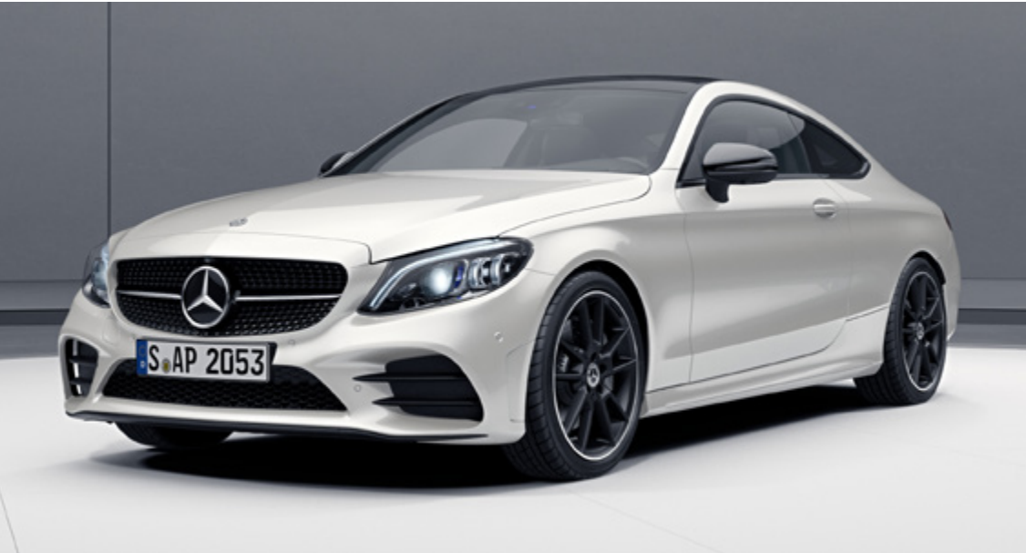
AMG Line Interior (P29) | AMG line Exterior (P31) | Night Package(P55) | AMG spoiler lip (U47) Surround lighting with projection of brand logo (586) | Interior Light package (876)