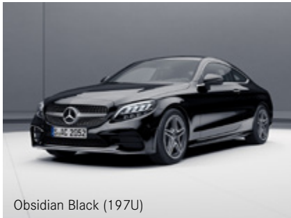
Obsidian Black (197U)