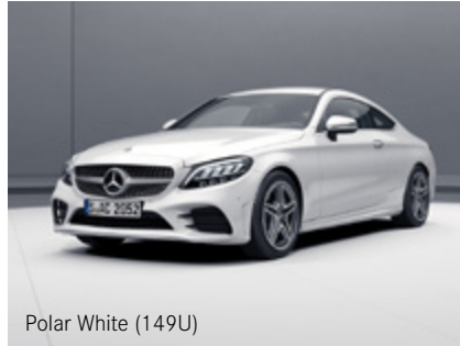
Polar White (149U)