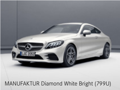
MANUFAKTUR Diamond White Bright (799U)