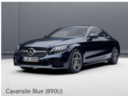
Cavansite Blue (890U)