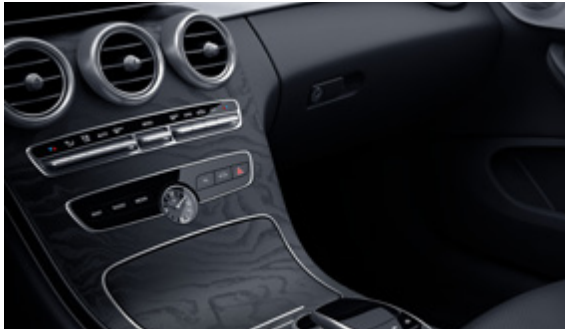
open-pore black ash wood (737) | light longitudinal-grain aluminium (739)